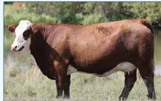
MADGE MS SCARLETTE 32K - Dam of Lot 3

We are hoping this is the start to an extra age/2-year-old division for our bull sale. 101M is a bull I think really highly on, off of a beautiful Anchor D Zam daughter with a picture-perfect udder. Marley has a very strong pedigree to go with his standout presence; this guy is equivalent to a human body builder. There's so much I could say about this bull, but I think I'll let his sale picture/sale video do the talking. Power, power, power!! One we would love to keep in our herd.