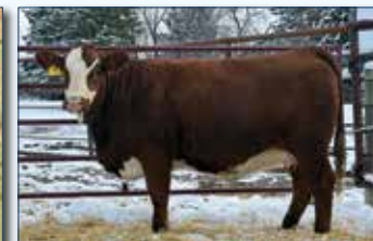
MADGE MS BOMBSHELL 51M Maternal Sister of Lot 14 Sold to Springside Cattle Co.