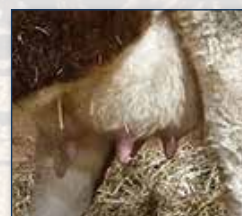
VIRGINIA FREIDA 832F Udder - Dam of Lot 12