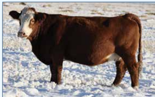
ANCHOR D KALISTA 290K - Dam of Lot 11

The only chance of two to get a bull off of Ayatollah, his life was short here and we sure wish we would've collected semen off him, a bull that we were sad to see go.