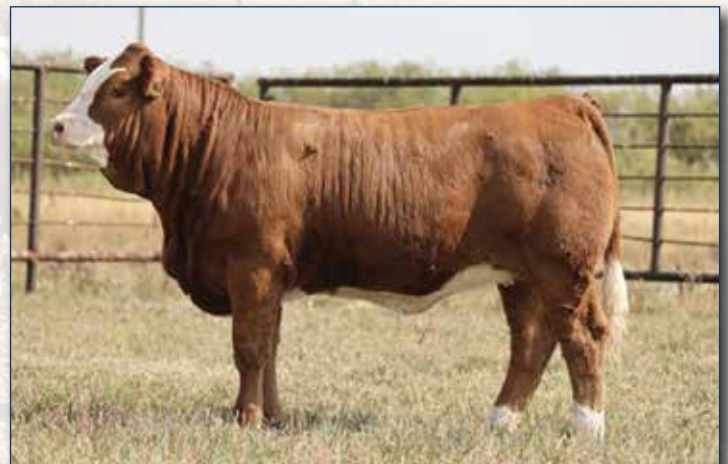
Full Sister - Sold to JNR Farms