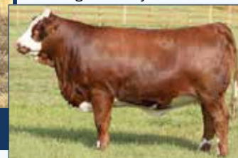
BLACK GOLD MS BOMBSHELL 61K Dam of Lot 14

News at 5 is a maternal brother to the bred heifer we sold this past year in the Western Harvest for $22,000 to Springside Cattle Co. The dam to this calf is very moderate in her make, with lots of depth of body with an amazing udder. Sired by our Virginia Skynyrd bull, we feel ON could really go in any direction whether that's back on registered cows or a wide variety of commercial cattle. One that'll continue to get better with time, and leave a lasting mark on your herd.