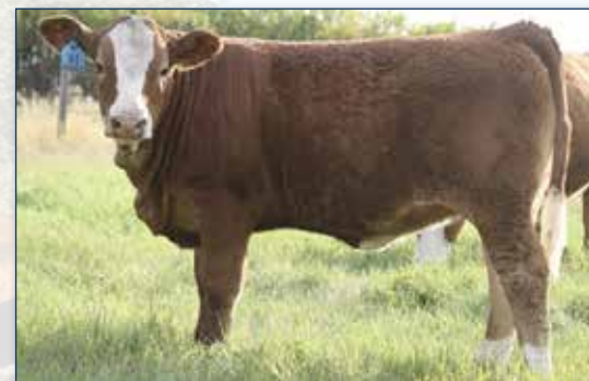
Maternal Sister of Lot 12 - Sold to Beechinor Bros Simmentals