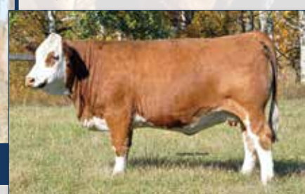
VIRGINIA LOREENA 362L - Dam of Lot 15

The first Virginia Rush son of two and one with a bit more power than his paternal brother in the sale. Nia is off of another stunning Virginia