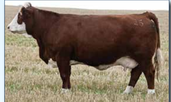
ANCHOR D FELESHA 395F - Dam of Lot 6