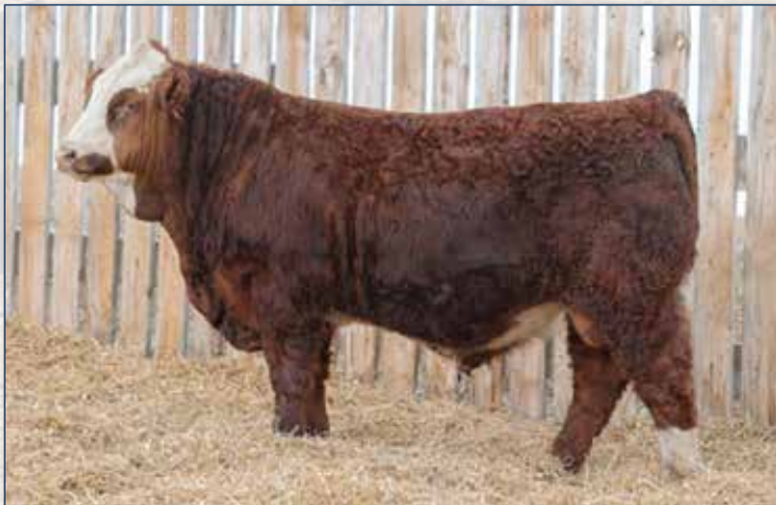
MADGE MR MOONWALK 59M - Future Herd Sire at Madge Simmentals

Just like his name, this son of 63D and Cannon is really a no-brainer.