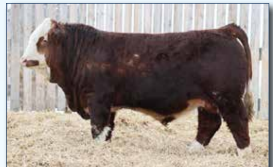
MADGE MR MEGATRON 52M - Maternal Brother of Lot 6