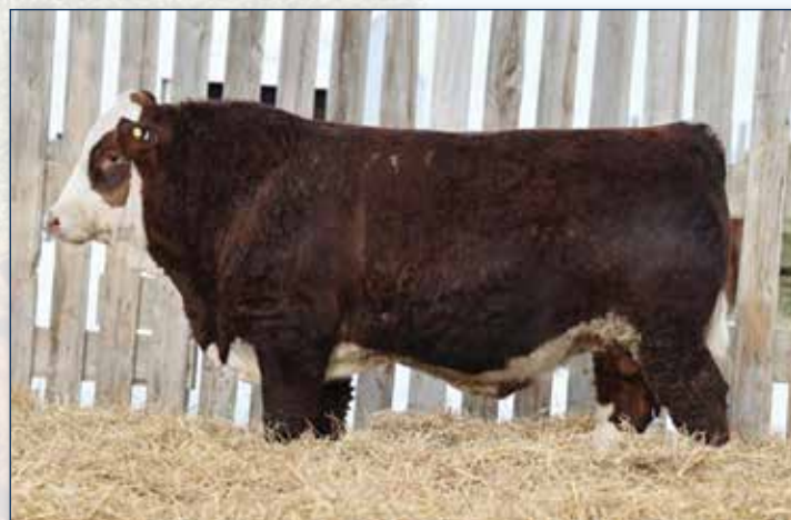
Full Sibling - Sold to Logan Brothers

Nailed It is the real deal and a bull we are quite excited to see the future of. If you like ones that grow fast and weigh up in the fall, then consider Lot 2. Full sister sold in 2022 to Virginia Ranch.