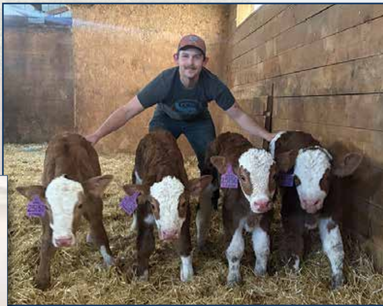
4 Lone Stone Cannon 210H calves from our April embryo program