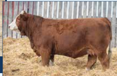
BEE FAITH 212K - Dam of Lot 13

25N comes from a cow that we purchased a few years back from Beechinor Bros, she was our top pick from their offering and a female that goes back to Ricochet Yonita 148Y who we used to own. When we mated 212K to