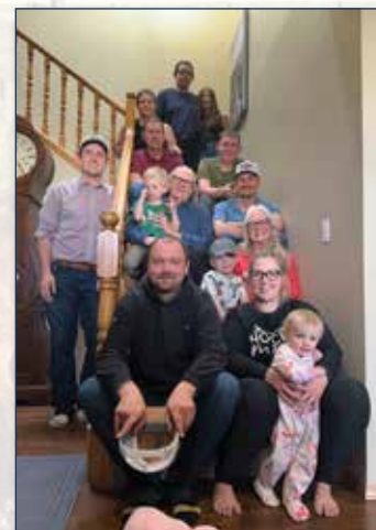
The Madge Family

This is our second and last extra age bull for this year's sale and he's another bull that we are super proud of. Mars is the only calf off the 2284 cow. We lost her this past year to a bad weed on pasture; this cow was going to have a beautiful future as she was stunning. She was one that anyone would be happy to have a 100 of in their pasture. 102M is very free in his movement, showcasing an incredible length of spine, shoulder and structure. If you're looking for something that'll breed a few extra cows this year, then look no further.