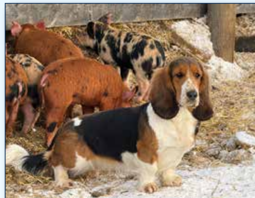
Rosie, Madge Simmentals favourite blaze face

His calving ease numbers say heifer bull, but we'd recommend this bull for second calvers and up.