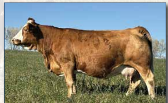
JB CDN FERNANDA 1672 - Dam of Lot 7

26N is a Skynyrd son that we really think could benefit any herd. His dam Fernanda is a favourite from our Bruketa purchase 3 years ago. 9 coming 10 years of age the old girl looks like she'll continue to be producing some good ones for many years to come. Nando is a big hipped, curly haired, quiet bull that will produce some hellish good calves in his time. His tan colour is hard to find today in the fullblood market and I think he'd compliment a variety of cows. If you like the good ones then take a look here.