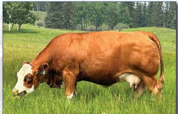
JB CDN EDDA 1809 - Dam of Lot 10

Big time power bull right here, being born almost in the middle of February a person wouldn't be able to tell. 80N is going to be a big bull one day and with his growth this guy has dollar signs all over him. If you sell your calves by the pound and are looking to gain even more in this great cattle market, then No Problem is the bull for you. Probably the biggest framed Cannon son we've ever had, and for a polled bull he doesn't give up on any performance. 1809 the dam to this bull is a larger framed cow with a very level tidy udder, strong foot and the building blocks to create a great bull like this. We welcome you to tour the cow herd, if you'd like to see the dams to these bulls.