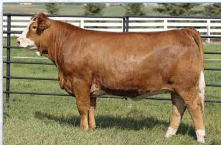
KSL LADY AMOURA 26K - Dam of Lot 5

NO MANS LAND is quite a cool bull. 9N has been a standout since the day he was born and we couldn't be any more pleased with how he's matured since then. Coming from our KSL Lady Amoura 26K cow who is in my eyes one that'll make a big name for herself in a few short years. When we mated Lady to Zam we knew we'd be happy with the results, and I really think it worked as perfectly as it could've. If you're looking for an easy maintaining, heifer making, steer/bull making breeding machine then No Mans Land is a good fit for you.