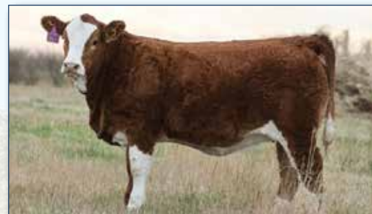
Maternal Sister of Lot 12 - Sold to Lone Stone Farms