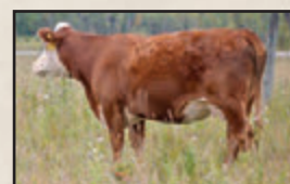
YV 94D, DAM OF 21M

This big goggled, big made embryo son, which is a full brother to 17M will be sure to catch your eye. His maternal sister was our very best first calver last spring with a big future ahead of her. You will find the same maternal power in 21M.