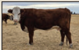
U 97K, DAM OF 69M

A rare package here, a complete outcross. 69M was purchased in calf in the high-selling female at the Ulrich Herefords dispersal. With true Hereford character, he is ideally-marked, mossy-haired, and a direct descent of Peters cornerstone cow, 129X. His dam 97K is a tremendous young cow that we couldn't be happier with. 69M has froze semen and will be utilized in our AI program in 2026.