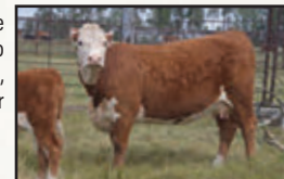
YV 131G, DAM OF 63M

63M is a powerful larger frame bull with a nice skull shape. His sire, 19J, is a full brother to two of our most perfect up-and-coming young cows, and his maternal brother is working hard at M Bar N Land and Cattle.