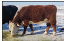
YV 86H, GRANDDAM OF 13M

This polled Kingston son is shaggy haired, loose hided, and big middled. His dam, 8K, is a first calf heifer and has turned into an exceptional young cow, it's a shame we do not have a picture of her. 13M can be used safely on heifers and cows.