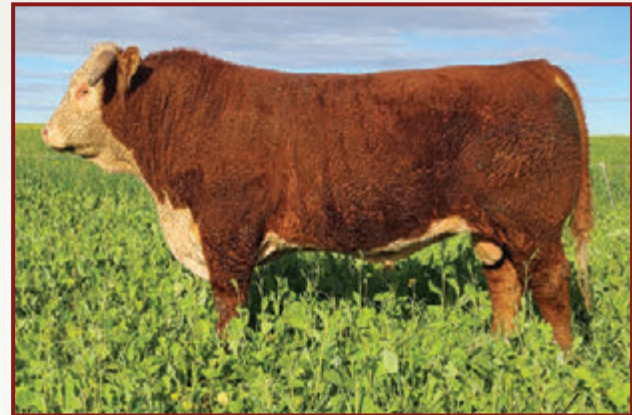
YV 39D SUN DESIGN LAD 104F

Forty Creek has proven himself both here at YV Ranch as well as Braun Ranch, with over 275 registered offspring. His sons will throw pigment and stoutness in their calves, with a great hooded eye and daughters that will stay in the herd. He has become a trait leader in Sustained Cow fertility, RFI as well as Carcass Weight. Forty Creek is co-owned with Braun Ranch.