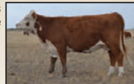
YV 11H, DAM OF 159M

This big-boned, moderate-framed bull is as honest as they come. His dam, 11H, is a petite cow that always outproduces herself.