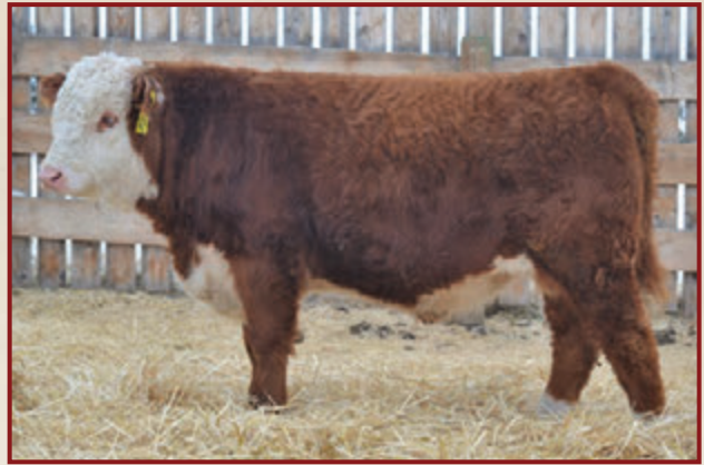
YV 234F FORTY CREEK ET 19J

79K was purchased as a calf at Braun Ranch in 2023, and stood out with his top notch dam, rugged soundness and exceptional calving ease. He has worked great on heifers and can lower birth weights on everything, with top percentile CE, BW and MPI EPD's.