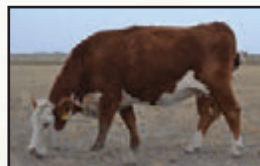
YV 76F, GRANDDAM OF 142M

Backed by Colemans favorite cow, YV 85J, this moderate bull has the frame and efficiency to make a tremendous set of low-input replacement heifers.