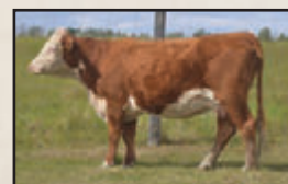
YV 38F, GRANDDAM OF 92M

92M carries deep into his twist with head carry that will catch your eye. He is of royal pedigree with five donor cows in his short pedigree. Double bred 77C gives him five stars and a top percentile ranking for feed efficiency.