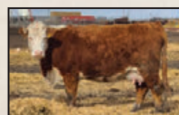
YV 13H, DAM OF 48M

48M has been an outstanding bull since birth, he exhibits an extreme muscle pattern in a moderate package alongside a large scrotal and hooded eye, with an excellent-uddered dam that does not miss. 48M has froze semen and will be utilized in our AI program in 2026.