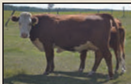
YV 2F, DAM OF 166M

These Forty Creek Bulls just keep hitting the mark. 166M's three-quarter-sibling was the high seller and Grand Champion at the 2024 Calgary Bull Sale, selling to Ridder Hereford Ranch in Nebraska.