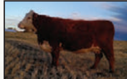
YV 7X, GRANDDAM OF 70M

70M is a seriously stout direct Forty Creek son. He is the eye appealing, moderate kind that we work hard to produce. His deep chest floor and curly red hair make him a complete package.