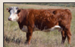
YV 10E, DAM OF 125M

YV 125M is a red-eyed 104F son, that has the same stretch as his father. His dam, Nova Girl 10E, has been a power cow in our program. She has another maternal son working as a top herd sire at Ayrey Herefords.