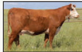
DAWM 114H, DAM OF 38M

This extremely eye appealing and complete polled calf has performance and athleticism in a curly-haired and loose-hided package. His dam was our top pick from the famous Phantom Creek Dispersal, and has not dissapointed.