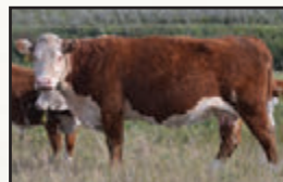
YV 35C, GRANDDAM OF 43M

Another polled Kingston son out of a first calf heifer that has added performance and combines goggled eyes with curly hair. 47M is a carcass specialist, indexing 113 and 136 for ribeye and intramuscular fat, respectively.