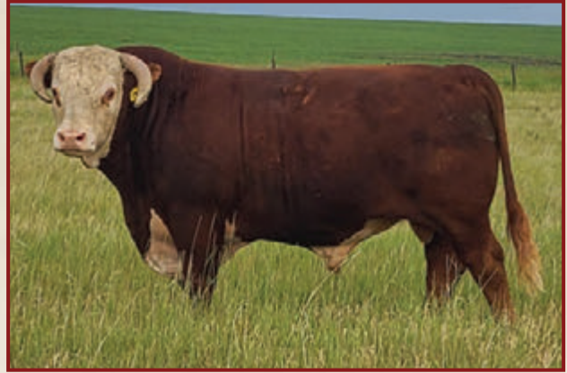
YV 42H MR SILVER CREEK 33K

YV 68K was an impressive bull and top indexing bull all the way through, indexing 116 at weaning and 110 as a yearling bull. He goes back to some of our favourite cows, and is in the top 5% for RFI. He was an obvious choice to use to replace his sire, YV 22C.