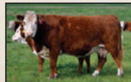
YV 729T, GRANDDAM OF 73M

73M is hard to miss, he is extremely complete. He is a right-sized bull with the Forty Creek hip and the big body of his maternal grandsire YV 112F - you will take a second look at this bull that is getting better by the day.