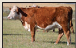
YV 46D, GRANDDAM OF 41M

This gentle teddy bear offers 100% pigment in both eyes, he is out of YV 138H which we were fortunate to use after selling to our friends at Red Rock Land and Cattle.