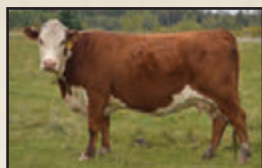
YV 6C, DAM OF 88M

YV 88M is a royal red bull with a wide top and deep chest. His dam 6C, is an 11-year-old power cow that keeps producing year after year.