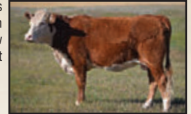
YV 8E, DAM OF 135M