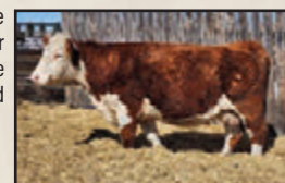
YV 112D, DAM OF 121M

YV 121M has a neat look and a neat pedigree. He is the natural calf out of the 10-year-old donor cow, 112D. With the YV 33K on his top side, he is a perfect combination of performance and maternal prowess.