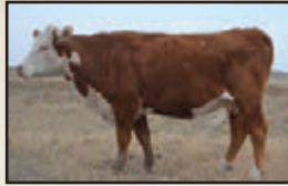
YV 14H, GRANDDAM OF 10M

We have been pleased with our first calf crop from BR 79K, 10M is no exception. A curly haired, smooth made, calving ease specialist, out of a first calf Creditor heifer with a maternally packed pedigree top and bottom.