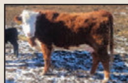
YV 76K, DAM OF 15M

15M is a moderate framed, attractive-made bull with plenty of muscle. This 79K son boasts a 77 lb birth weight, he moves out well and has the royal red colour Hereford enthusiasts love. 15M is out of a first calf heifer.