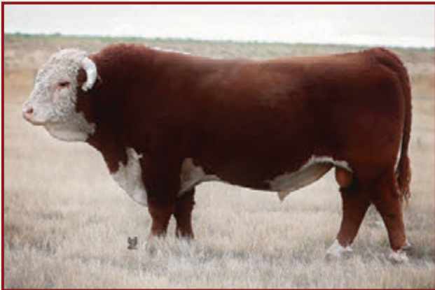
BR 213B FORTY CREEK 234F

19J is a Forty Creek son out of a 12 year old cow that has worked her way into our donor program. His mother makes excellent females and 19J has the classic Forty Creek qualities a cattleman of any breed can appreciate.