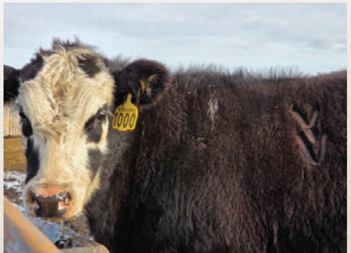
CUSTOMER'S FEEDER STEERS PURCHASED FALL 2025