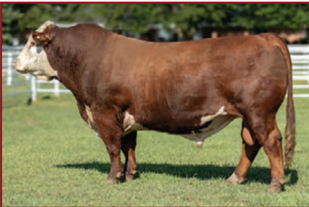
SHF INSIGHT F158 J354 ET

Kingston was our pick of the bull calves at Phantom Creek's famous dispersal, where he has a solid cow family as well as a strong set of numbers. Excelling in calving ease, BW, udder and teat values as well as an excellent set of carcass numbers. He bred well on cows and heifers and left sons with power and plenty of shape.