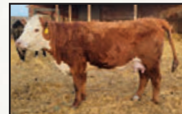
YV 3J, DAM OF 7M

7M is a polled calving ease specialist that does not give up any performance, with a 68 lb birth weight and an actual weaning weight of 856 lbs. We used his sire, Big Country, in our AI program and were very happy with both his sons and daughters.