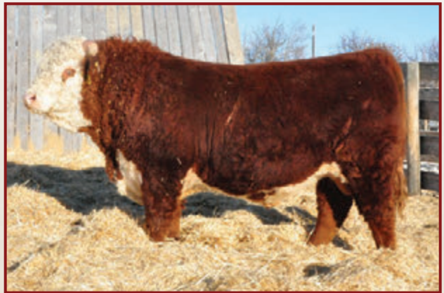
YV 234F SILVER CREEK 48J

YV 37H was added to our AI program as a son of 77C with added performance, out of one of our most proven cows. 37H sons will excel in performance and add pounds to calves in the fall.