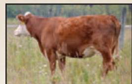
YV 94D, DAM OF 17M

17M is a curly haired, easy moving embryo son, and is a flush brother to 21M. He is from an outstanding mating of our great donor cow, 94D, which we are utilizing a son of, YV 33K. 17M is packed full of growth and is guaranteed to produce excellent females.