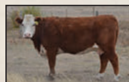
YV 26H, DAM OF 157M

YV 157M is dark red and limber like a cat. He is double bred Forty Creek - his hooded eye and big pigment stand out in the bull run.