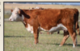
YV 46D, GRANDDAM OF 93M

Full of meat, 93M is an outlier in his shape with a huge hip and massive mid section. This carries through to his performance numbers, with an adjusted weaning weight of 829 lbs, indexing 125 for both weaning and yearling weight.