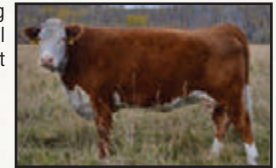
YV 11B, GRANDDAM OF 138M

Soggy, soggy, soggy. 138M is an easy-fleshing polled Kingston son with massive scrotal development. He is soft made with a deep chest floor and a kind demeanor.