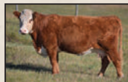
YV 10B, DAM OF 152M

YV 152M is a looker. He has a nice made head that adds to his eye appeal, but he is more than just looks, his cow, 10B, has produced excellent females in the heart of our herd, producing until she was 12 years old.