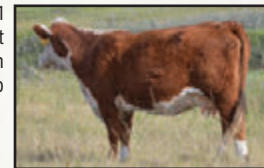
YV 13A, DAM OF 95M

95M is a well made bull. His dam, 13A, has raised 11 natural calves and continues to produce - its neat to see that all of her registered calves have been born within 10 days every year, a true testament to her fertility and longevity.