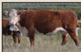
YV 35C, GRANDDAM OF 43M

This polled Kingston son is easy to look at with his short markings, mossy hair, added depth and elite efficiency ranking. He is soft made through his midsection and is sure to make powerful steers and easy doing cows. It's hard to believe he's a heifer's first calf.