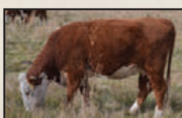
YV 46E, DAM OF 36M

YV 36M is an eye appealing curly-haired, deep-flanked, loose-hided, 144J son. He is one of the most feed efficient bulls in the offering. We have been very pleased with 144J's calves, currently walking at OC Ranch.