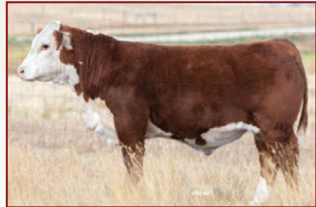
PCL 22G KINGSTON 33K

YV 138H was purchased by our friends at Red Rock Land & Cattle Co., after admiring the bull's natural muscle and beautiful-uddered dam. The following year they were kind enough to partner with us and allowed us to use him in our heifer pen, where he has the ideal mix of calving ease without giving up any performance or power.