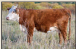
YV 22F, GRANDDAM OF 102M

102M is a proud, smooth-made bull with a lot of good in his pedigree. His sire, YV 38K, was used as a yearling bull showing a lot of promise at a young age. 102's maternal brother was purchased in our 2025 sale by Bob Earl who has a good eye for quality cattle.