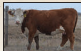
YV 24J, DAM OF 75M

This YV 68K son is very shaggy like his grandsire, 22C. We love him for his deep flank and fore rib, his bone structure and traditional Hereford markings. His dam, 24J, is an up-and-coming embryo daughter out of our flush cow, 27D, and is possibly the biggest-middled cow in the herd.