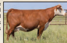
DAWM 49G, DAM OF 270M

YV 270M is a massive middled moderate powerhouse. He was our top pick in ours and LFH's embryo calf draft pick through our polled herd expansion program. His dam 49G was a pick from the Phantom Creek Dispersal. This bull does not disappoint.