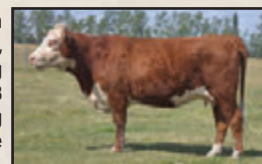
YV 42G, GRANDDAM OF 68M

68K exemplifies what we are working towards in our polled program. He is soft made, loose-hidden, with a very hooded eye and an overwhelming presence. With a 76 lb birth weight and a 113 and 108 index for weaning weight and yearling weight, respectively, he leaves very little to be desired.