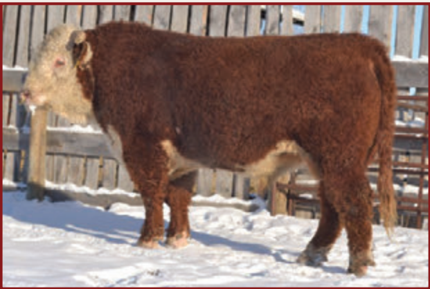
YV 77C MR CREDIT STRUCK 37H

YV 104F sons will throw all the traits we have admired in his grandsire, Starstruck. They will throw super long calves that will have tremendous feet and legs and have a thick mossy hair coat. With a large group of daughters in production, he has proven his maternal side as well.