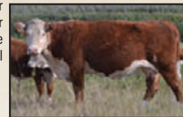
YV 35C, GRANDDAM OF 117M

YV 117M boasts a huge spread, indexing 112 for birth weight and 108 and 107, respectively, for weaning and yearling weight indexes. He is a more moderate birth weight bull out of the powerful 104F sire.