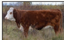
YV 43E, DAM OF 155M

YV 155M is a 104F son that combines all of our major sire groups including, StarStruck, Zam and Designer. He scanned a 1.14 for ribeye/100wt and has excess IMF to go around.