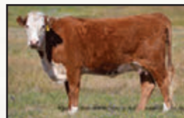
YV 27D, DAM OF 89M

YV 27D is the queen of making herd bulls. 89M is a soft made, well-rounded bull. He has full brothers being used at Carmichael Herefords in South Dakota, Riddder Herefords in Nebraska, along with maternal brothers at Wyatt Farms and Braun Ranch.