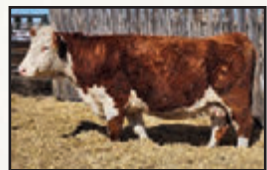
YV 112D, DAM OF 20M

This YV 48J embryo son, out of our old faithful 112D donor, is a mossy-haired, big-footed and well-rounded bull. His sire is working hard in the astute MJT program, where we were able to utilize him by AI.