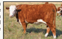
YV 920W, GRANDDAM OF 164M

this long-spined Forty Creek son excels in efficiency and is no slouch to look at. He combines the body mass of his father with the ease of condition from his maternal granddam, 920W, that produced until she was 15.