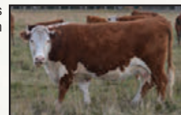
YV 18C, GRANDDAM OF 85M

Stamped with the classic Forty Creek look, 85M is a red-eyed, long-spined bull. As you can see from his picture, he has a strong herd bull presence.