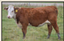
YV 74F, DAM OF 153M

Easy moving, 153M is a softer made version of his sire, 68K. His dam, 74F, is an easy-keeper and consistent producer.