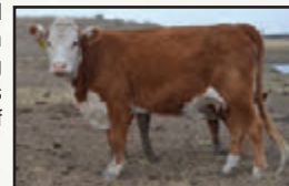
YV 35H, DAM OF 150M

YV 150M is a well-rounded deep-flanked bull with a great carcass data set. His dam, 35H, is a moderate cow with a lifetime record of weaning 60% of her body weight. His maternal brother is being used at BJ Cattle Co, where the first set of calves sold like hot cakes.