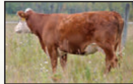
YV 94D, GRANDDAM OF 124M

124M is a well-marked YV 33K son. He is a big bull with a long side and deep flank - you can see in his picture, he makes his weight in all the right places.