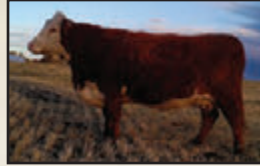
YV 7X, GRANDDAM OF 122M

A full pigment Forty Creek son and the maternal brother to the 2024 Medicine Hat Bull Sale Champion that is working well at Dallas Farms.