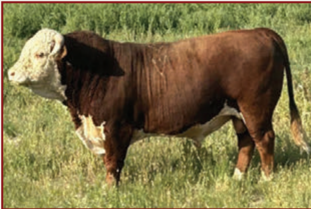
YV 101D MR DUKE STRUCK 138H

We chose to use YV 33K because of his moderate stance and solid red markings, as well as his stacked maternal lineage with some of our best donor cows on both sides of his pedigree. He has passed his volume and athleticism to his calves and we expect the daughters to excel.