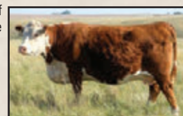
YV 153C, GRANDDAM OF 99M

99M is square-made back to front. With one of the best RFI's in the pen, he will leave feed in the stack and daughters out grazing all winter.