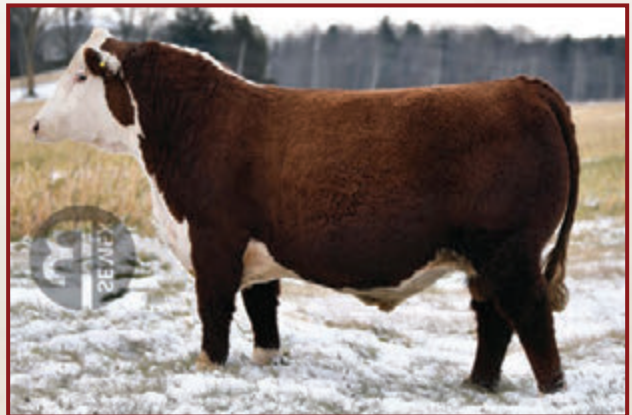
TH BIG COUNTRY 537G ET

Insight was used on the polled side of our embryo program, partnering with Little Fort Herefords as a proven way to add performance, pigment and carcass merit.