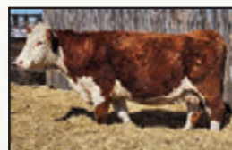
YV 112D, DAM OF 34M

Another embryo son of the YV 112D dam, he has an exceptional presence and a massive fore rib carrying into a wide base. 34M has maternal brothers being used at Bennett Ranch, Ironwood Ranch and Bertram Ranch.