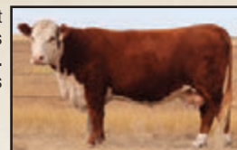
BR 224F, GRANDDAM OF 58M

58M is an attractive BR 79K son that stands out for his long spine and smoothness through his shoulder that patterns his grandsire ALNK 77C. 58M has 5 stars for calving ease and is a heifer's first calf.