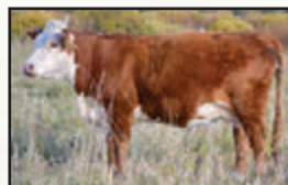
YV 22F, DAM OF 106M

This Forty Creek son has explosive shape and a excellent eye set. His dam, 22F, does an excellent job stamping her calves - she has sons working in Alberta, Saskatchewan, and half of the western States.