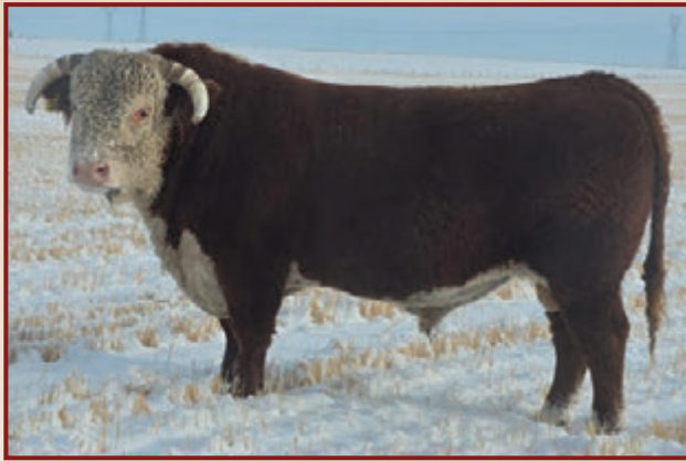
BR 64H EXPRESS 79K