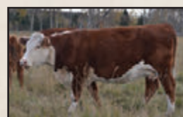
YV 25C, GRANDDAM OF 143M

YV 143M is a rugged made Forty Creek son with added growth and hair. His dam, 81G, is a consistent producer with numerous females retained in the herd.