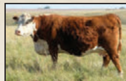
BR 153C, GRANDDAM OF 148M

YV 148M is as long as a freight train, with great markings all around. This guy doesn't have many holes in him. He combines 5 stars for efficiency with 5 stars for carcass. His calves will be in demand by the feedyards.