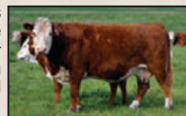
YV 729T, GRANDDAM OF 165M

This round-musled end-of-May bull stands out for his overall quality and dimension. The bottom side of his pedigree is filled with our favourite cows, with his granddam proving herself over 13 progeny and his dam headed into our embryo program this spring.