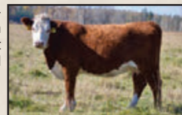
YV 46F, DAM OF 86M

Polled and proud, this Kingston son is well-marked with an athletic build. His dam is an embryo daughter directly out of 920W, a cow that has 34 registered offspring, with both polled and horned herdsires being used.