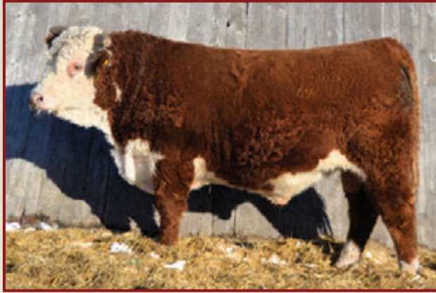
YV 22C MR ZAMS CREDIT 68K