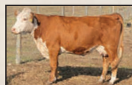
YV 21H, DAM OF 113M

This bull is a unit and always has been, from his shaggy hair to his long side, he is extremely well made. His maternal brother sold to our friends at Lazy RH Ranch as the high-selling polled bull in our inaugural on-farm sale.