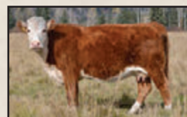
YV 102C, GRANDDAM OF 9M

This easy fleshing Kingston son boasts a mix of calving ease and performance. He is a proven sleep-easy heifer bull with a big body, light hair and easy fleshing ability, with the added bonus of having the top IMF scan of the sale bulls.