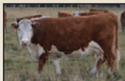
YV 18C, GRANDDAM OF 23M

YV 23M is a mid-sized, long-spined, smooth made YV 33K son with a maternally packed pedigree. His dam, 100F, raised the high selling bull in our 2025 bull sale, sold to Ridder Hereford Ranch of Nebraska.