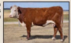
YV 59F, GRANDDAM OF 140M

YV 140M is an end-of-April Kingston son with real performance. He is a fancy made bull - his offspring will tip the scales whether you sell them at weaning or on the kill floor.