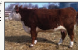
AGA 282P, GRANDDAM OF 119M

This bull is an absolute tank. 119M is packed full of meat from top to bottom, with a moderate stance he is sure to leave his calves with the big hip desired.