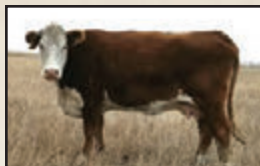
YV 55Y, GRANDDAM OF 141M

141M fits the mold well, he is high performing with full pigment and an extra rib. His dam, YV 21E, is likely going to be the replacement in our donor program for his grandam, 55Y, which we have registered 25 offspring out of.