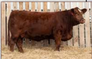
KKH UNDERATED 542K - DAM OF LOT 50