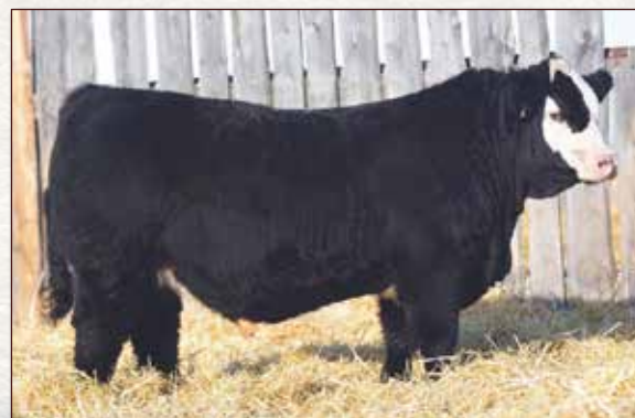
WJS TRAILBLAZER 108H - SIRE OF LOT 54

LFE MCDAVID 413C SPRINGCREEK LIMA 69Y SPRINGCREEK LOTTO 52Y IPU MS HERO 113P