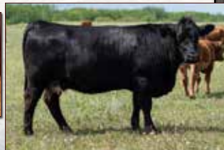
CIRCLE G BLK CORDELIA 284K (UDDER) DAM OF LOT 9