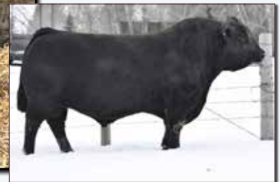
HART STATE OF WAR 056C SIRE OF LOT 20

WELSH'S WARSAW 312Z HART STATE OF WAR 056C HART MISS 102A