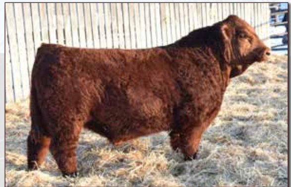
CIRCLE G KENTUCKY 52K - SIRE OF LOT 50, 51, 52 AND 53

SVS BROOKS 669D SVS RED ANNIE 411B IPU RED DEPUTY 25C MAF SPRINKLES 14A