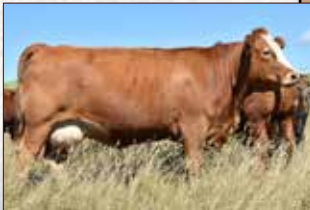
TRI K SYNA 33F DAM OF LOT 12