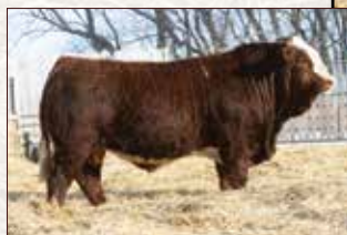
KOوبا 1L SIRE OF LOT 41