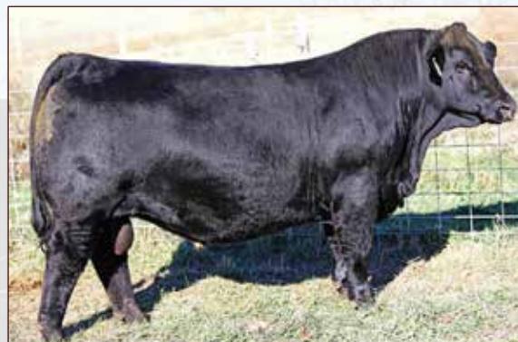
RF CAPACITY 742E - SIRE OF LOTS 55 AND 56

LFE BS LEWIS 420B LFE BS OPAL 630X WS BEEF MAKER R13 IPU 16M MS. NOREMAC 81X