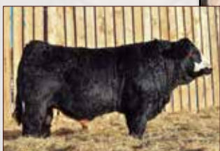
KKH JEOPARDY 287J MATERNAL GRANDSIRE OF LOT 23