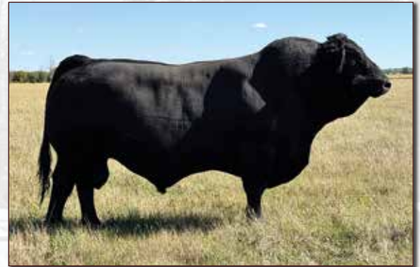
LRX EXECUTIVE 212H - SIRE OF LOTS 57

HARVIE JDF WALLBANGER111X SUNNYVALLEY BLK JENNA 88U R PLUS RELOAD 2006Z BAR 40 MS 313N