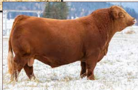
MADER WALK THE LINE 92J - $270,000 SIRE OF LOT 47, 48 AND 49

WS ALL ABOARD B80 WS MAJESTIC Z133 MRL CAPONE 130B CROSSROAD RAMONA 375R