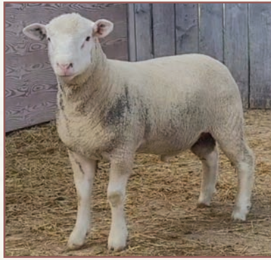
LOT 12 92N