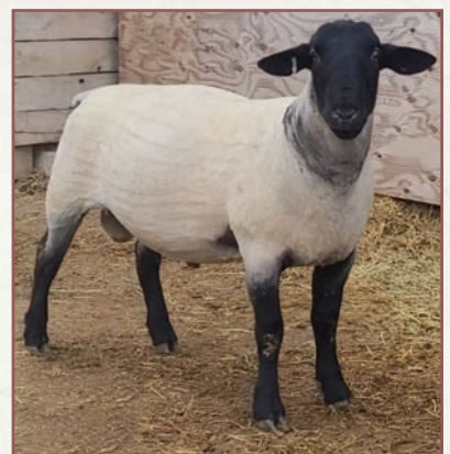
LOT 39 NEWTON 40N