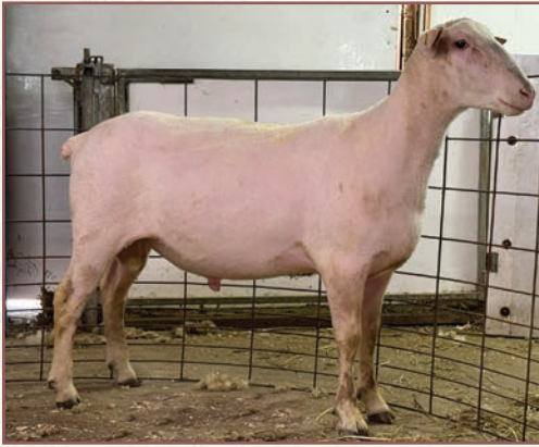
LOT 28 NYLAN 36598N