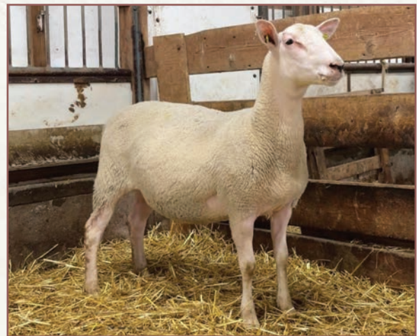
LOT 56 84551N