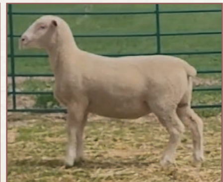
LOT 51 NINA 55N