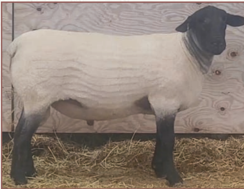
LOT 40 AUSSIE MATE 57N