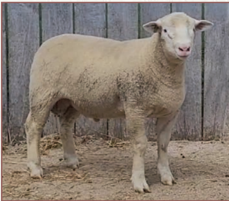
LOT 7 POWER PLAY 56N