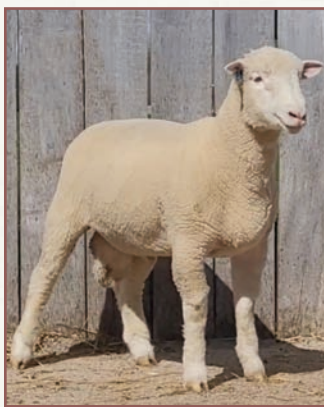
LOT 24 NINJA 67N