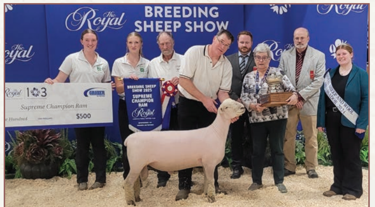
LOT 32 NECESSITY 32N