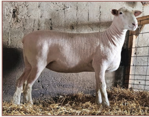
LOT 47 G&L 26N