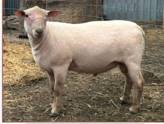
LOT 17 PELEUS 34N