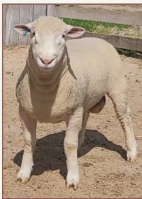
LOT 23 NIGHT CAP 60N