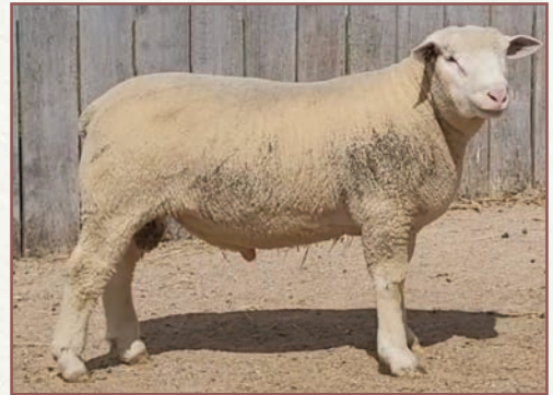
LOT 5 VEZINA 60N