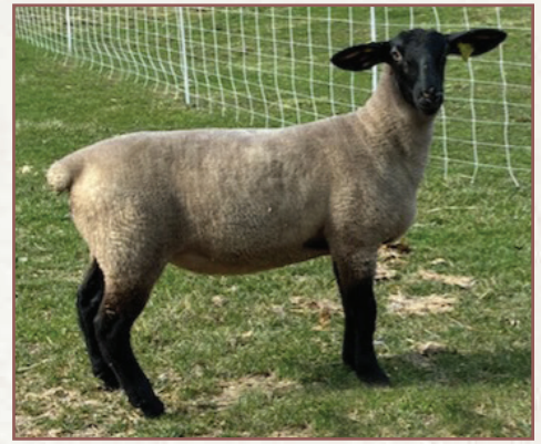
LOT 59 54178P