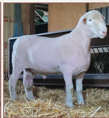
LOT 25 BRIEN 4N