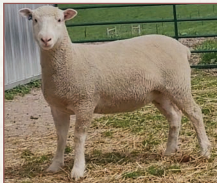
LOT 50 NOLA 40N