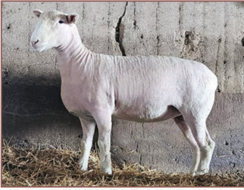
LOT 46 G&L 22N