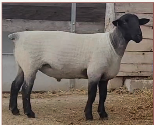
LOT 35 ALLSTAR 7N