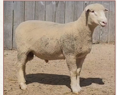
LOT 20 NASHVILLE 45N