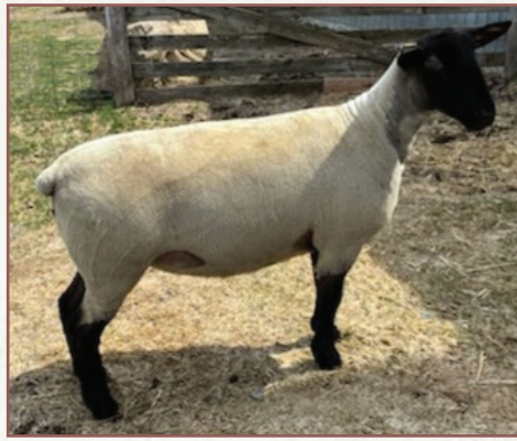
LOT 58 16099N