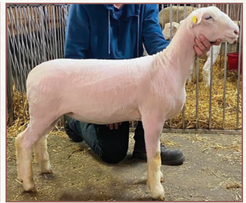
LOT 55 WOODSTOCK 225P