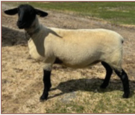
LOT 57 16062N