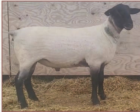
LOT 41 TK 62N