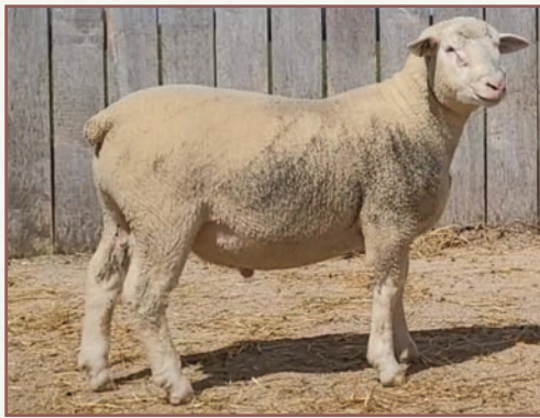
LOT 11 79N