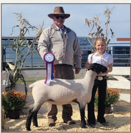
TWIN SISTER TO LOT 38 purchased by Gilchrist Farms