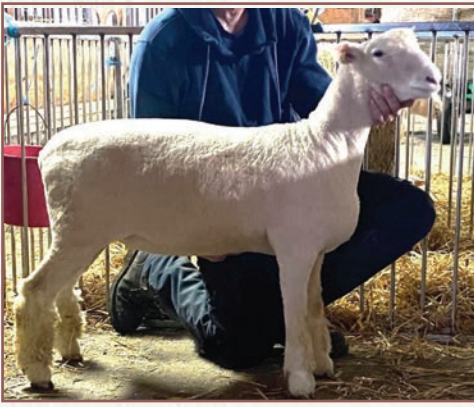
LOT 53 WOODSTOCK 214N