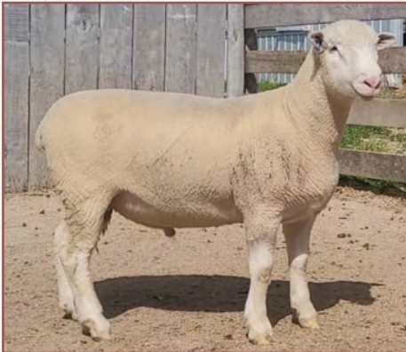
LOT 18 NEW AGE 42N