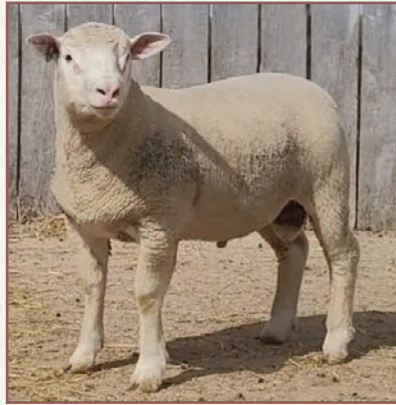
LOT 8 LAWMAN 61N