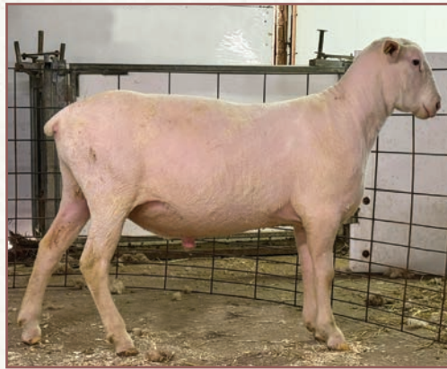
LOT 29 NEMO 42286N