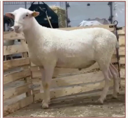
LOT 30 56918M