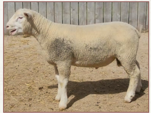
LOT 13 93N