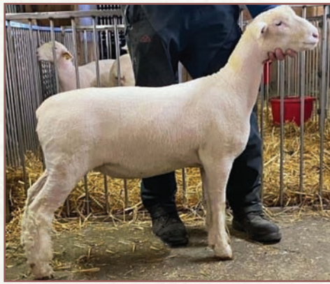
LOT 54 WOODSTOCK 224N