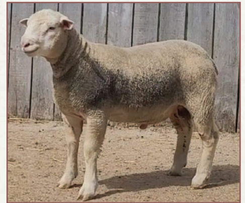
LOT 9 TYCOON 63N