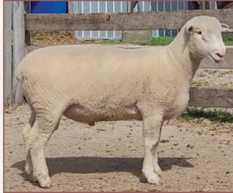
LOT 19 NACHO 30N