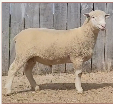
LOT 21 NORWAY 46N