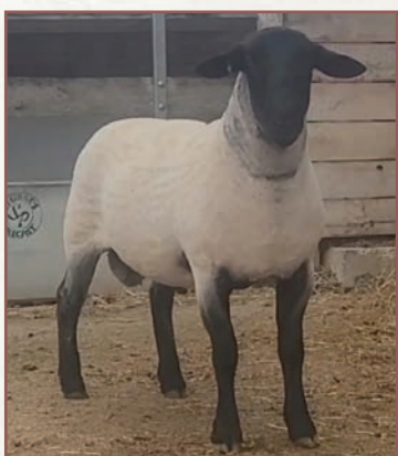
LOT 38 NO LIMITS 32N