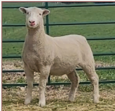
LOT 49 NOVA 38N