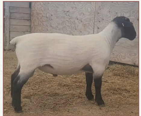
LOT 44 TK 98N