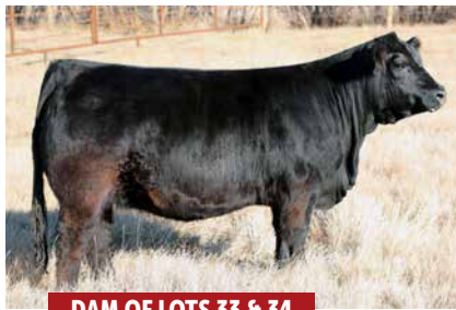
DAM OF LOTS 33 & 34