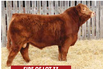
SIRE OF LOT 33