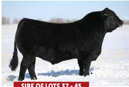
SIRE OF LOTS 37 - 45