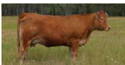
DAM OF LOT 45

If you are looking for a quiet bull, look no further he will be your friend. The boys are going to miss riding him!