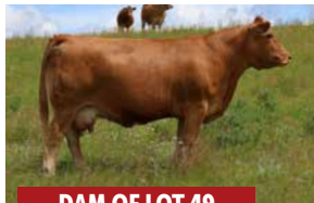
DAM OF LOT 49

Mufasa is the deepest bull in the pen, with a strong cow family backing him. This cow family has multiple females working in our herd.