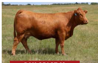
DAM OF LOT 40