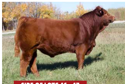
SIRE OF LOTS 46 - 47

This bull was supposed to be a purebred embryo but after DNA testing he turned out to be a Limo X Angus bull, but he was so good we decided he was worth keeping and putting in the sale.