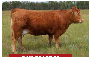
DAM OF LOT 39