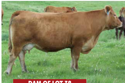
DAM OF LOT 38

Moonshine is the longest bull in the pen. He has muscle expression, sound structure, and a herd bull presence. Keep all the daughter you can!