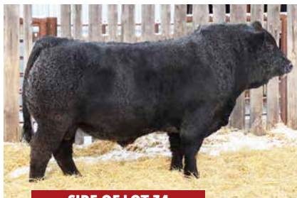
SIRE OF LOT 34

Maverick is the maternal brother to NEM Maximus in this year's sale, when we flushed PYN 707H we flushed her to Fantom as well. He is going to add muscle shape, length of body and hair to his calves.