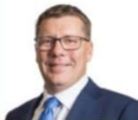
Premier Scott Moe

www.agribition.com/get-involved/next-gen-program