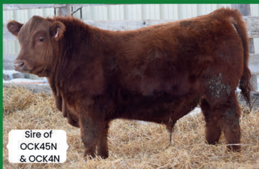
Sire of OCK45N & OCK4N