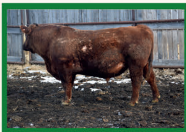
Sire of 102M