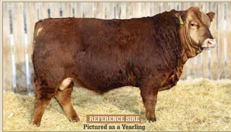
REFERENCE SIRE Pictured as a Yearling

With his enthralling mass, this eye appealing bull has proven his capabilities of producing progeny that we have seen reflected in the bull pen and as a good investment in our replacement heifer pen too! Good Deal was mated with some of our top performing females, the results speak for themselves! We look forward to 7 bred Good Deal females to lend to our calving pens this spring! A Good Deal son sold for $16,000 at our 2025 bull sale for Wiebes commercial herd!