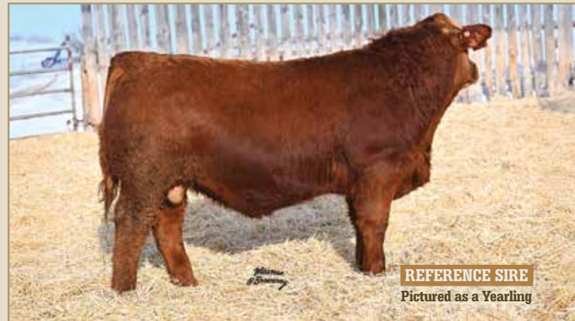
REFERENCE SIRE Pictured as a Yearling

We purchased Hector to add capacity to our red breeding program. Robust and elevated in his look, Hector moves ideally thanks to his incredible feet and correct structure. Hector's daughters are exceptional—feminine, nicely extended through the front end, and full of body. Hector bulls are big-topped, big-butted, and layered with the same consistent muscle pattern; these bulls are of future. In addition to his practical qualities, Hector's influence is already being recognized in the show ring. He sired DRT Lonesome Artemis 310M, the Grand Champion Bred Heifer at her first showing at the 2025 Canadian National Junior Gelbvieh Show in Swift Current, SK.