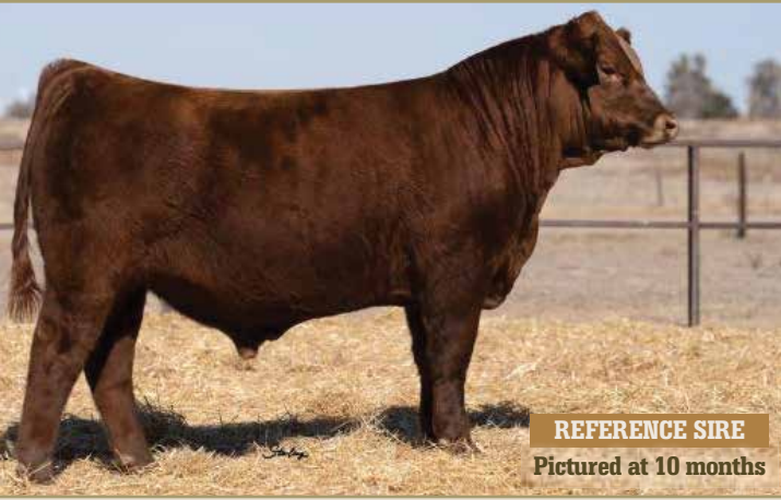
REFERENCE SIRE Pictured at 10 months