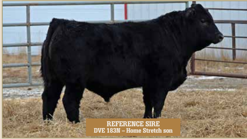
REFERENCE SIRE DVE 183N - Home Stretch son