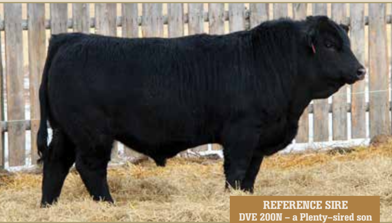
REFERENCE SIRE DVE 200N - a Plenty-sired son