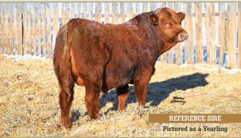
REFERENCE SIRE Pictured as a Yearling