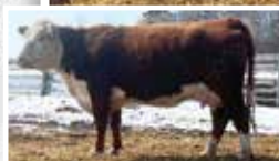
38H DAM OF LOT 16