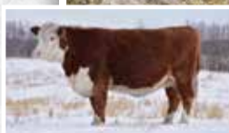
9G DAM OF LOT 18