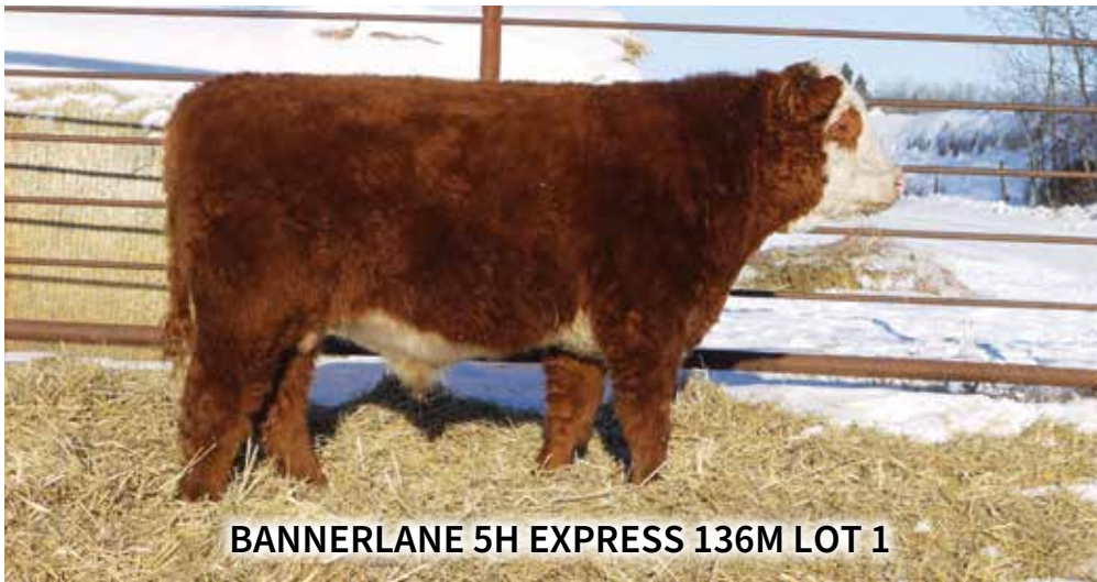
BANNERLANE 5H EXPRESS 136M LOT 1

Our only business here is our cattle and we fully support any and all involved. Bannerlane bulls are durable and can be found throughout the prairie provinces, British Columbia and the northern States.