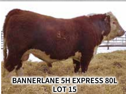
BANNERLANE 5H EXPRESS 80L LOT 15

2025 HIGH SELLING BULL to YV RANCH Airdrie, AB