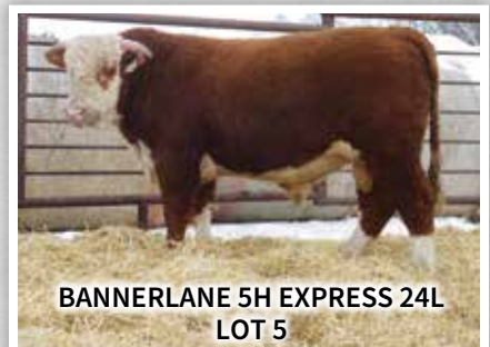
BANNERLANE 5H EXPRESS 24L LOT 5

2025 HIGH SELLING BULL to KOZLINSKI RANCH Provost, AB