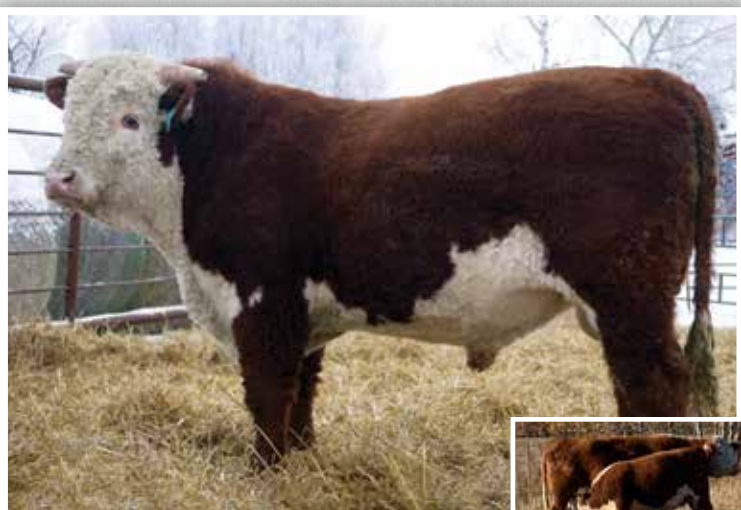
127H DAM OF LOT 8

EPDs: B +7.1 W +51.4 Y +89.8 M +17.8 TM +43.5