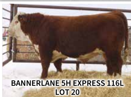
BANNERLANE 5H EXPRESS 116L LOT 20

2025 HIGH SELLING BULL to BOWIE RANCH Piapot, SK