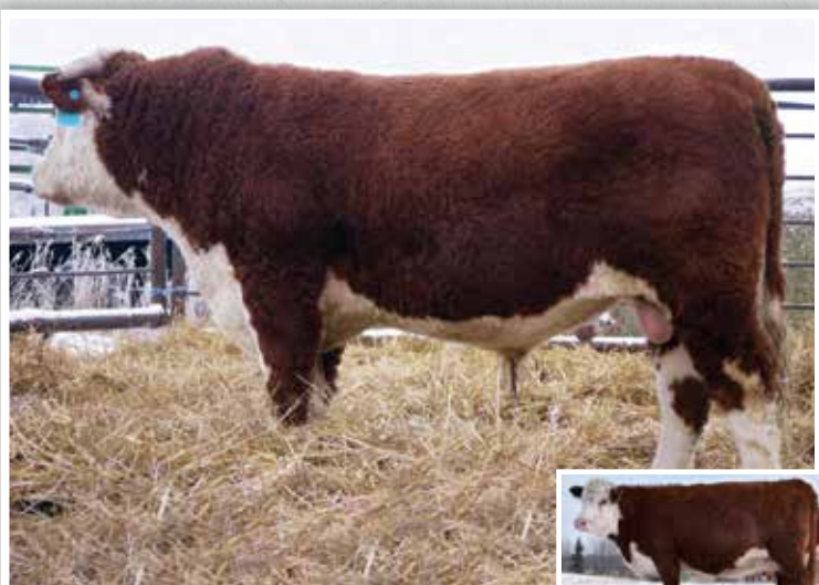
39E DAM OF LOT 7

EPDs: B +4.5 W +51.3 Y +87.7 M +24.0 TM +49.7