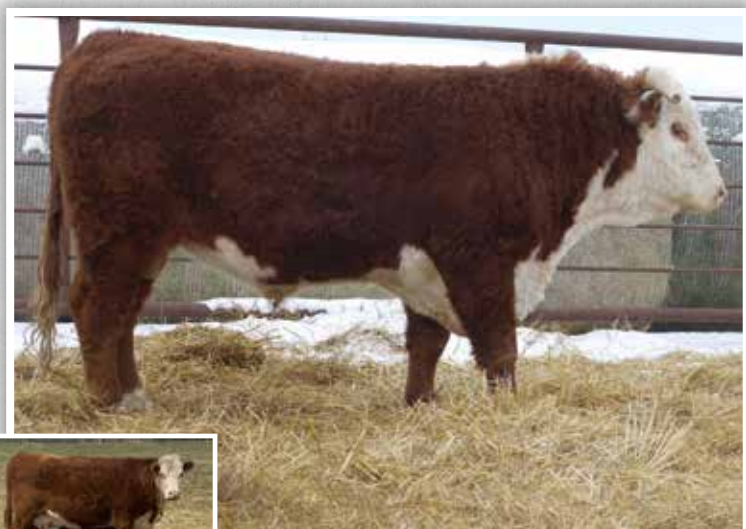
13D DAM OF LOT 5

EPDs: B +4.0 W +47.5 Y +71.6 M +18.6 TM +42.4