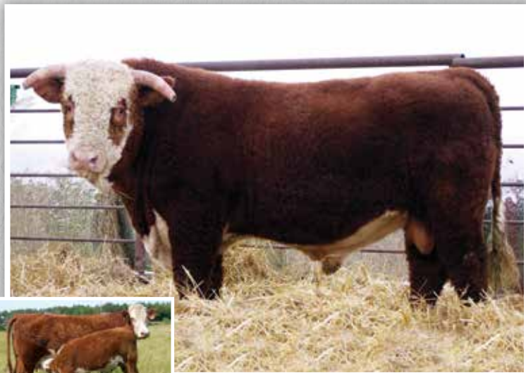
15C DAM OF LOT 4

EPDs: B +5.2 W +50.6 Y +85.7 M +23.5 TM +48.8