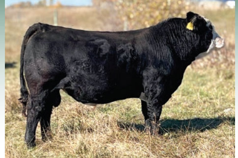
NAC WINCHESTER 177K