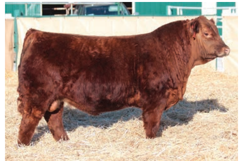
WHEATLAND FRONT RUNNER