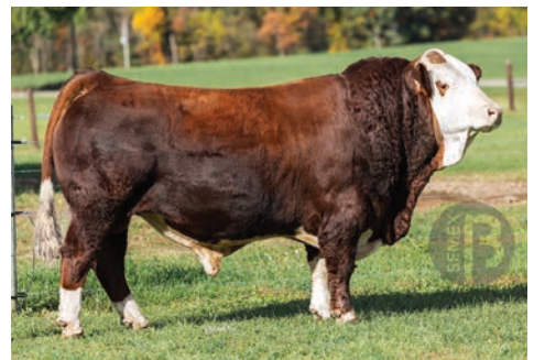
POL JAMIE 31J