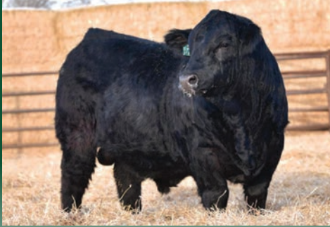
R PLUS MANDATE 1044J