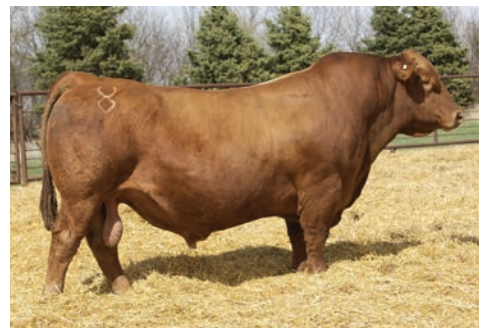
ROCHING H CAPTIVATE J75