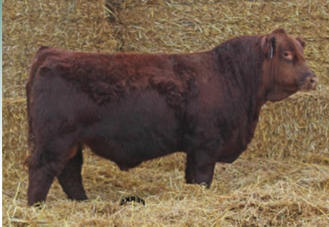
PLCC MANKOTA 506M