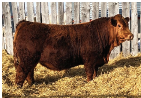
NAC GREG 27G