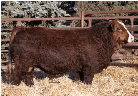
ZSL OTHANI 7J