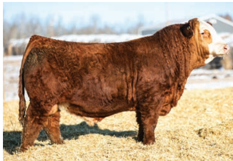
WBC EASE 6L