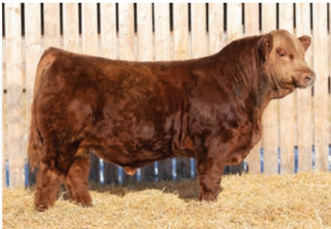
WFL WATER VALLEY 2064K