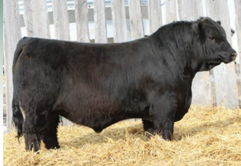
NAC DIABLO 5L