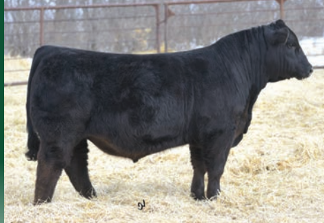
LCDR FAVOR 149F