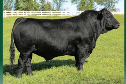
KWA SLIDER 196H