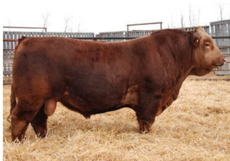
SPRING CREEK LADIES MAN 90E