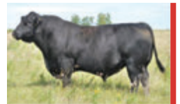
BAR-H MINDBENDER 141D SIRE

Another bull safe to use on heifers! His dam, SHR Zara Lisa 810F is a deep made, good uddered, moderate framed female whose mother (dam of lot 11) is one of our top producing cows. If you're looking for a calving ease bull to use on heifers here he is!