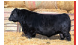
BAR-H ROYAL MINT 155J SIRE

This guy is a tank, and will surely catch your eye with his extra muscularity and stoutness of feature. He's a rugged bull, with a unique tandem of quality, power that should make him a truly profitable herd sire. We love his dam PARKWOOD CASSIE 30H. She's deep and maternal about her center body while still remaining feminine about her front end backed by a good udder.