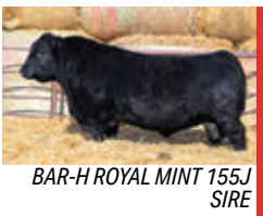
BAR-H ROYAL MINT 155J SIRE