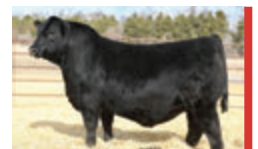
ELLINGSON BRICKHOUSE SIRE

A standout since birth. 24M is an absolute powerhouse. This Royal Mint son sets the standard in regard to balance, genuine body, muscle, and structural integrity. When his time comes we think he will do some great things for his new program.