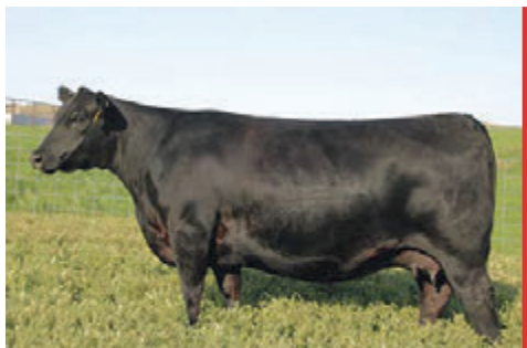
S A V BLACKCAP MAY 4610 DONOR DAM

This trio of full brothers has us excited. SHR Gold Coin 7M is an absolute powerhouse herd sire prospect. He definitely resembles his sire in terms of body dimension, fleshing ability, and muscle thickness. We feel like this guy will generate the kind of high quality sons that are easy to sell, but hard to let go of!