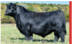
ELLINGSON BADLANDS 0285 SIRE