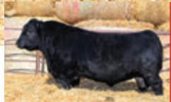
BAR-H ROYAL MINT 155J SIRE