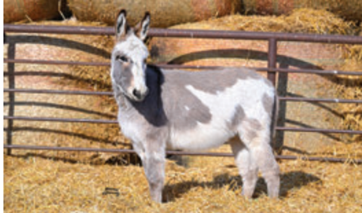
3-YEAR OLD JACK