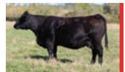
SUN RISE BLACK 16K DAM

A big-outlined, long-bodied Sim-angus bull. His dam, which was purchased from Sun Rise Simmentals, resembles the look of a donor cow. She's a broody deep centered female with tons of mass and substance.