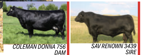
COLEMAN DONNA 756 DAM

This impressive bull blends the Coleman Donna and Blackcap May families. 6M is not only excellent on the eyes, he is a moderately framed bull who has been appreciated for his phenotype that shows with exceptional thickness, muscling, and capacity in a structurally sound package.. Sired by $175,000 SAV Renown, were excited to see the impact 6M can make.