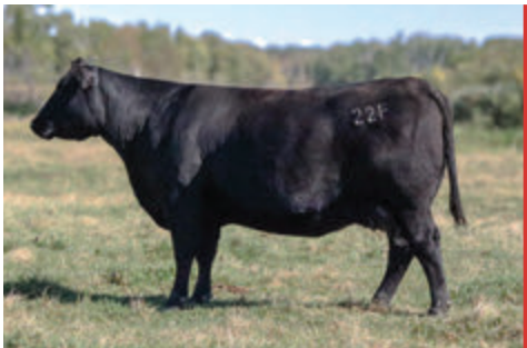
MVF PRIDE DOLLY 22F DAM

The only Peakdot Trust progeny in the sale! Here's a low birth weight bull who combines plenty of muscle, thickness, and structural integrity but still will add growth with his high YW number. His dam MVF PRIDE DOLLY 22F has everything we want in an Angus brood cow, eye appeal, fleshing ability, and udder quality. We feel like this guy will generate the kind of high quality females that are easy to sell, but hard to let go of!