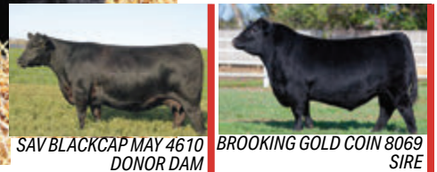
SAV BLACKCAP MAY 4610 DONOR DAM

Here's another Gold Coin son that is well balanced and doesn't forfeit muscle, power, stoutness or body shape. This moderate framed individual is a level-made calf that offers plenty of bone at the ground.