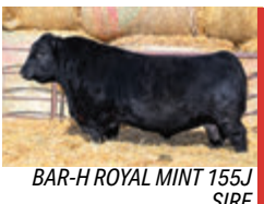
BAR-H ROYAL MINT 155J SIRE