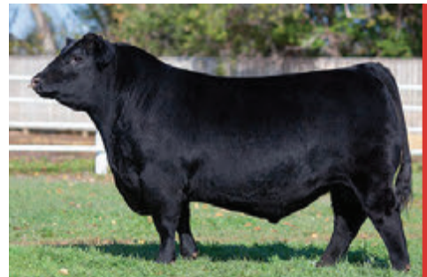
BROOKING GOLD COIN 8069 SIRE