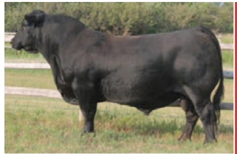
PEAK DOT TRUST 86G SIRE