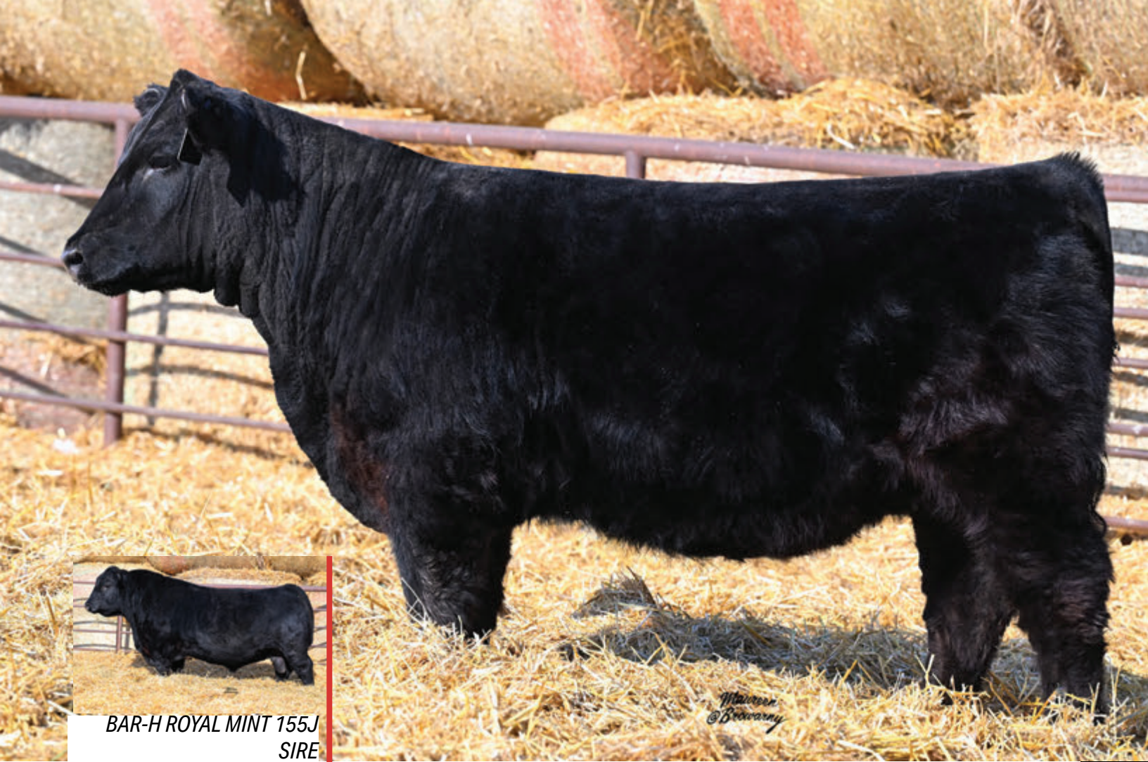
BAR-H ROYAL MINT 155J SIRE