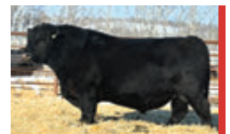
SHR INNOVATION 906G GRANDSIRE

If cow power is what you're after, look in! 2M certainly exhibits plenty of thickness and angularity in her body shape. Like her for what you see, but appreciate the tremendous potential as a cow!