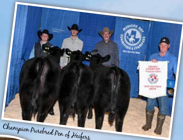
Champion Purebred Pen of Heifers