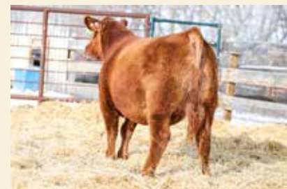
Lot 38 Red Shiloh Madcaps 41M SCCA 41M 2359293 January 16 2024

Sire: RED DKF RAZOR 55C RED DKF RACER 8E RED DKFE MISS ACE 84C