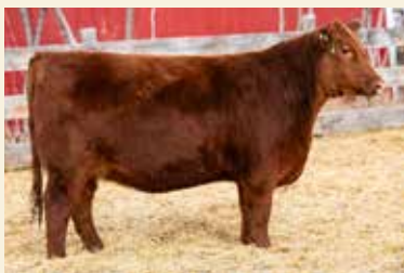
Maternal Sister - SCCA 47L 2024 high selling Red Angus Heifer.