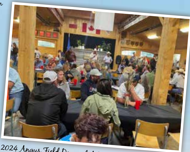
2024 Angus Field Day and AGM