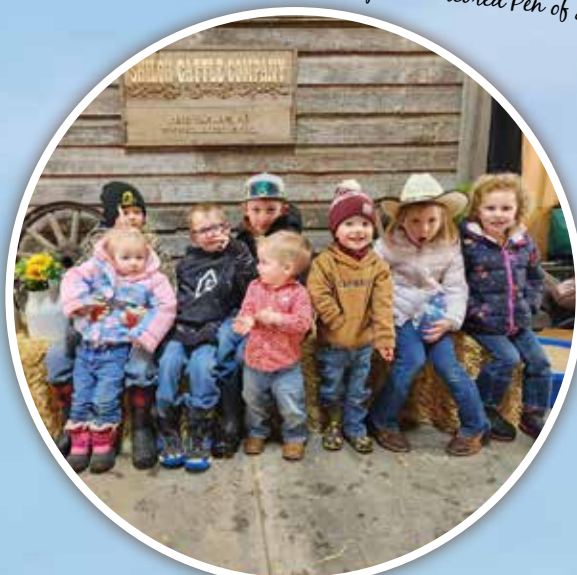
Our Future Local Cattlemen & Women