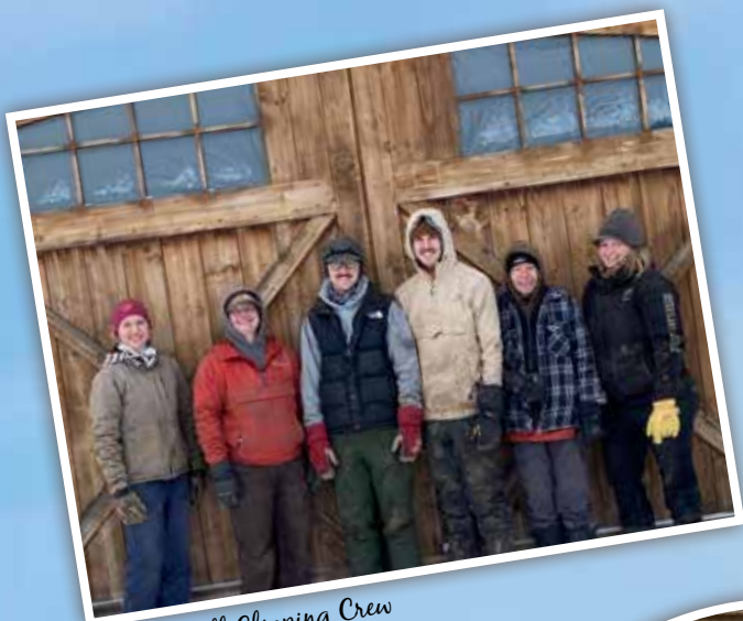
2025 Bull Clipping Crew