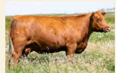
SCCA 31F - Dam

RED BECKTON HUSTLER T615 C2 RED ML KARUBA 814U RED VIKSE FULLY LOADED 29Y RED TOMAHAWK ROSETTE 17S