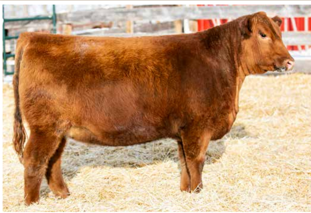
Lot 39 Red Shiloh Rosette 86M SCCA 86M 2359645 January 31 2024

Sire: RED DKF RAZOR 8E RED SHILOH HOLLYWOOD 129H RED LAURON MOROJITTI 127A