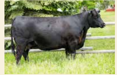
DMM Miss Essence 1G - Dam

Here's a solid Colossal son out of one of our donor females. A bull with a notably impressive phenotype, he is as long sided and sure footed as his sire, with the performance of his Dam. We believe this guy will make stunning females and outstanding bull calves. 3 of his Paternal sisters made up our Grand Champion pen of purebred heifers at the Medicine Hat Pen Show this past fall.