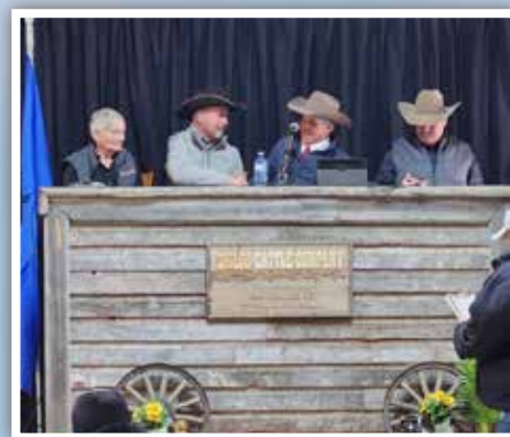
We Still Believe in a Handshake