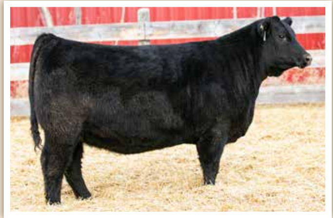
2024 High Selling Angus Heifer