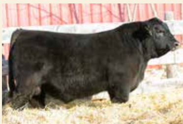
SCCA 92H - Maternal Sib

An eye catching, calving ease bull with a smooth shoulder. Lot 7's Dam is a solid female with a beautiful udder. This guy has been a pen favourite from the moment he hit the ground.