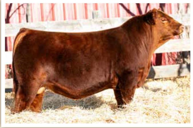
2024 High Selling Red Angus Bull

We would like to recognize and extend a special thanks to the following buyers for purchasing the high selling lots in our 2024 sale.