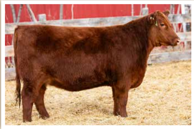
2024 High Selling Red Angus Heifer