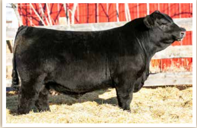
2024 High Selling Angus Bull

Purchased by: Purchased by: CD Land & Cattle