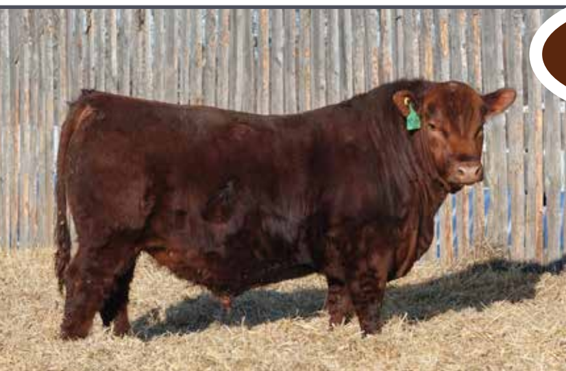
BW 205D FEB. 21, 2025 YW 75lbs 576lbs 1105lbs

This wide made soggy bull is a perfect option for adding depth and width into your calf crop. His dam always produces easy fleshing offspring.