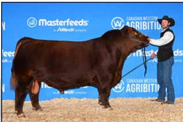
RED EYE HILL MAMA'S BOY 23J