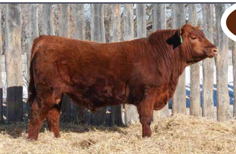
BW 205D March 1, 2025 YW 85lbs 492lbs 950lbs

Moneyball is a power bull out of a 13 year old cow that just keeps producing. He'll add pounds and size into your calves.