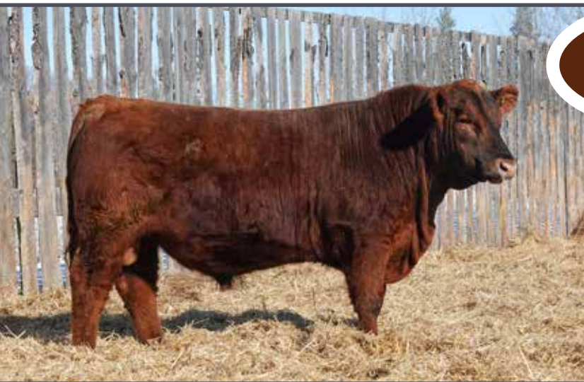
BW 205D FEB. 21, 2025 YW 97lbs 564lbs 1170lbs

Here is a maternal brother to Lock N Load. His dam is a no miss cow with consistent genetics. Use him on heifers or produce top selling steers and keep all his daughters.