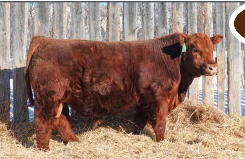
BW 205D FEB. 21, 2025 YW 76lbs 538lbs 1075lbs