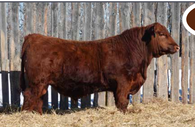
BW 205D FEB. 21, 2025 YW 83LBS 601lbs 1100lbs