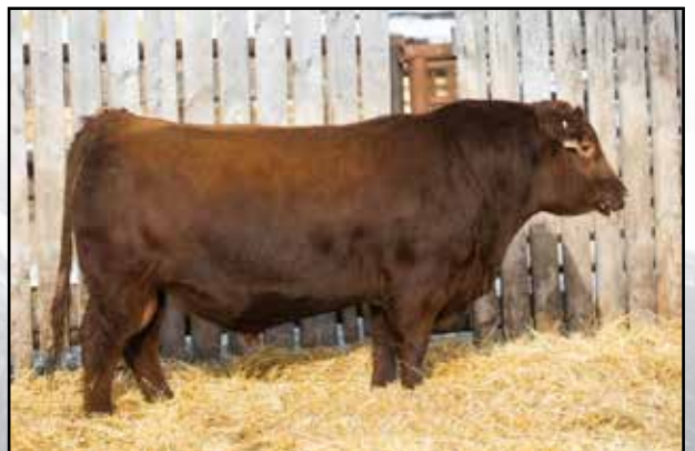
RED YCLC GUTS N GLORY 175G