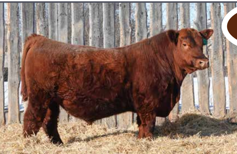
BW 205D FEB. 21, 2025 YW 88lbs 591lbs 1140lbs

Mountain is an eye catching bull with tons of middle and a great hip. This bull will work in any situation.