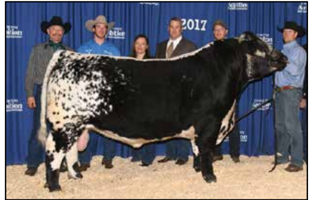
NOTTA 151A CAUSE N EFFECT 309C