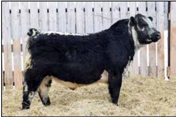
WOLF LAKE JACKPOT 10J