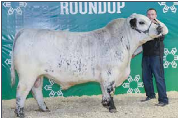
WOLF LAKE FIELD READY 52F