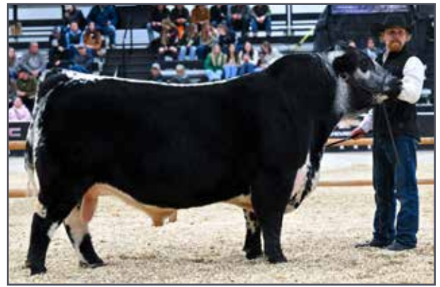
RAVENWORTH KRAKEN 505J