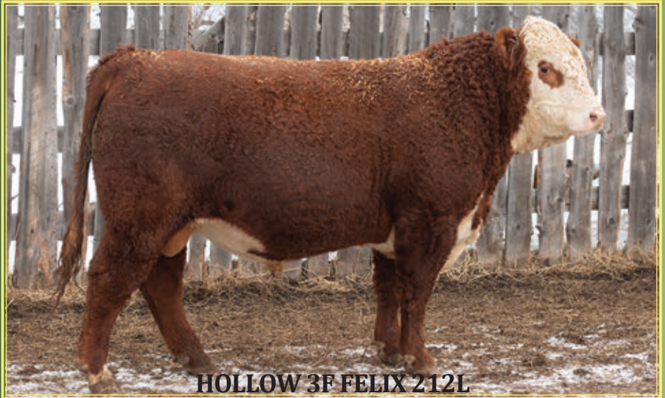
HOLLOW 3F FELIX 212L