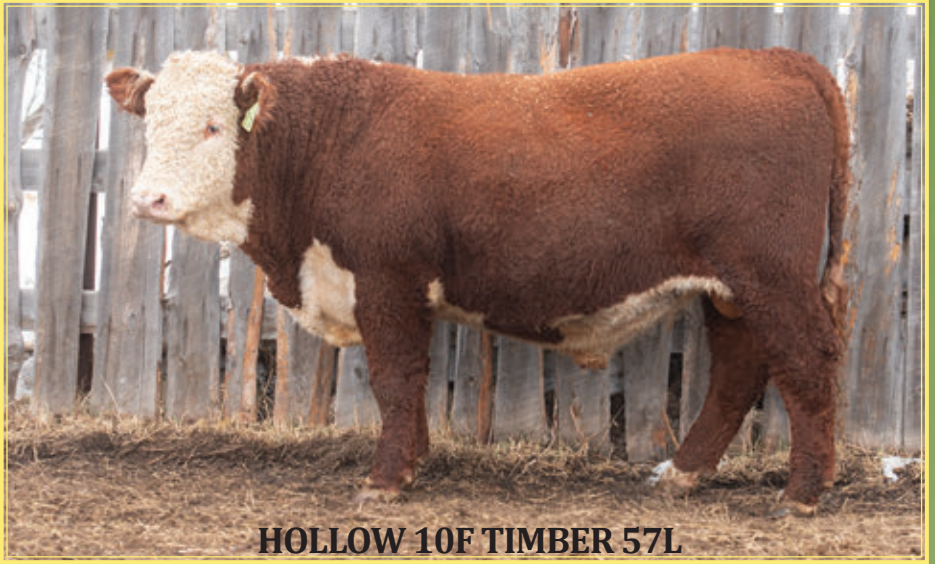
HOLLOW 10F TIMBER 57L