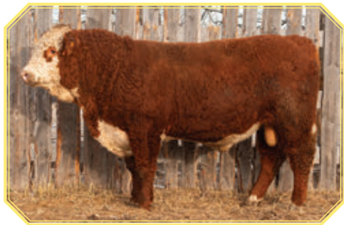
Hollow 143F B J 242K