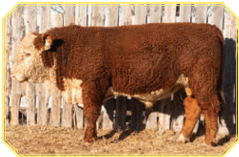
Hollow 3F Felix 198K