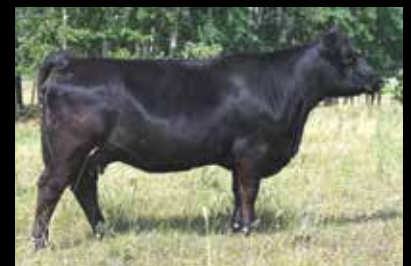
GG Gold Jewel 45J: Dam

CE BW WW YW MILK MCE MWWT 15.4 1.0 85.7 129.6 26.8 11.3 69.7