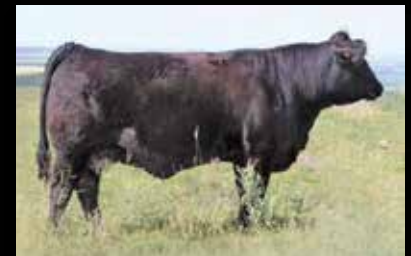
SKORS Black Sable 46E: Dam