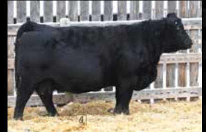
SKV Cimmaron 33C: Dam of 9 & 15