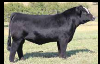
Mr CCF Vision: Sire