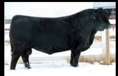
Mader Walk This Way 224B: Sire