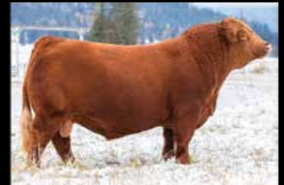
Mader Walk The Line 92J: Sire

CE BW WW YW MILK MCE MWWT 7.0 4.6 101.7 147.8 25.7 5.1 76.6