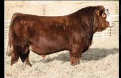
LFE Stratton 3094F: Sire