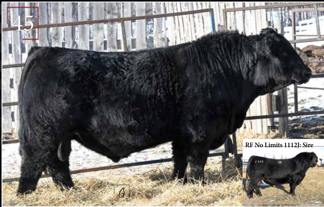
RF No Limits 1112J: Sire