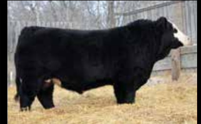
Sunrise Captain Blaze 5C: Sire of 9, 13, 15, 18, & 63

CE BW WW YW MILK MCE MWWT 9.9 2.2 89.4 136.1 23.1 7.9 67.8