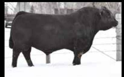
Hart State of War 056C: Sire

CE BW WW YW MILK MCE MWWT 11.8 1.7 81 121 25.1 6.4 65.6