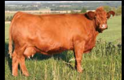
SKV Hot Wired 7D: Dam