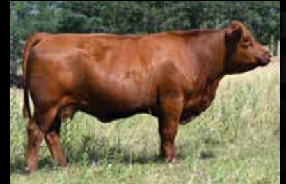
GG Jorja 30J: Dam