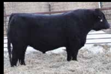
NCB Cobra 47Y: Paternal Grandsire

CE BW WW YW MILK MCE MWWT 9.6 3.6 85.4 125.7 20.4 6.5 63.1