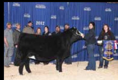
Elle 638D: Full Sister to Sire

CE BW WW YW MILK MCE MWWT 8.2 3.8 75.2 108.8 18.7 3.8 56.3