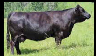
Skors Black Mickey 246Z: Dam

Inset: GG Blazin' Mickey 22M: Full Sister