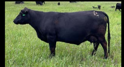
Dam - 3533-6577