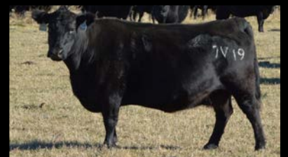
Dam - 7V19

A brief description of 5B02 would be...a sire of beautiful females. He is an absolute cow maker! No surprise, considering his nicely populated lineage of intense Emulation genetics. The first 5B02 daughters are coming eight years old for 2025. Teat and udder quality is on point, along with that pleasing feminine look. 5B02's daughters have quickly dominated our cow herd inventory.