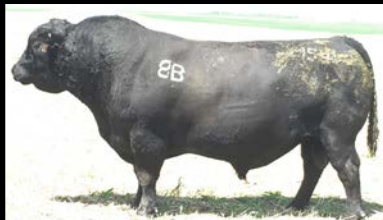
right: Great Grandam - 51F