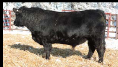
Maternal Sibling - 2012