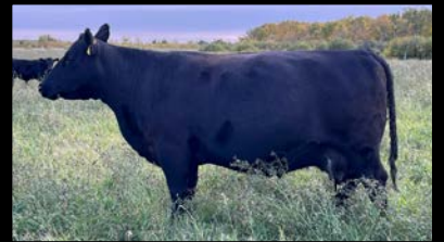
Dam - 1946