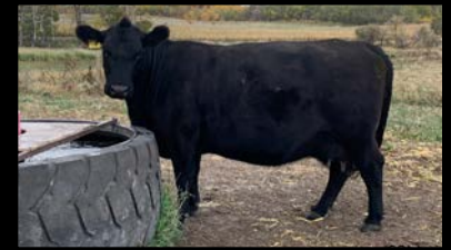
Grandam - 1426