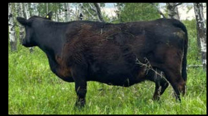
Grandam - 1331