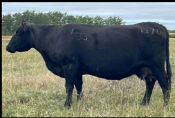
right: Mat Sib - 2139