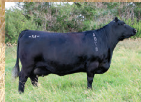
Granddam Flora 6078D

MOHNEN AMBASSADOR STYLES AMBASSADOR D004 STYLES LASSIE B007