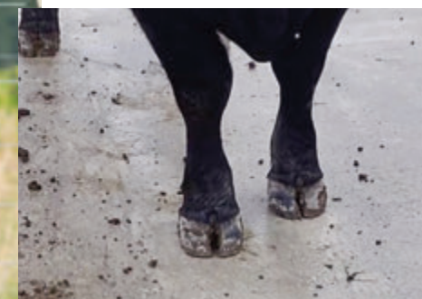
Roy R38 feet