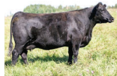
Dam Blackcap 201K

ACT BW 90 We love the extension of the front end of this calf and his overall length of body. His mother is a hardworking Alcatraz daughter out of the HF Blackcap cow family. Just like all of the Preacher calves, 504N has a huge foot and big testicles. We are very high on the future of this bull calf. With his extra length, he will add a lot of pounds to his calves at sale time.