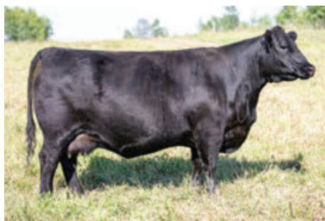
Dam Magnolia 10H

ACT BW 97 A younger Warrior calf out of our donor cow, Magnolia 10H that we own with Hills of Home. This calf is fault free and it's hard to find a hole in him. Being out of the Magnolia cow family, who gets it done every-time, this guys pedigree is made to go on and breed and have an impact on anyones herd.