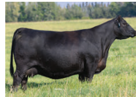
Donor dam Magnolia 2D

Preg checked safe to KR Incentive 3052 for an early February calf.