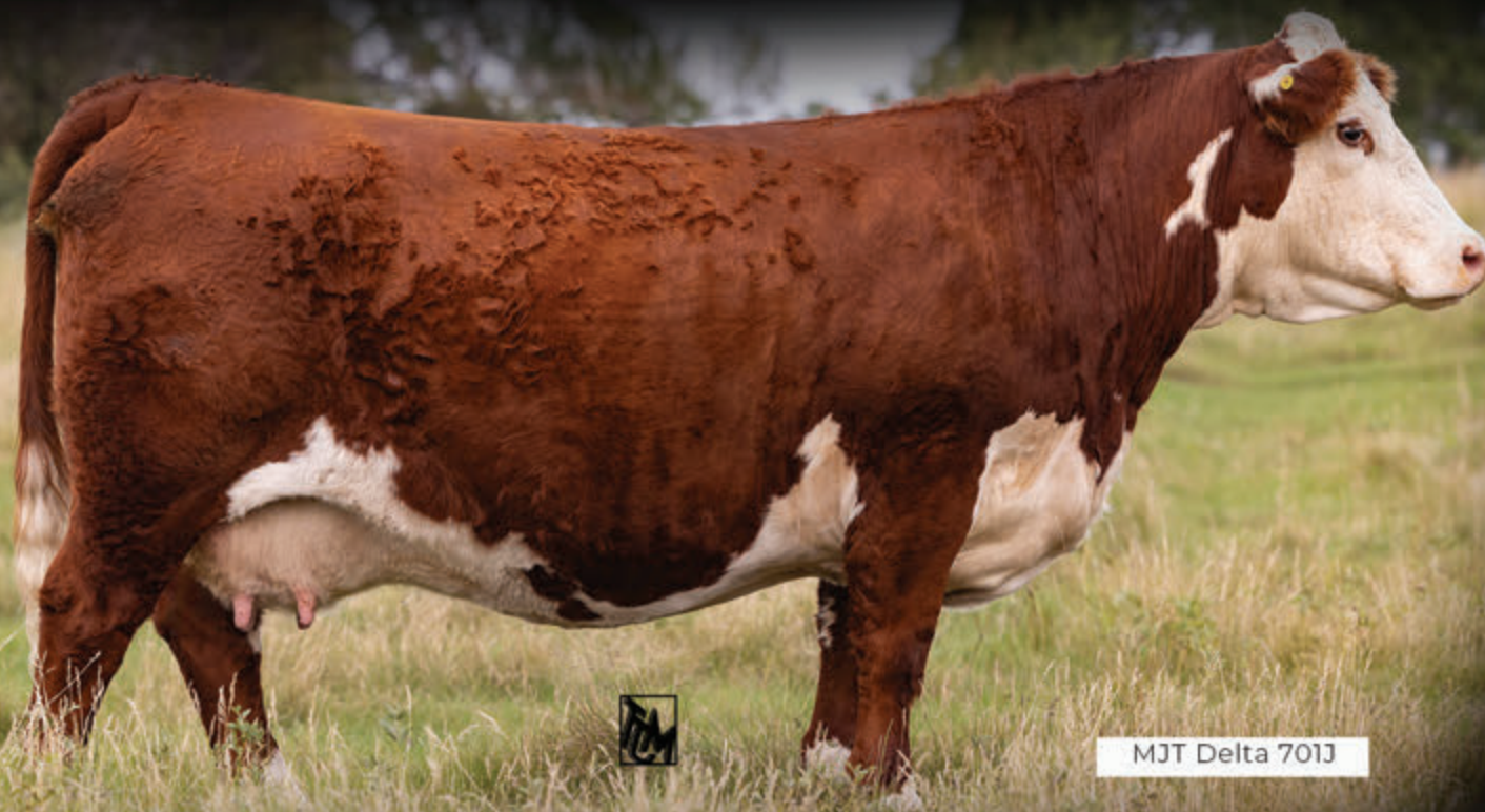
MJT Delta 701J