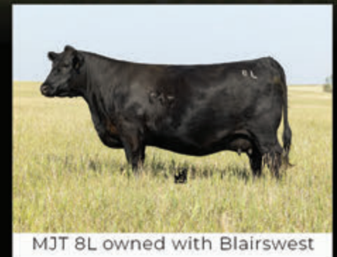
MJT 8L owned with Blairswest