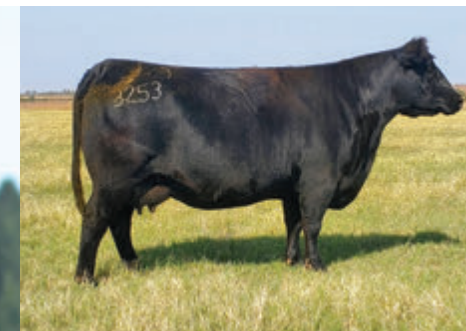
Dam of embryos Dixie Erica 3253