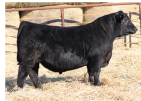
Sire Ambassador D004