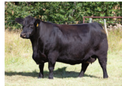
Donor dam Toots 79B