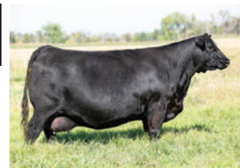
Donor dam Erica 267F