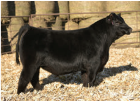
Sire Amplify 984

ACT BW 72 The first daughter ever offered out of the 2024 Canadian Western Agribition Champion Socialite 1028! 5051 is the embodiment of power cattle, bold ribbed, stout hipped and square on the ground all wrapped in a smooth and stylish package. Wicked looking, awesome skulled and is truly the right kind of cow for the beef business. Watch for her flush and maternal brothers to highlight the bull pen this spring. Get in early on what we feel is going to be the next great cow in the Merit program. Merit reserves the right to one successful flush at the buyers convenience and the sellers expense. Consigned by Merit Cattle Co