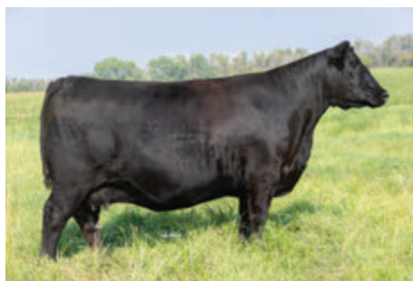
Dam Elbar 23H

ACT BW 84 A smooth made Preacher son out of a little different pedigreed Titan daughter from Bar H. 520N is fault free that you will really appreciate for his masculinity and smooth lines.