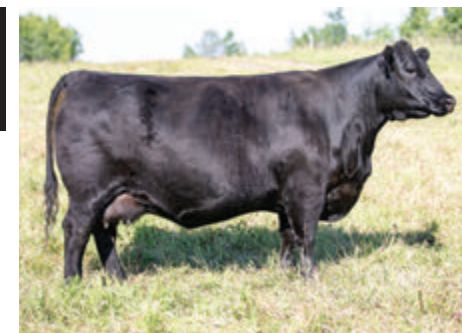
Dam Magnolia 10H

ACT BW 102 An absolute stud in the pen who was picked by many on summer tours. He's out of Magnolia 10H, a donor we own with Hills of Home who never disappoints. One of 2D's finest daughters who has one of the nicest udders on our operation and stops you in your tracks. 511N was our heaviest weaning calf and will pass that trait onto his calves and will pound down the scales at sale time. He's a rare combination of balance, athleticism, masculinity and power. Terms to be announced sale day.