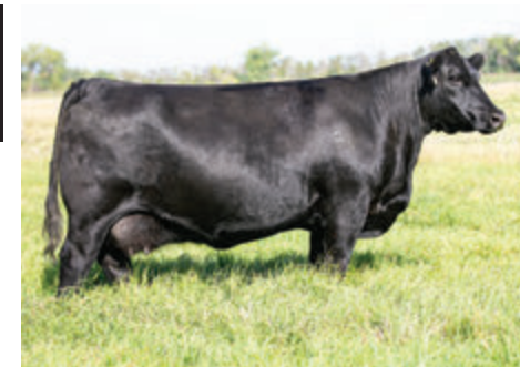
Dam Fay 4J

ACT BW 96 A powerhouse Preacher son out of our next future donor cow, 4J. 516N has been one of our favorites since birth; tons of mass, big hiped and that herdbull look. His dam is a beautiful Tribute daughter who gets the job done - her bull calf last year sold for $20,000 to Little Rainbow Ranch. If you want to pound down the scales in the fall on a set of calves, this is the guy that will get it done.