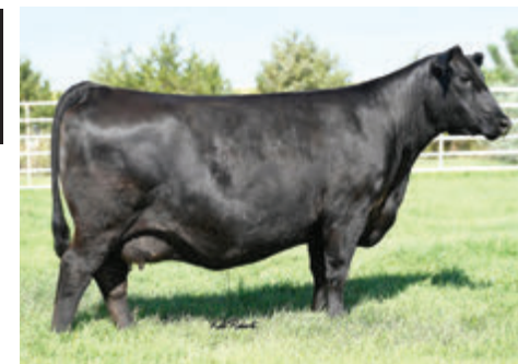
Dam Miss Bell 8036

Owned with Bar H Land & Cattle and Krebs Cattle