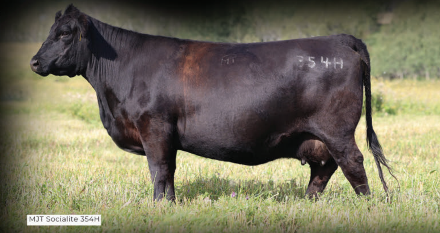
MJT Socialite 354H