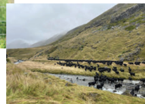
Taimate Angus Stud

CONNEALY CAPITALIST 028 LD DIXIE ERICA 3253 AAA 17666104 LD DIXIE ERICA 2053