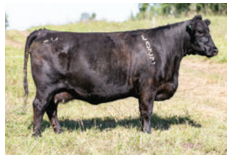
Dam Countess 3055L

ACT BW 81 562N is a true heifer bull out of a hard working 2 year old Merit cow. He is smooth made through his head and shoulders with lots of length and lots of grow. This guy will make sleeping through the night easy.