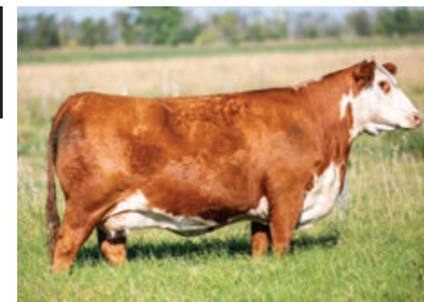
Dam Uma Lyn 29H

ACT BW 90 A High County out of a gorgeous uddered Fortify cow that puts it all together - dark red in colour, big scrotal and lots of meat. If you're looking for a bull to build females around, mark this guy high on your list.