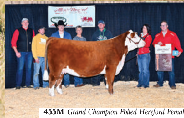
455M Grand Champion Polled Hereford Female 2025 AB Hereford Showcase