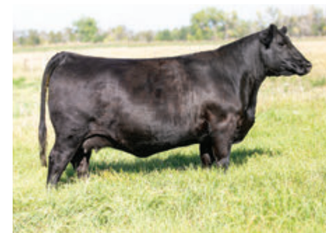
Dam Big Sexy 317L

ACT BW 85 This bull is out of a Royal Reseve two year old who stems back to our Big Sexy 90E donor cow who Allison Farms purchased half interest in for $45,000. 512N's dam hit it out of the park with this Revival calf who brings a little different pedigree to Golden Oak. 512N transmits performance, lower birth weight and stunning type and kind.