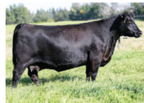
Dam Tibbie 403G

ACT BW 97 Warden 523N demands your attention the second you walk into the pen! He has that herdbull look stamped all over him - big hiped, big middled, big testicles and an extremely attractive look. 523N is stout from the ground up with tremendous rib shape and masculine presence. You're going to want to lock down The Warden!