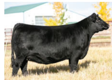
Full sister Toots 308L owned by Merit Cattle Co