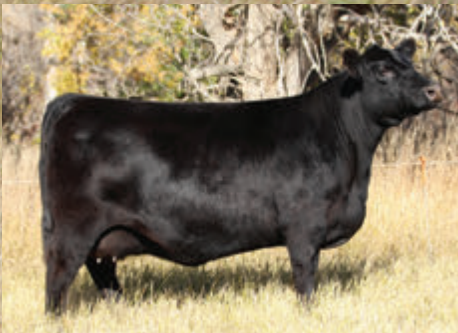
Dam Socialite 1028J

CE: 11 BW: 0.6 WW: 66 YW: 130 MILK: 34 CEM: 9