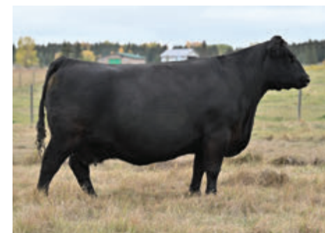
Dam Lady 61Z