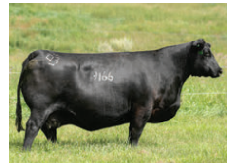
Dam Ms Final Answer 9166G