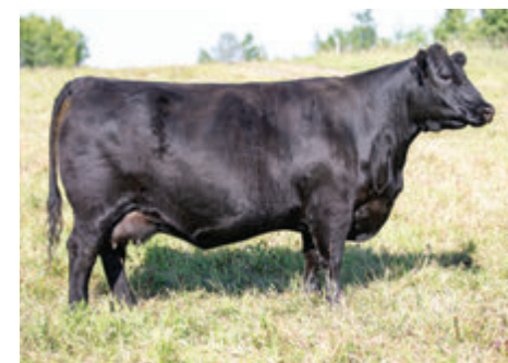
Dam Magnolia 10H

ACT BW 98 A flush mate to 511N, 514N shares a lot of the same qualities as his full brother. His pedigree is stacked to produce females and bulls that will weigh in the fall. He's a long, deep bodied calf that has a great look to him.