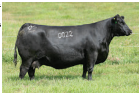
Dam Ms Stunner 0022H