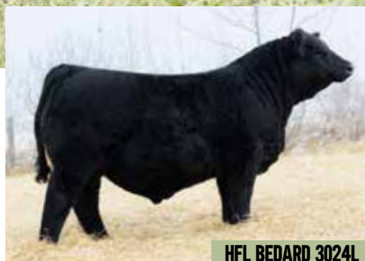
HFL BEDARD 3024L