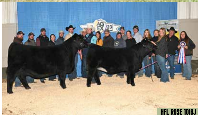
HFL ROSE 1016J

2023 AG EX SUPREME CHAMPION, MATERNAL SIBLING TO DAM