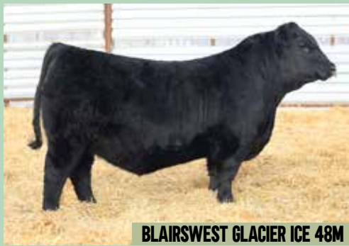
BLAIRSWEST GLACIER ICE 48M