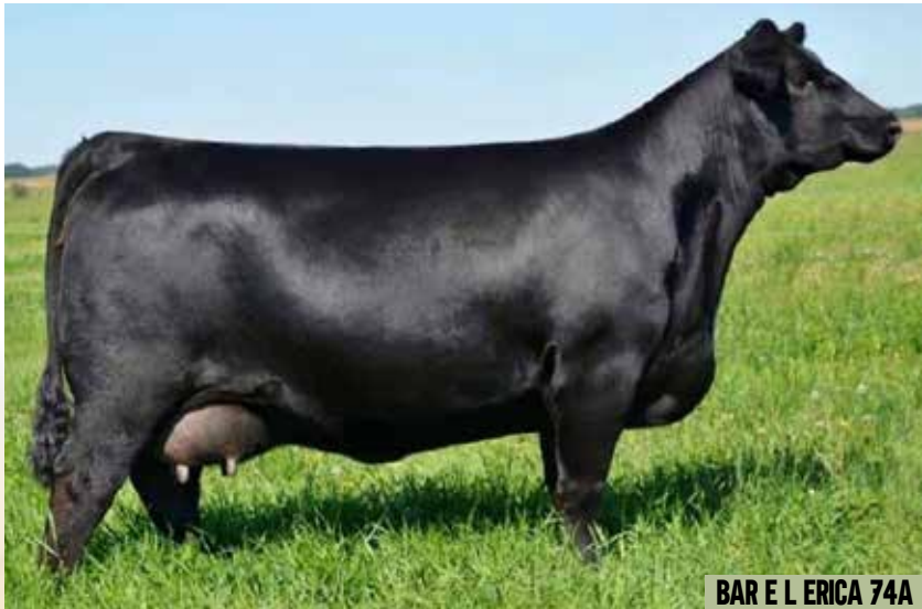
BAR E L ERICA 74A DAM OF SERVICE SIRE