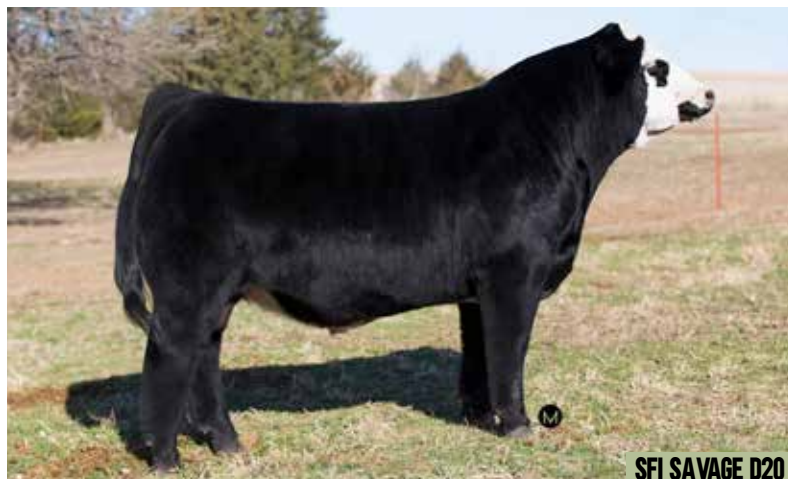
SFI SAVAGE D20