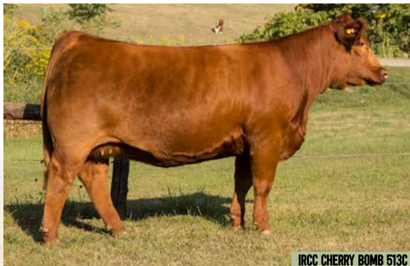
IRCC CHERRY BOMB 513C MATERNAL GRANDDAM

8 HFL DBD CHERRY BOMB 4066M 23/1/2024 HFL 4066M CA-PG1476290