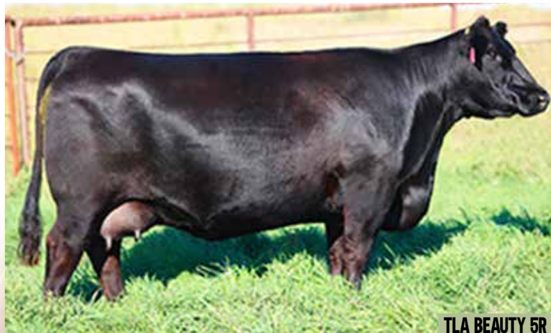
TLA BEAUTY 5R DAM