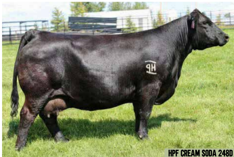
HPF CREAM SODA 248D