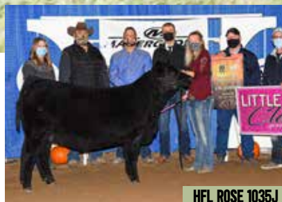
HFL ROSE 1035J

ALL BREEDS CHAMPION AND 2022 CHAMPION FEMALE