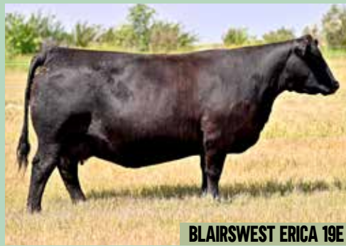
BLAIRSWEST ERICA 19E