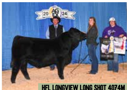
HFL LONGVIEW LONG SHOT 4074M

ALL BREEDS CHAMPION AND 2022 CHAMPION FEMALE