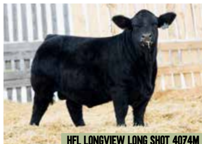
HFL LONGVIEW LONG SHOT 4074M

BLACK GOLD CLASSIC ALL BREEDS RESERVE CHAMPION BULL, AG EX CHAMPION BULL CALF AND RESERVE SIMMENTAL BULL, CWA RESERVE SENIOR BULL CALF CHAMPION