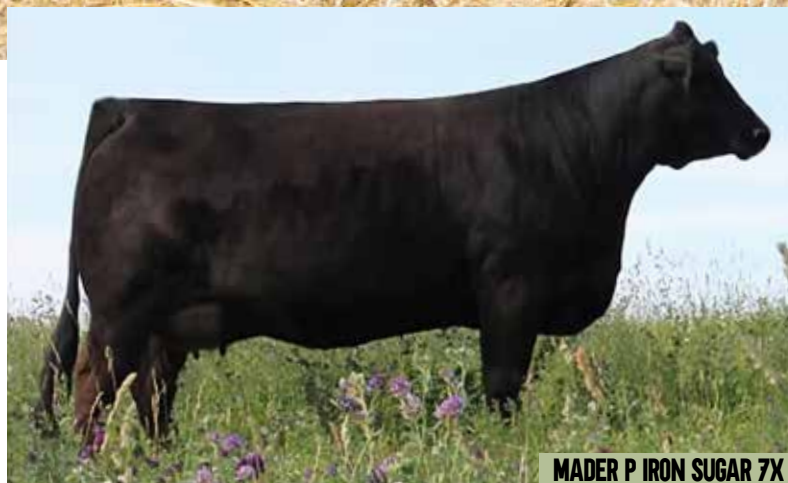
MADER P IRON SUGAR 7X