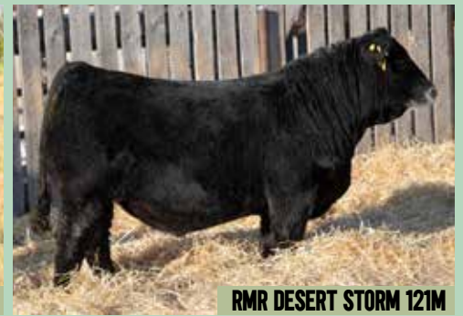
RMR DESERT STORM 121M