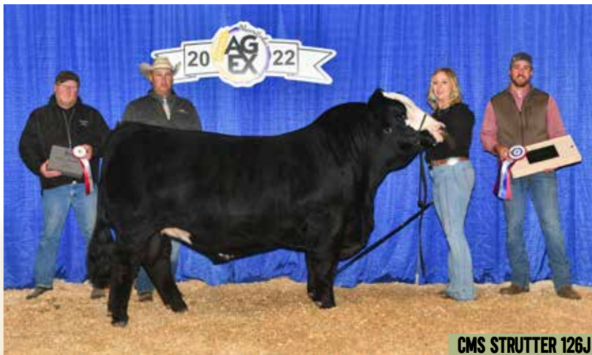
CMS STRUTTER 126J

SIRE - 2022 AG EX GRAND CHAMPION SIMMENTAL BULL