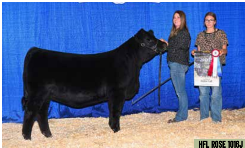
HFL ROSE 1016J

2023 AG EX SUPREME CHAMPION, MATERNAL SIBLING TO DAM