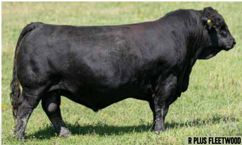
R PLUS FLEETWOOD SERVICE SIRE