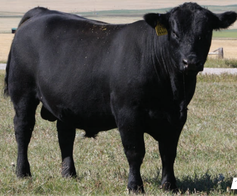
Madame Pride 3145 Maternal Granddam of Circuit Breaker 144H