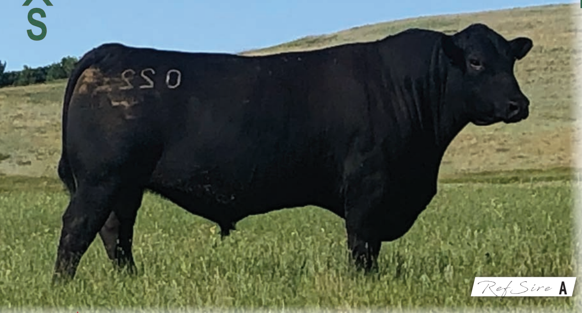
Ref Sire A