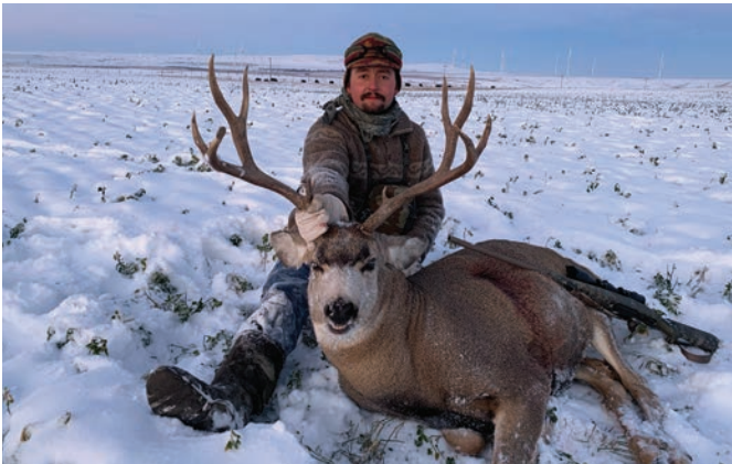
Merrick & Muley Buck