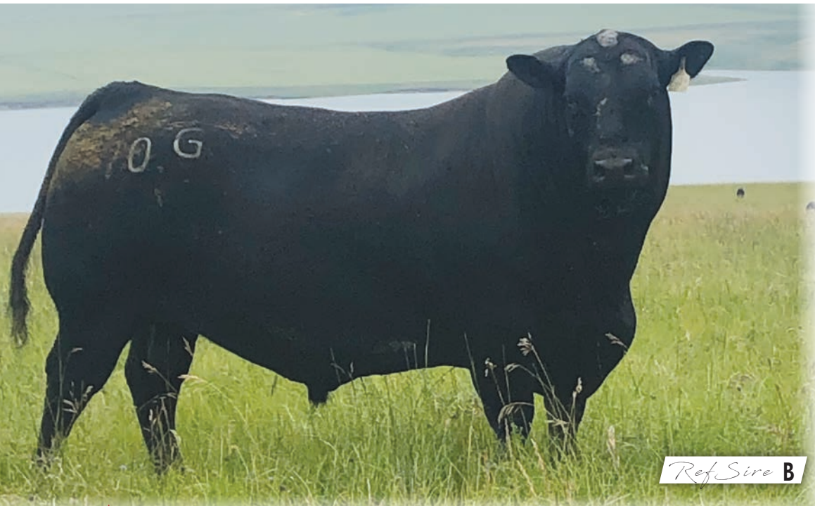
Ref Sire B

Marcys Crusher 022 is a powerful son of the breed legend, Marcys Scale Crusher. The Crusher cattle are known for their pounds of production with a strong foundation of structural soundness and maternal strength. Crusher 022 was the high selling yearling bull from Marcy Livestock in 2021, and is backed by a tremendous dam sired by Leachman Right Time. His first daughters will be in production in the spring of 2024. Help yourself to a tremendous set of herd bulls, February 8 in Fort McLeod. 26 SONS SELL