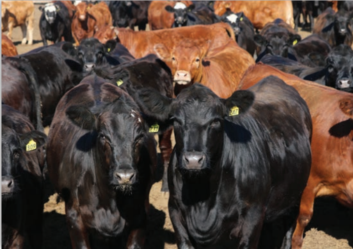
Genetics that blend Maternal qualities plus longevity bred into the replacement females from cow lines that have proven themselves.