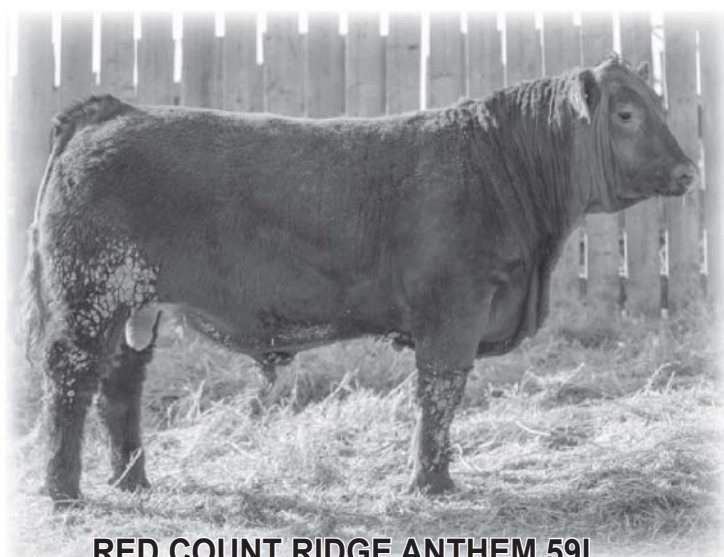
RED COUNT RIDGE ANTHEM 59L Sells as Lot 4