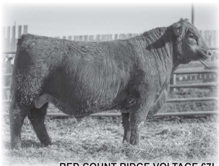
RED COUNT RIDGE VOLTAGE 67L Sells as Lot 14