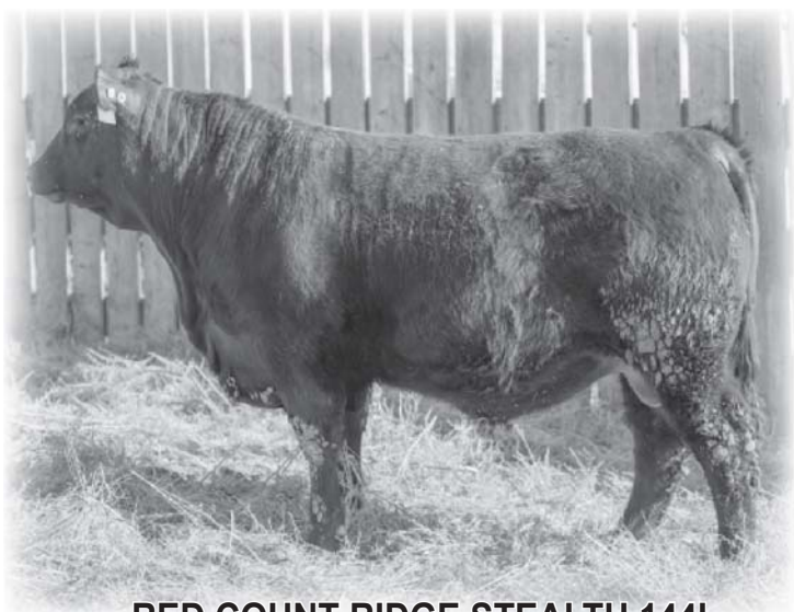
RED COUNT RIDGE STEALTH 144L Sells as Lot 32