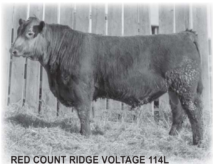
RED COUNT RIDGE VOLTAGE 114L Sells as Lot 17