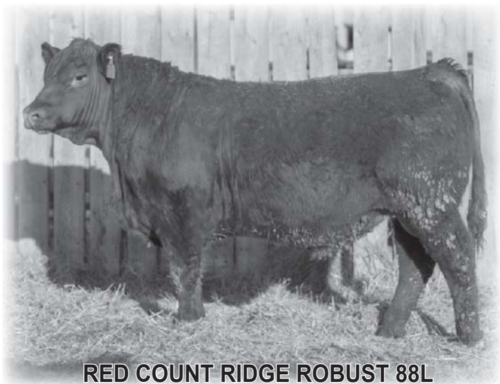
RED COUNT RIDGE ROBUST 88L Sells as Lot 37