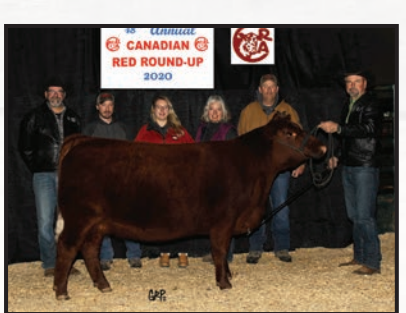
Guilty Pleasure 48G at RRUP

whistles that we have strived to achieve. We have never raised a bull calf with as much top, width, thickness and easy fleshing ability as ICON. From the day he was born he has been a standout with over all style and incredible disposition. 416K dam Red Shiloh Guilty Pleasure 48G was a Red Round Up purchase from Blake and Darcy at Shiloh Cattle Co. for $11,000. 48G is one of Kelsey and Wills easiest doing females with great depth of body and is a great milker. Kelsey and Will are very excited for ICONS future.