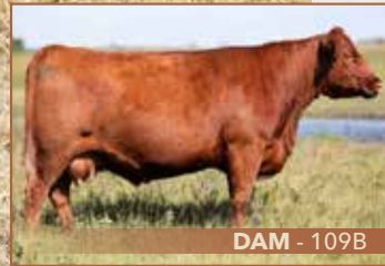
DAM - 109B