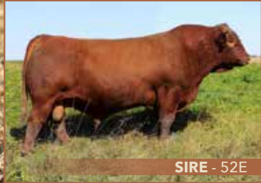
SIRE - 52E

This bull has a pedigree that does not disappoint! The 277D cow has once again raised another strong homo Polled bull for the sale. This bull's sire Utah Whiskey speaks for himself having progeny working all over the place. Owned by Mc-Three