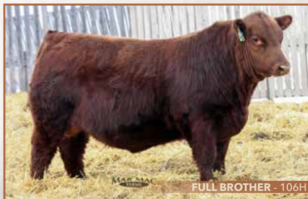
FULL BROTHER - 106H