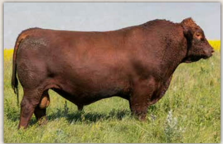
Herdsire RED MOOSE CREEK RIPZONE 1943154 CDI 89D 15-MAR-16