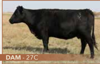
DAM - 27C

This is a very nice made, moderate framed bull out of a cow that has had many bulls in this sale over the years.