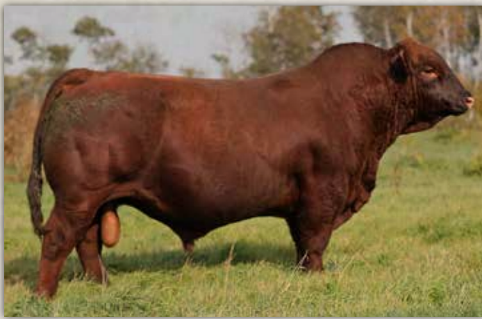
Herdsire RED BLAIR'S NAVIGATOR 37E 2016094 BBC 37E 11-APR-17