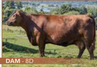
DAM - 8D

Here's a heifer bull that won't sacrifice pounds. Sire Atomic is in the top 1% for weaning and yearling weights. This dark cherry red, dark footed long bodied, thick quartered bull will be a great addition to the heifer pen or your cow pen.