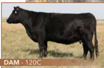
DAM - 120C