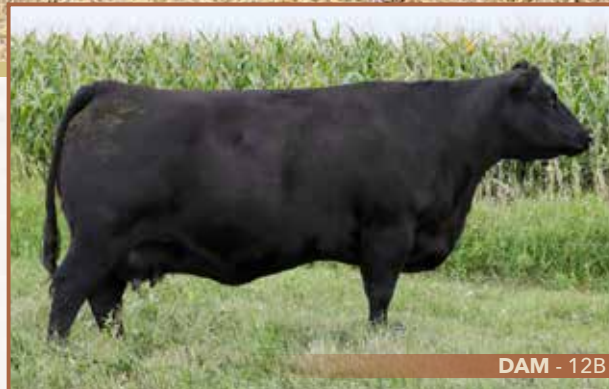
DAM - 12B

Wow, this is Lincoln's Full brother and his dark cherry red color is bound to catch your eye. Lincoln has done an amazing job breeding and this guy may just follow along in his brother's footsteps. Here are some outcross genetics with the Navigator and SAV Resource and throw in Mulberry, some real potential here in the Siera Cow Family . We had an excellent flush on 12B, with an exceptional group of Red and Black females and 2 bulls. Another full brother sells as Lot 35.