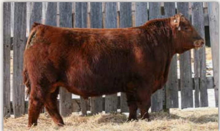
RED COCKBURN SIMPLIFY 1104 calves coming 2023!

Lincoln, the first Navigator son to sell, sold for $30,000 in our 2021 Bull Sale to Six Mile Ranch and Mc Quantock Ranching. This unique individual is out of a Black Resource female going back to a Mulberry cow. Lincoln is dark cherry red, full of red meat and a bull that should improve the maternal and paternal strength in a program. These are an extremely impressive set of Lincoln sons in the sale and Lincoln has proved to be short gestation. Our first Lincoln daughter sold for $10,500 to Wilbar Farms.