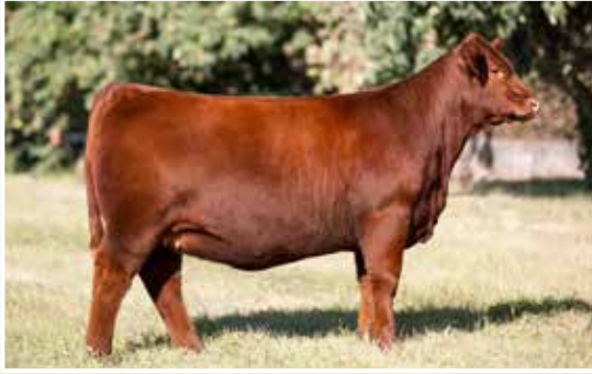
DAUGHTER OF THE MAR MAC POWER PLAY 168F owned by Allison Farms HIGH SELLING HEIFER CALF AT RED ROUNDUP 2022