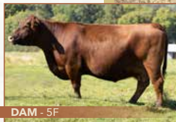
DAM - 5F

The 5F cow and her calves have tremendous temperaments. Maternal brother is doing a great job in the Smith herd and maternal sister did a great job for us with her first calf. Sire Merlin 018A has worked so well for us with great calving ease, birth weights and consistent gains. He has been our go to AI heifer sire. A bull with lots of depth, Nice classy small head and a strong set of EPDs. Everything about 12K checks off the heifer bull boxes.