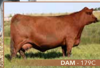
DAM - 179C