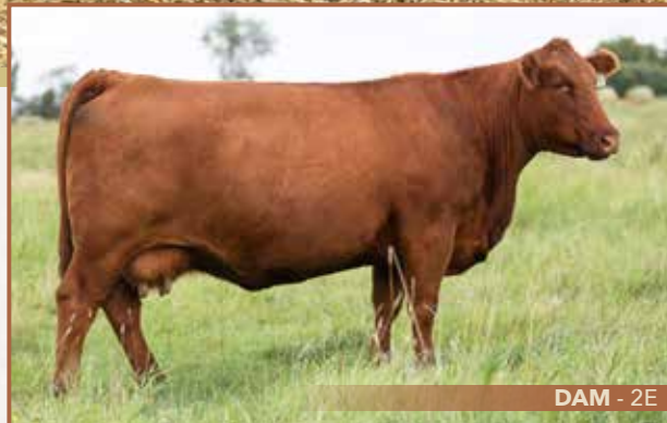
DAM - 2E

This Navigator son has been a feature of the bull group all year. Explorer has added performance, length of body and structural soundness. Herd bull time with this guy. With the proven genetics of Navigator, Mulberry and Lady Trooper, the opportunities are endless.