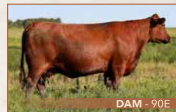
DAM - 90E