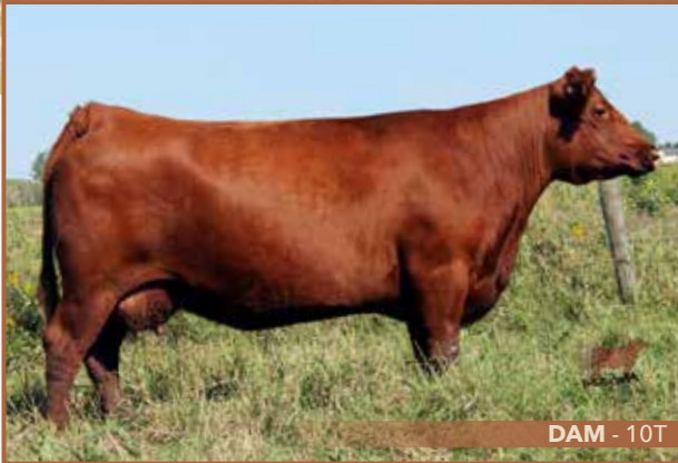
DAM - 10T