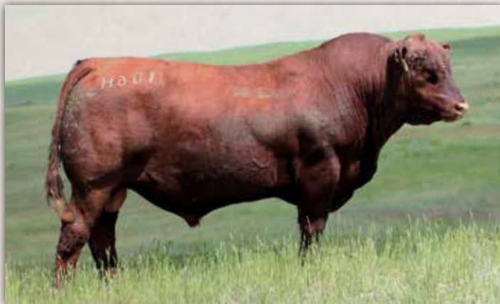
Herdsire RED MAR MAC LINCOLN 106H 2141405 KOF 106H 20-FEB-20

Ripzone just continues to amaze us with the quality bulls and females he is leaving in our program. He adds natural thickness, hip structure, a good foot and length of spine. His first daughters have tight perfectly made udders and have weaned off a strong set of calves. His sons are impressive check them out in the sale offering. This bull has really made a mark in our program and will continue to be an asset to many beef producers.