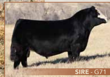
SIRE - G71