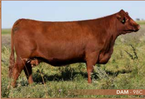
DAM - 98C

CE: 3.0 BW: 1.8 WW: 46 YW: 78 MILK: 26 MCE: 6.0