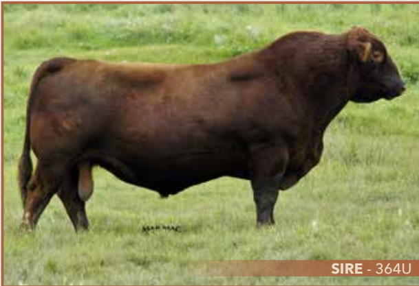
SIRE - 364U

This is an old pedigree with Ruby 10T Cow Family . She had a number of sons and daughters that had worked well and we were hoping to get some more daughters to continue her legacy but ended up with these 2 sons. Ribeye was a powerful individual who left some stout beefy bulls that went out and worked in the purebred and commercial industry and his females were power cows with excellent feet and udders. Here are two bulls that will be assets to a program being on different recipis they continue to excel. These are the last two of this mating available.