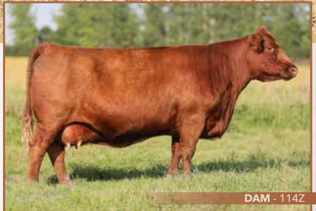
DAM - 114Z

CE: 1.0 BW: 2.3 WW: 49 YW: 73 MILK: 23 MCE: 7.5