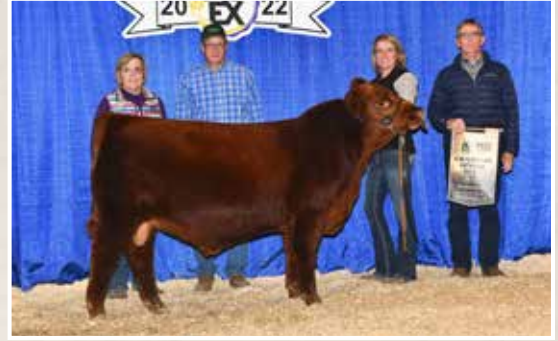
RED MAR MAC DM LANDMARK 10K AG EX SENIOR CHAMPION BULL CALF 2022