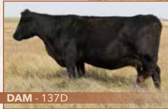
DAM - 137D

Here is another Coleman Bravo son that is super quiet and will work well on heifers. His 1/2 brother sold in last year's sale to 7L Ranch of Lakeland, MB. These are bulls that are built to work in the real world.