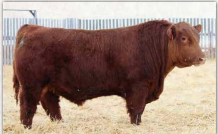
RED MRLA ADMIRATION 29J calves coming 2023!