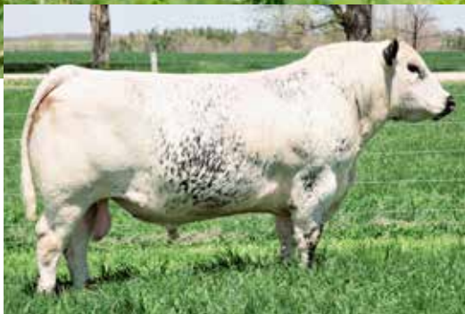
SPLASH OF BLACK GOTCHA 7G