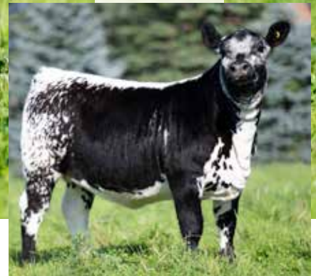
MARTINSTAR LUSCIOUS 5L

SIRE MATTERS EXCELLENCE 50E SPLASH OF BLACK GOTCHA 7G MATTERS DANCER 7D