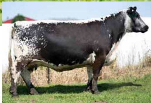
RIVER HILL GUM-DROP 211G