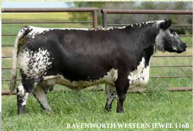
RAVENWORTH WESTERN JEWEL 116B

We can't say enough about this combination other than that it works, giving you 2 calves with hip, muscle, and style. Ravenworth Western Jewel needs no introduction with many of her daughters making their way to the top in many different herds.