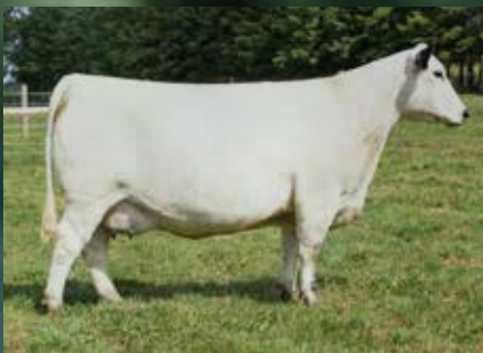
STEELE ENVY 17E 2022 High Selling Cow