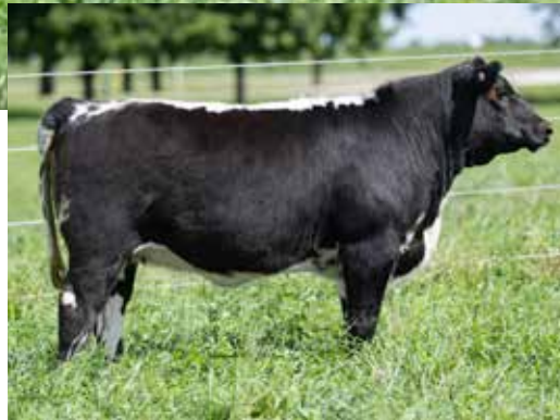
PROGENY: 2022 HIGH SELLER