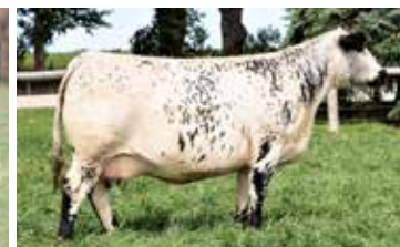
DIAMOND K RANCH SPRUCEY 13Z