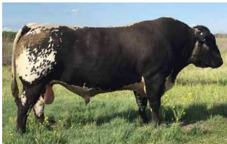
CALICO CREEK BUTANE 8B