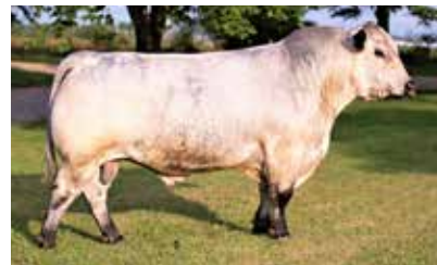
RIVER HILL SMOKESHACK 252E

DAM COLGAN'S BAXTER 1B SILVER TIP GLITTER 04G RAVENWORTH WESTERN JEWEL 116B