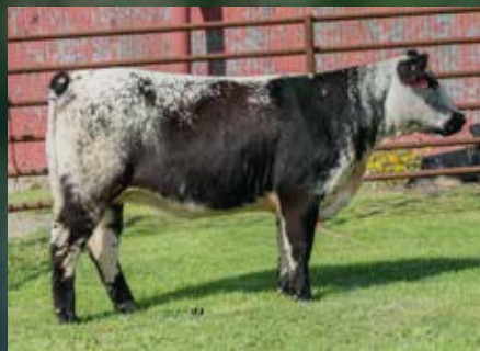
FLEETWOOD JUPITER 21J 2022 High Selling Bred Heifer