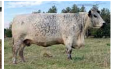
RIVER HILL 60A DA-CHANCE 05D