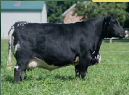
RIVER HILL FABULOUS PEARL 28F