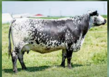
COLESDALE CAMELOT 1G