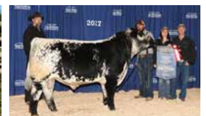
DEXTER D'ANGELO 01D