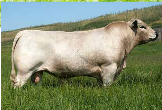
RIVER HILL 50U ALL IN 60A