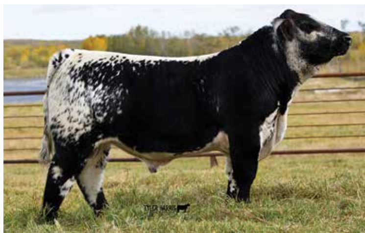
EDED PP CARRIER