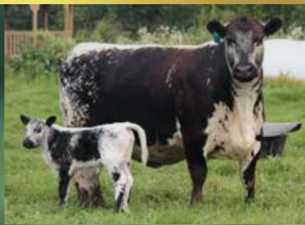
RIVER HILL GUM-DROP 211G