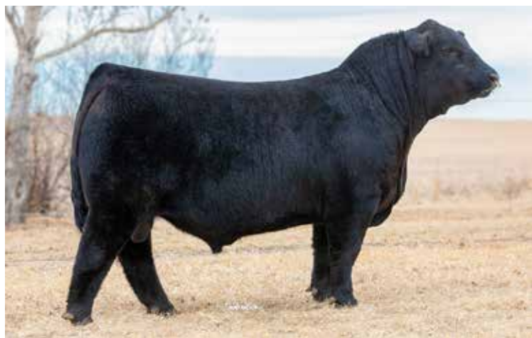
GREENWOOD COAL TRAIN 84J

CODIAK SELENA GNK 04H \times GREENWOOD COAL TRAIN 84J OR CALICO CREEK BUTANE 8B 3 EXPORTABLE EMBRYOS