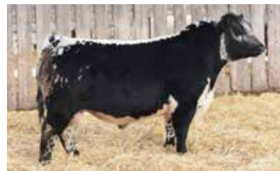
RIVER HILL GODZILLA 916G

DAM COLGAN'S BAXTER 1B SILVER TIP GEWEL STS 01G RAVENWORTH WESTERN JEWEL 116B