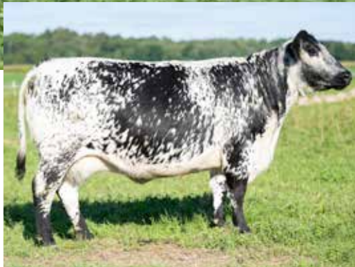
STEELE DRAMATIC 4D