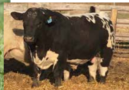
CALICO CREEK EVOLUTION 16E