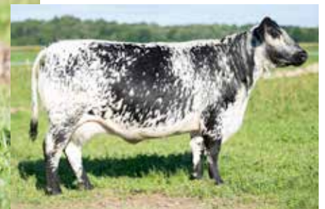
STEELE DRAMATIC 4D

POLLED BRED HEIFER • CLSD 05K • CAN16848 • 15/1/2022 • BW:64 EDED PP NON-CARRIER