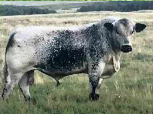
RIVER HILL 50T CRUSADER 025C