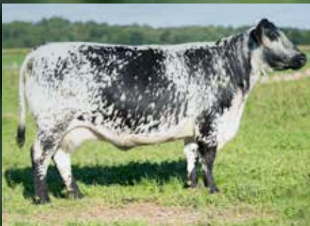
STEELE DRAMATIC 4D