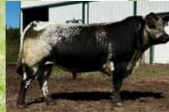
COLESDALE HERCULES 09H