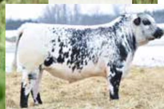
US DUST UP 20K