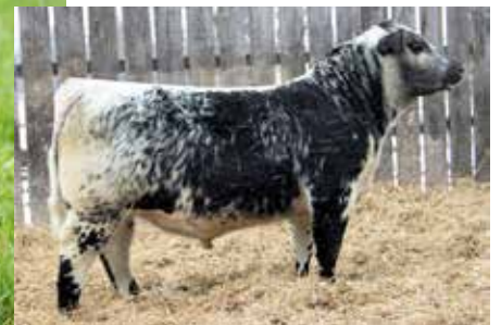
STEELE SECURE 7G

POLLED BRED HEIFER • MAL 5K • CAN15474 • 19/2/2022 • BW:72 EDED PP NON-CARRIER