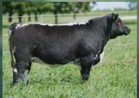
TRESTLE CREEK KISMET 3K 2022 High Selling Heifer