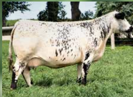
DIAMOND K RANCH SPRUCEY 13Z