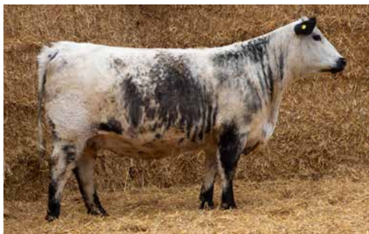
EDED PP NON-CARRIER