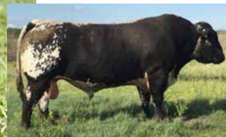
MATERNAL GREAT GRAND SIRE