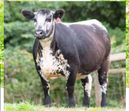
SILVER TIP 5K

SIRE RIVER HILL 68L STRIKER 50U RIVER HILL 50U ALL IN 60A RIVER HILL SHOW ME OFF 60S DAM MOOVIN ZPOTZ CAMARO 6X MOOVIN ZPOTZ BOULET 68B D.L.R. ZAURE 39T