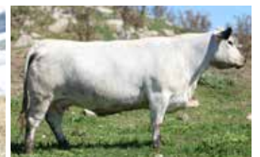
STEELE FRANCEEN 16F