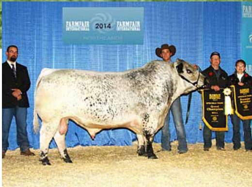
RIVER HILL 60W LINE DRIVE 54Z