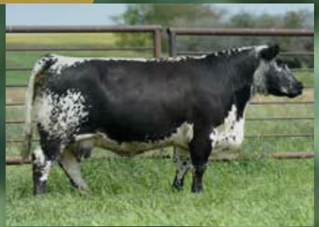
RAVENWORTH WESTERN JEWEL 116B