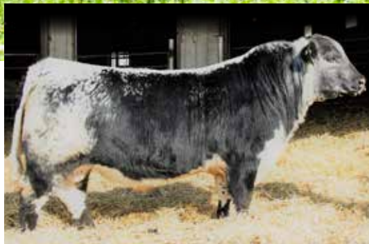
RIVER HILL COST-A-LOT 152C