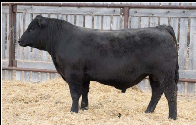
SHEIDAGHAN BROKEN BOW 143G - MAT SIB LOT 63

- AI'd to SAV TERRITORY May 18th - Exposed to Benlock Rush Lake 20J May 20th to July 21st - Due AI