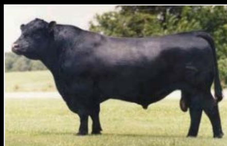
A & B YUKON 7150