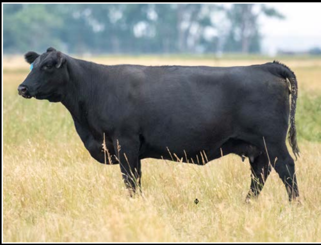
PARK VUE JUDY 45F - DAM OF LOT 67