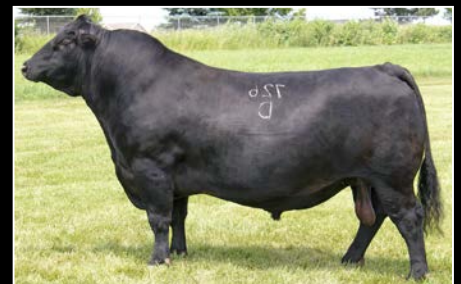
SITZ STELLAR 726D