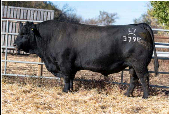
- MAJOR SIRE AND SERVICE SIRE