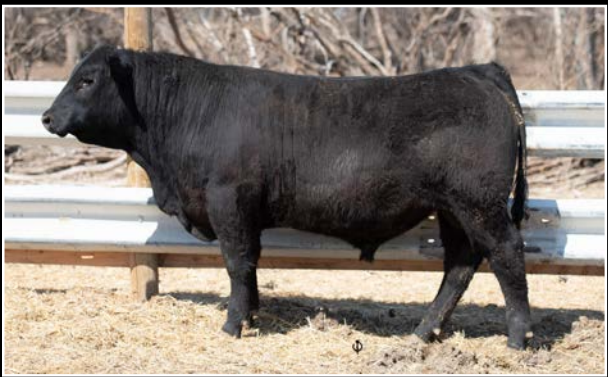
SHEIDAGHAN FOCUS 20H - SON OF LOT 15

- Exposed to MACNAB SCOTCHMAN 379E May 20th to July 21st - Due 2nd cycle