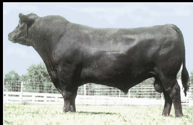
LEACHMAN RIGHT TIME - SIRE OF LOT 1B, 1C, 1D

< BASIN EXPEDITION R156 BASIN LADY S532 AK ANKONIAN WERNER WILD FIRE 96 LODGE COUNTESS 65S