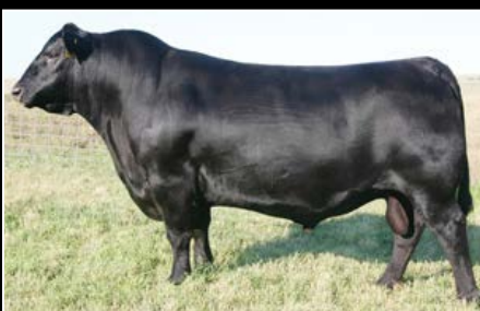
SAV 004 DENSITY 4336