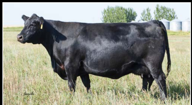
VALLEY LODGE COUNTRESS 17A - DAM OF LOT 1A, 1B, 1C, 1D