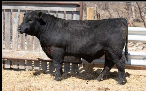
SHEIDAGHAN HOT LOTTO 3H - SON OF LOT 39