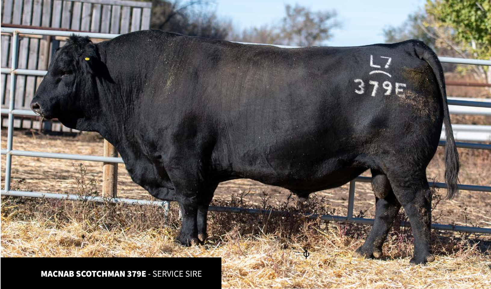
MACNAB SCOTCHMAN 379E - SERVICE SIRE