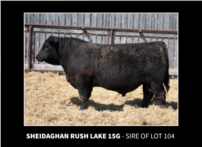
SHEIDAGHAN RUSH LAKE 15G - SIRE OF LOT 104