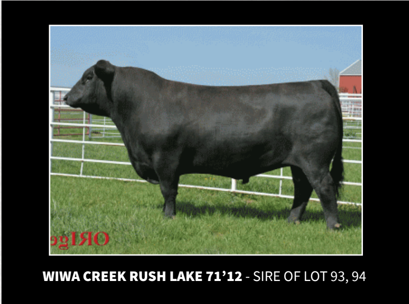
WIWA CREEK RUSH LAKE 71'12 - SIRE OF LOT 93, 94

- Exposed to MACNAB SCOTCHMAN 379E May 20th to July 21st - Due 1st cycle