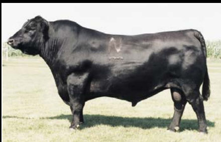
N BAR EMULATION EXT

ALL SEMEN IS STORED AT MILLENNIUM GENETICS ALL HANDLING, STORAGE AND ASSOCIATED COSTS ARE THE PURCHASER'S RESPONSIBILITY