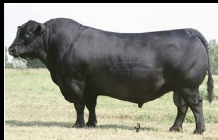
SAV FINAL ANSWER 0035