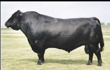
SITZ TRAVELER 8180

CATTLE WILL ENTER THE RING IN PAIRS BUT SELL IN SALE ORDER