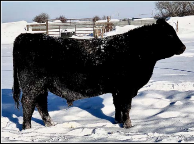
BENLOCK RUSH LAKE 109G - SERVICE SIRE