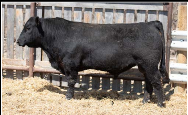
SHEIDAGHAN OUTSIDE 28H - MAT SIB TO LOT 75

- Exposed to MACNAB SCOTCHMAN 379E May 20th to July 21st - Due 1st cycle