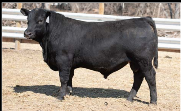
SHEIDAGHAN FOCUS 17H - SON OF LOT 10

- Exposed to BENLOCK FIREBUG 173J May 20th to July 21st - Due 1st cycle