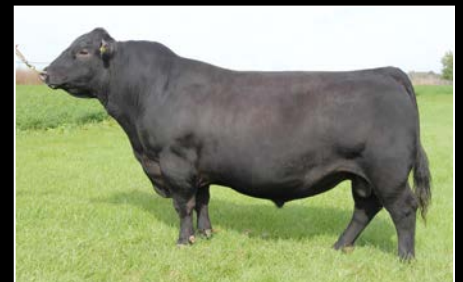
KM BROKEN BOW 002