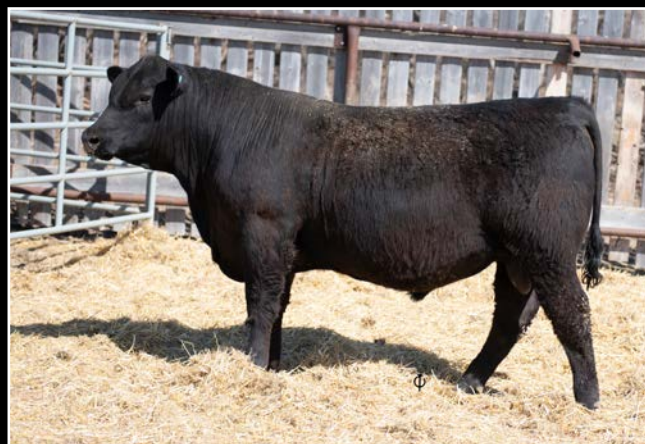
SHEIDAGHAN ALL STAR 174G - SON OF LOT 100