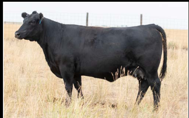
SHEIDAGHAN HEROINE 48F - DAM OF LOT 64