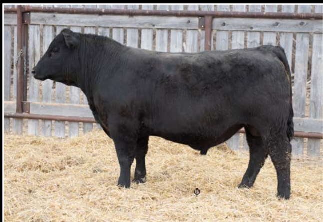
SHEIDAGHAN BROKEN BOW 143G - SON OF LOT 99