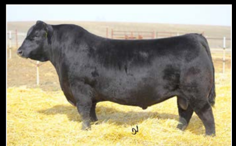
RB TOUR OF DUTY 177