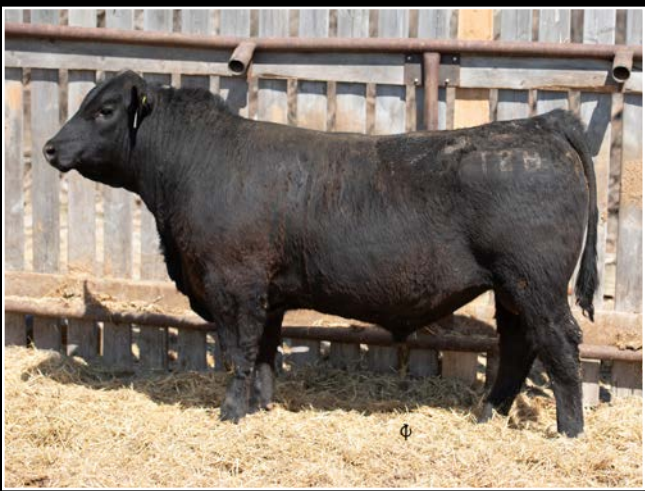
SHEIDAGHAN OUTSIDE 12H - MAT SIB TO LOT 96A

- Exposed to MACNAB SCOTCHMAN 379E May 20th to July 21st - Due 1st cycle