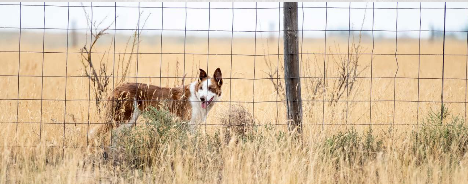
NORTHERN VIEW INFERNO 89G - SIRE