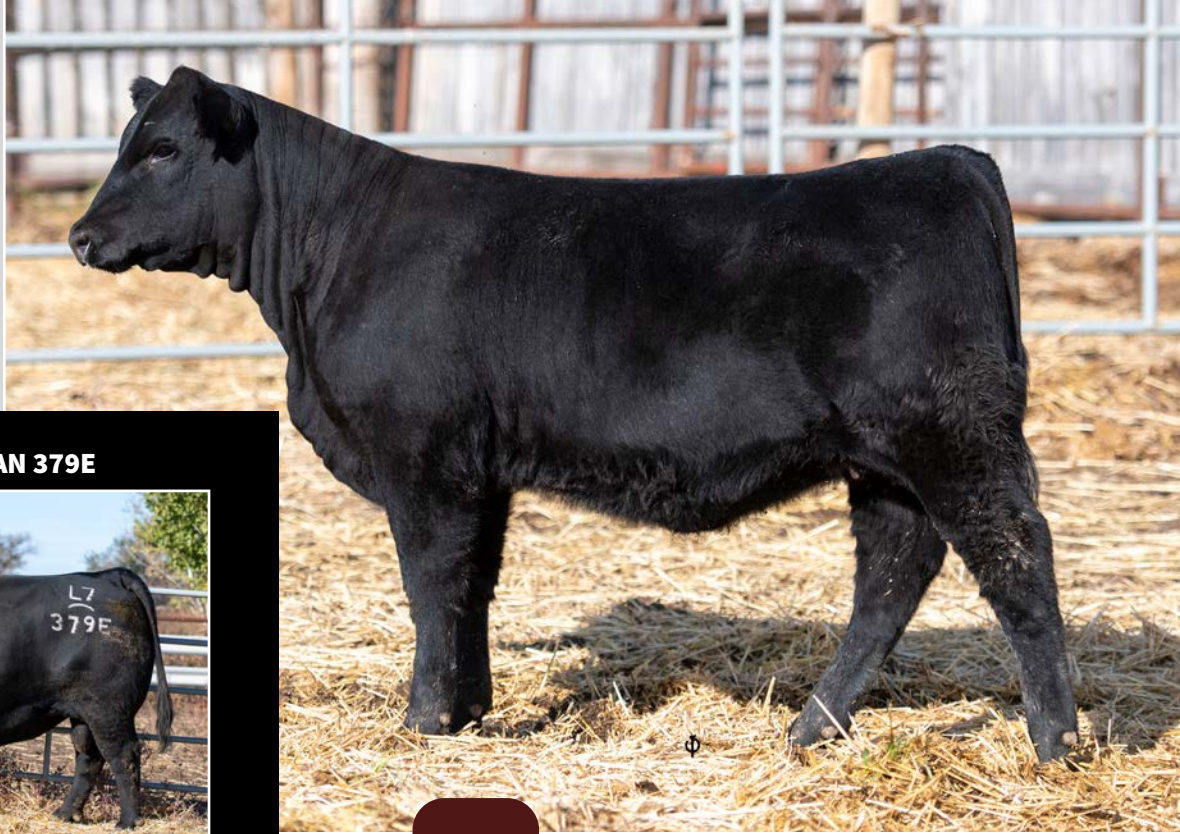
MACNAB SCOTCHMAN 379E