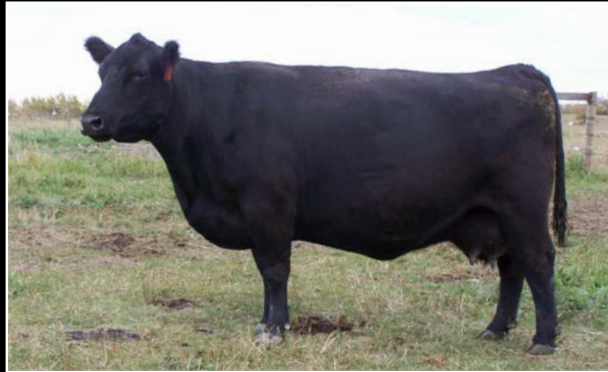
CRESCENT CREEK ROSEBUD 115F