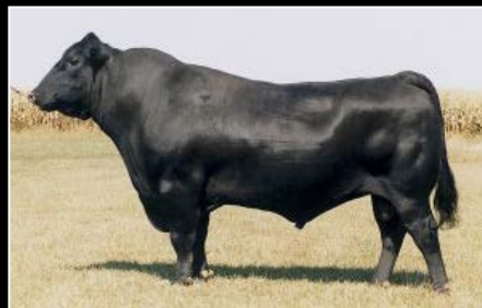
BON VIEW NEW DESIGN 878