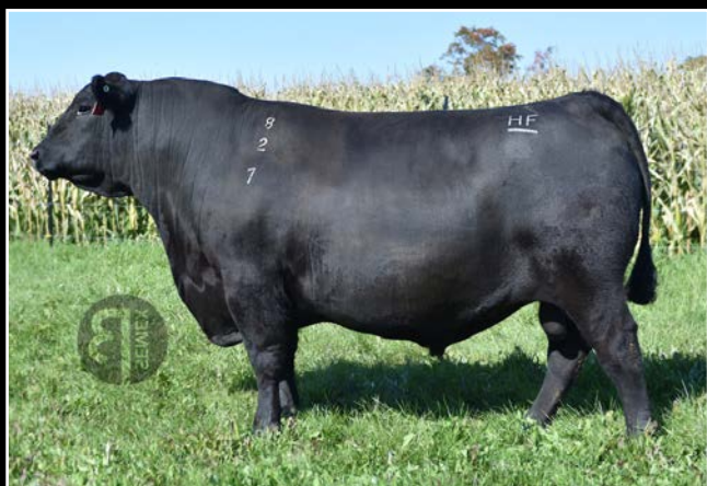
HF ROPER 27F - SIRE