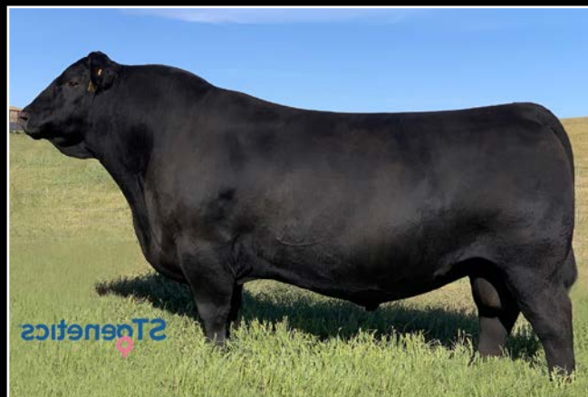
SAV TERRITORY - AI SIRE to LOT 2