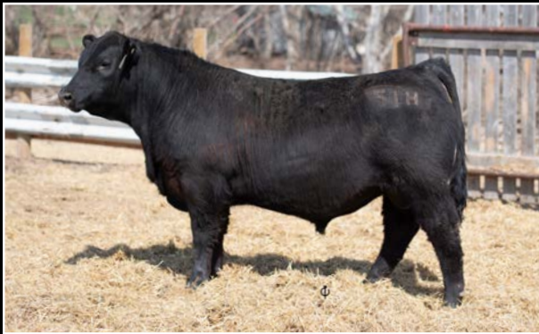
SHEIDAGHAN GREAT SCOT 51H - SON OF LOT 38