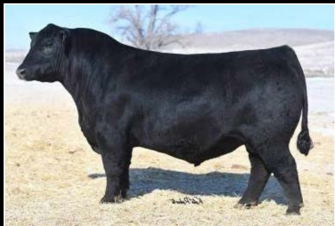
SITZ RESILIENT 10208 - AI SIRE to LOT 5