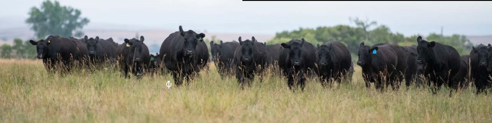
SHEIDAGHAN BROKEN BOW 33G - 1/2 SIB TO LOT 14A