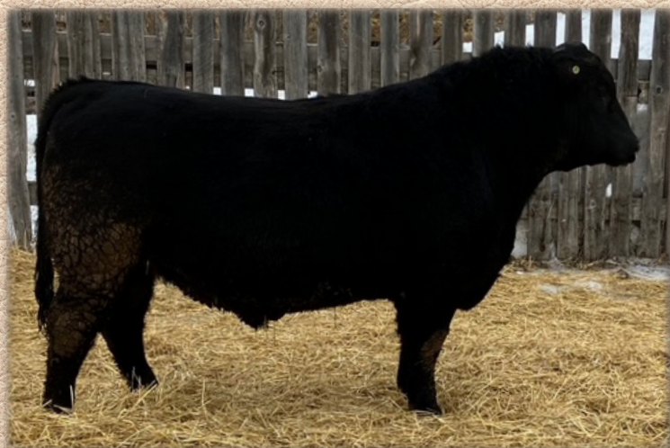
Lot 2 - JC CRAIG'S RESOURCE 11J