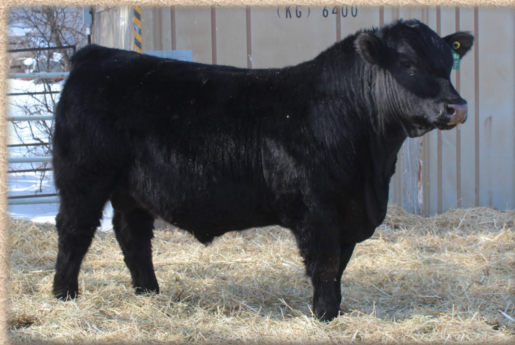
SIRE - YOUNG DALE HI DEF 119F

I was looking for increased growth performance when I purchased Hi Def 119F, and he does deliver. He has plenty of frame and mass to add pounds. He carries his long, heavy-boned frame on stout correct legs and excellent feet. He also has great muscle expression and hair. His gentle nature makes him easy to handle. A standout herd sire, he passes on these exceptional traits to his offspring.