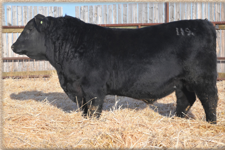
LOT 49 - BEAR CREEK WINDY 119J

We used 119J on a group of young cows, because without doubt he offers a ton of genetic potential. He's incredibly long and easy fleshing with a low birthweight that should calve heifers. If we showed cattle, his mother would certainly be one we would hang a halter on. She's a picture of an angus cow and certainly proved it by swinging for the fence on her first calf, producing a calf that weighed 692lbs adjusted weight. There's a lot of our program in his pedigree, the maternal grandsire I raised, and was a great bull, stout and easy fleshing with rock solid feet under him but we lost him to an injury. He comes from Stoney and 26T dam, which were instrumental in our program for years. His grandmother is a Jackson daughter, who was a tank, but sold because she came up open, but his great grandmother is 100B who has another top bull in the pen and is a consistent top producing cow. There's phenotype and pedigree to back up this bull, he definitely needs to be considered for your next herdsire.