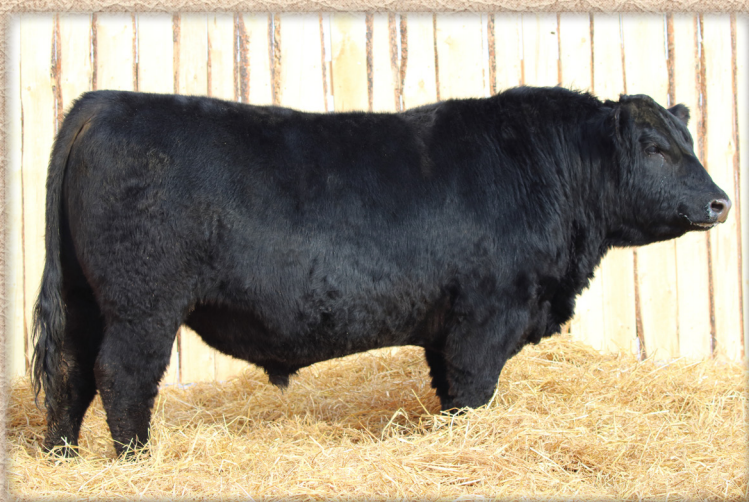
Lot 43 - FR HI DEFINITION 49J

This outstanding Hi Definition son is a long framed, big boned, and deep sided bull standing on good feet. He has been at the top end for growth in all weigh periods. He is beefy with a quiet temperament that makes him easy to work with.