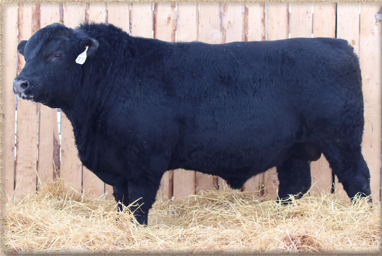
Lot 28 - FR MOMENTUM 37J