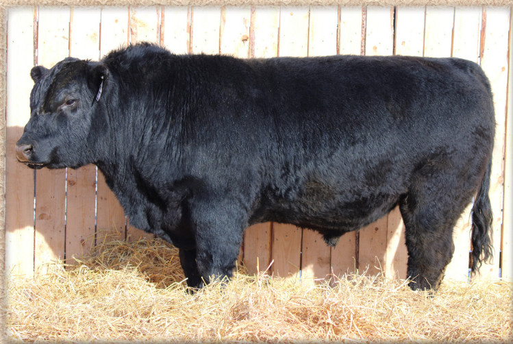
Lot 41 - FR HI DEFINITION 35J