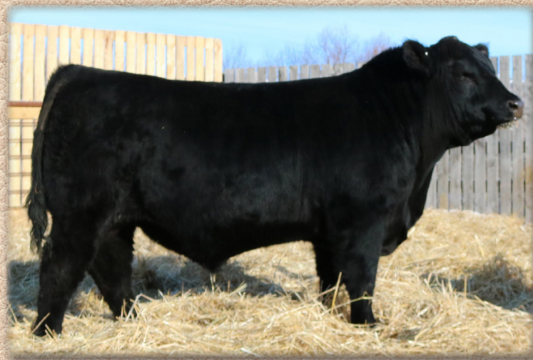
SIRE - CRESCENT CREEK MOMENTUM 10E

Momentum progeny have length, frame, good temperament and performance. We lost him last spring, but 10E will have a long-lasting influence on our program. The Rosebud females we have calved are impressive producers with ample milk, beautifully uddered, and trouble free. His sons that we have kept to use in our commercial herd are prolific breeders that maintain their condition throughout the season.