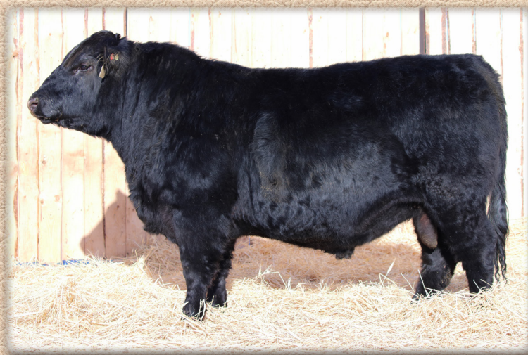
Lot 46 - FR HI DEFINITION 83J

A quality bull here. Nice working temperament with great hair covering a stout profile. He is deep flanked and thick across the top with a classic Angus head. His dam is a heavy milking Knockout daughter.