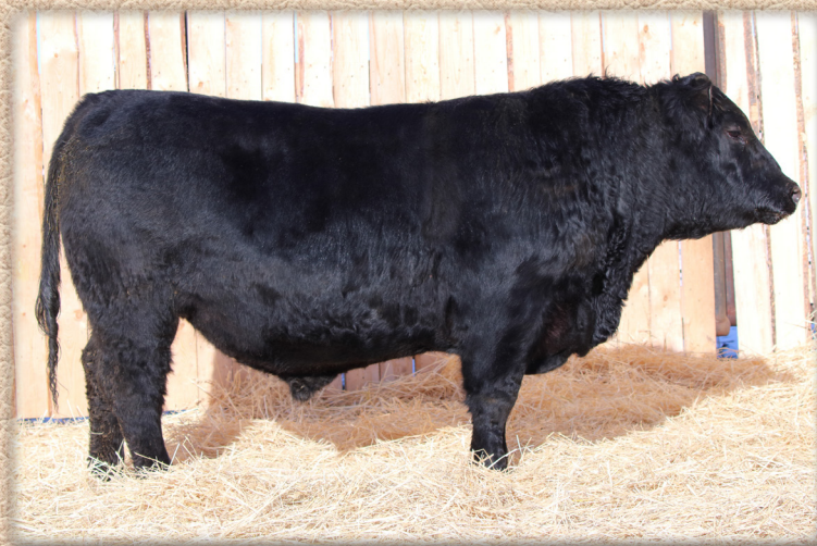
Lot 30 - FR MOMENTUM 93J

Long-spined, deep, and wide across the top. His mother is a larger framed, hard-working cow that keeps raising quality offspring. *Full disclosure - He does have some white in front of his testicles and under the flank, but don't underestimate his value to any herd.