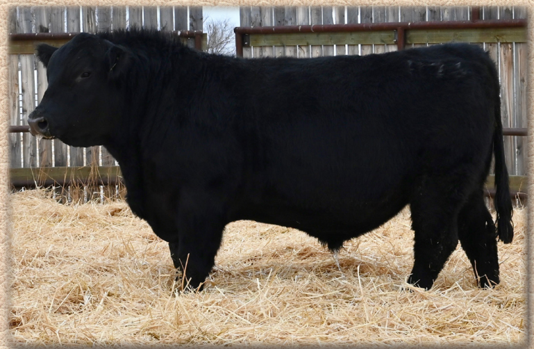
Lot 61- BEAR CREEK JACKSON 117J

Here's a big performance Jackson son. His mother was one of the heaviest yearlings heifers we've ever raised and has been doing a good job raising her calves. His grandmother 21W was a perfect footed and uddered cow who was here until old age. Combining her with Lucky Sevens and Jackson, there's a lot of longevity in this bull's pedigree.