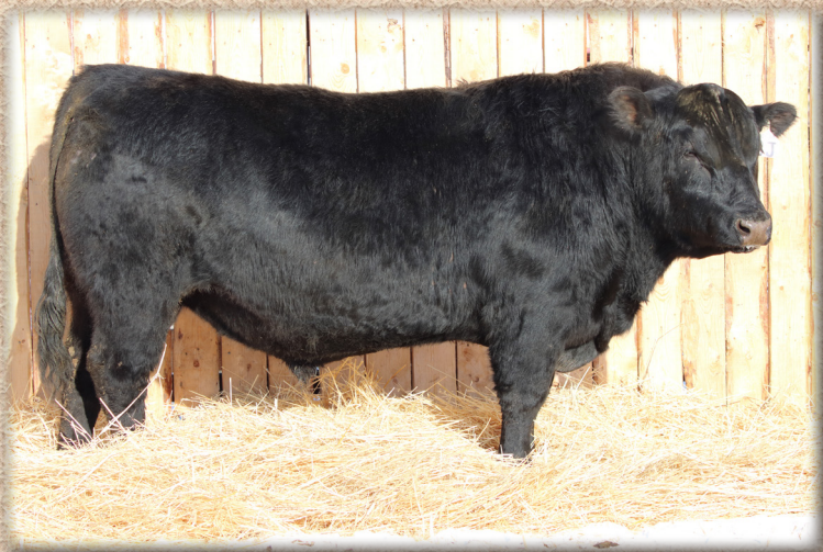
Lot 33 - FR ATTRACTIVE 3J

Attractive is a calving ease sire we purchased in 2020 to use primarily on heifers. He is a combination of length, thickness, and style. His offspring have moderate birthweights and very good growth. His progeny stand up on good feet and stand out in the bull pen. He is a bull with an impressive EPD package including being in the top 1% for milk.