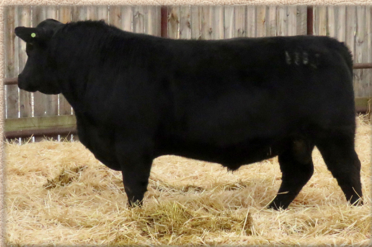
Lot 75 - BEAR CREEK JACK 111J

A nice balanced bull. 111B has done a very good job, as do most 26T daughters. Maternal brothers have went to Colin Greenwald, 76 Grazing Co-op, and Triple L Ranches