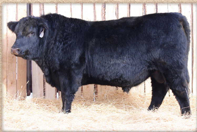
Lot 42 - FR HI DEFINITION 38J

Wide spring of rib, long straight backline, and outstanding confirmation. He is evenly proportioned with a good temperament and strong growth performance. His dam is a nicely uddered, heavy milking Ambush daughter.