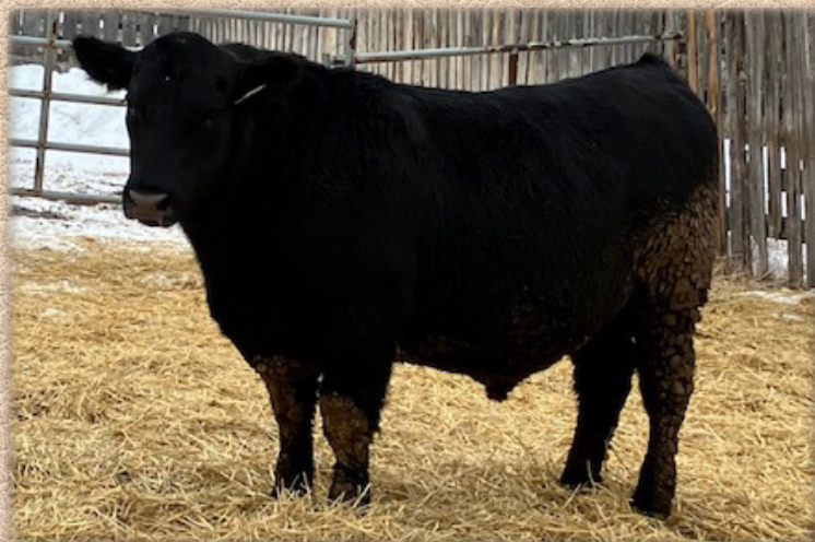
Lot 17 - CRAIG'S DENVER 67J