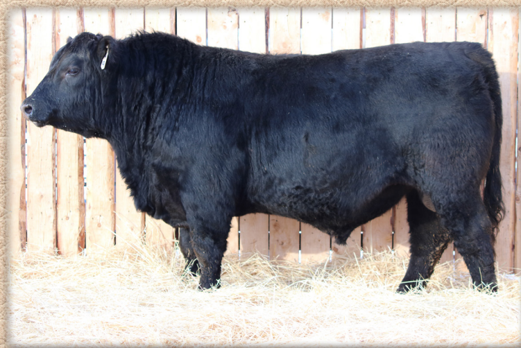
Lot 31 - MOMENTUM 99J

A standout Momentum son. Stylish Angus head, straight backed, deep sided, and big hiped. He stands upon correct, solid feet. His dam and granddam produce top end calves every year.