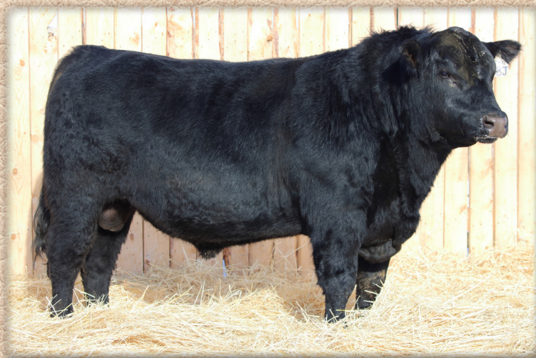
Lot 34 - FR ATTRACTIVE 18J

Thick-topped and deep-sided with muscle definition. His dam is a well-built Complete daughter from a line of solid producers.