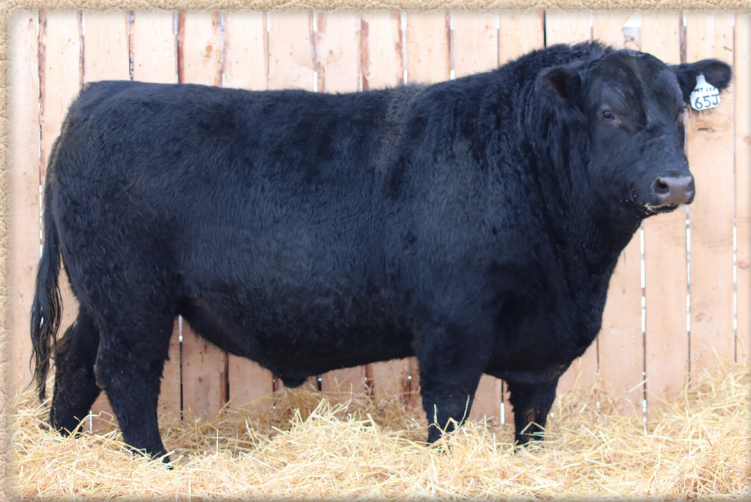
Lot 29 - FR MOMENTUM 65J

Here is a bull with a whole lot of mass and substance from every angle. Thick across the top, deep flanked, and big hiped with lots of muscle expression. His dam is a beautiful Knockout daughter that just keeps raising the good ones.