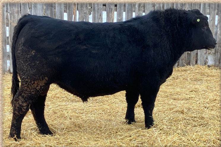
Lot 16 - JC CRAIG'S DENVER 48J