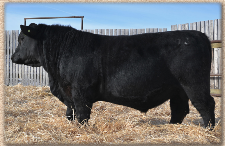
Lot 71- BEAR CREEK JACK 7J

One of my favourite 88f son's, this bull's mother is what I wish every black angus cow was like. Her shape, udder and foot quality is tremendous.