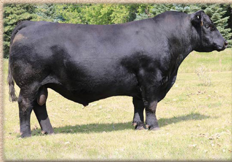
SIRE- MC CUMBER TRIBUTE 702

We A.I.'d some heifers to Tribute, and they calved phenomenally well. He was a main service sire at MC Cumber Angus, whose popularity rapidly grew and semen became short in supply. We will have our first daughters from him calving this year.