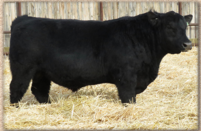
LOT 59 - BEAR CREEK JACKSON 88J