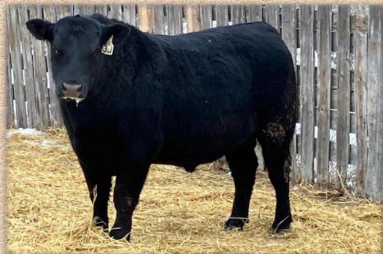
Lot 22 - JC CRAIG'S FORTITUDE 3J