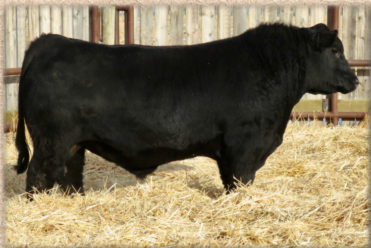
Lot 50 - BEAR CREEK JACKSON 79J