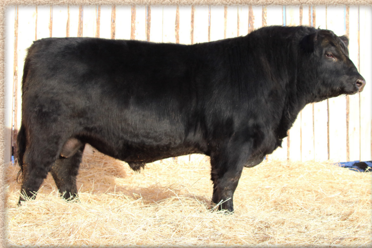
Lot 36 - FR ATTRACTIVE 27J

Good hair, leg structure, wide across the top, and a square hip. The longest framed bull of the Attractive group.