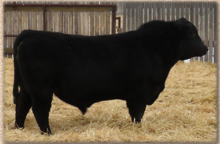
LOT 60 - BEAR CREEK JACKSON 112J

Herdsire prospect. This is another deep bodied Jackson bull in the model of 33J, 37J, and 93J. He's moderate, but packed with meat. His mother is an excellent producing 26T daughter, who comes from a line bred lavender lady cow. If you study this bull closely you will appreciate him more and more.