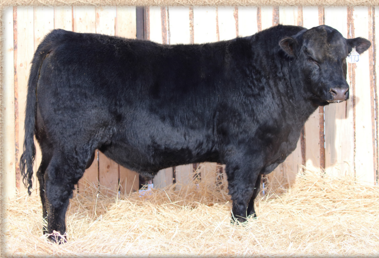
Lot 48 - FR HI DEFINITION 97J

Long spined and wide with a good temperament. Big boned with a nice head and great hair from a broody Frontier cow with abundant milk.