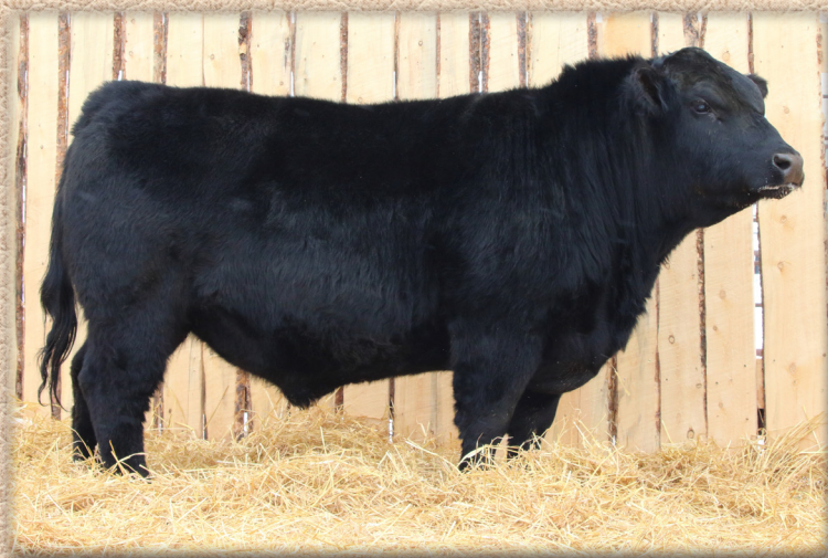
LOT 45 - HI DEFINITION 79J

Big hip, long frame, and large capacity with a good foot angle and claw set. He has that Hi Definition stamp. His dam is a moderate framed, nicely uddered Complete daughter.