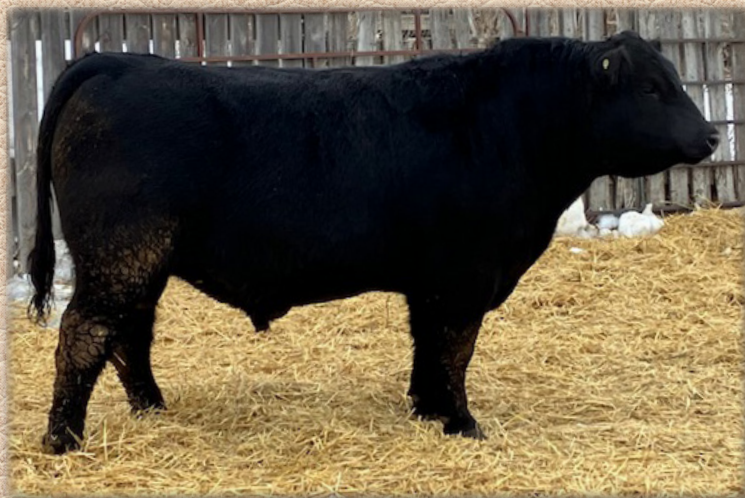
Lot 1 - JC CRAIG'S RESOURCE 8J