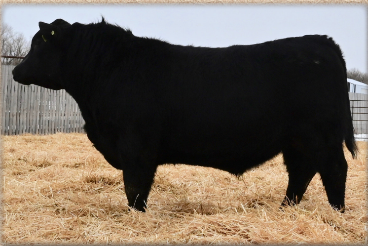
Lot 69 - BEAR CREEK JOE 25J

Reflection was a muscular, excellent breeding bull. He covered his cows extremely effectively, usually having the lowest dry rates in his field. He produced some extremely good daughters that really raise whopping calves.