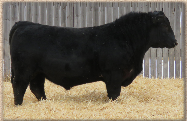
Lot 54 - BEAR CREEK JACKSON 93J

Another tanky, easy doing Jackson. He's a full brother to the mother of our high selling bull last year to Bone Creek Angus. So the proof is there in his production when not only his mother but his full sister is a great producing cow that we displayed on the Sask. Angus Tour last year. This is a very complete bull.