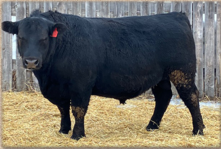
Lot 18 - SARAH'S DENVER 3J