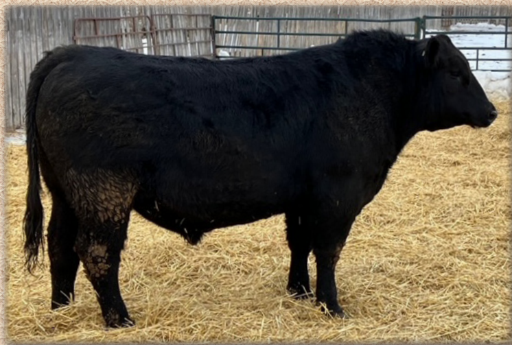
Lot 14 - JC CRAIG'S DENVER 39J