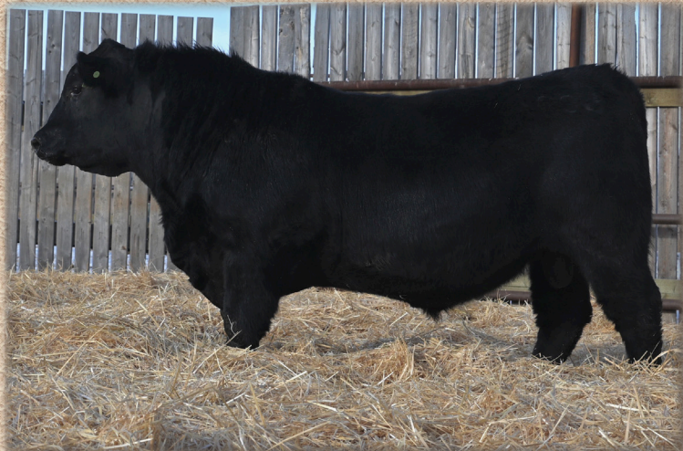
Lot 51 - BEAR CREEK JACKSON 100J