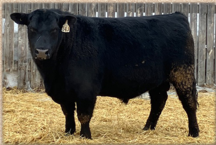
Lot 13 - JC CRAIG'S DENVER 34J