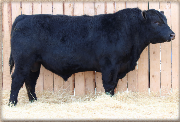
Lot 32 - FR MOMENTUM 103J