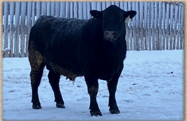
Lot 24 - JC CRAIG'S FORTITUDE 32J