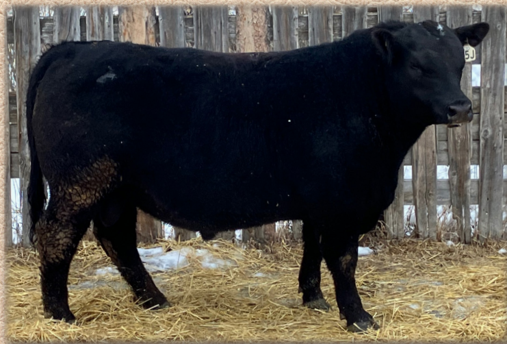
Lot 11 - JC CRAIG'S DENVER 25J