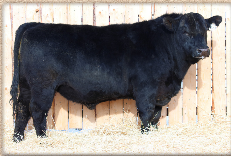
Lot 40 - FR HI DEFINITION 33J

Here is a moderate framed Hi-Definition bull. Quiet temperament, stylish Angus head on structurally correct feet and legs. His King dam consistently bred back and produced easy keepers .