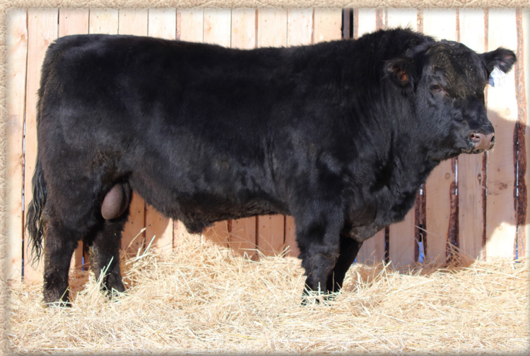
Lot 44 - FR HI DEFINITION 73J

Another Hi Definition bull with length, natural thickness, correct leg and foot structure, and good hair.