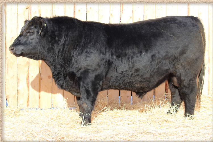
LOT 27 - FR MOMENTUM 31J

Attractive look, smooth shoulder, and a square hip. A strong Momentum son that checks a lot of boxes. His dam and grand dam have been consistent producers.