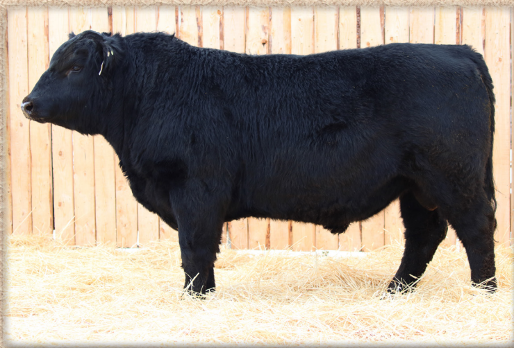
Lot 47 - FR HI DEFINITION 90J