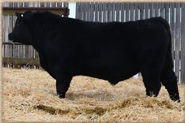
LOT 74 - BEAR CREEK JACK 116J

If you search through you will find several bulls from the Lavender Lady cows, along with 116J. 116C is a very nice pacesetter cow, and you will notice quite a few pacesetter cows have bulls in the sale, a testament to their production capabilities. This bull's grandmother 83A has a bull in the sale. There's a lot of genetic potential within this bull.