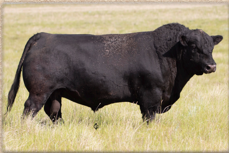
SIRE - EASTONDALE JACKSON 63'15

Jackson is impressive. Starting with large, good feet, legs with a little extra bone to them and natural thickness with a masculine angus head. His bulls are sure to please, they check all the boxes, but even more so do his heifers; they are incredibly consistent with a stamp to them. We've calved a couple crops of heifers and they're becoming some of our strongest cows. Aside from that, he's an outcross pedigree that does not sacrifice quality in any shape or form. Jackson is gone now from an injury, but we are using a son and will his impact on our herd for many years to come.