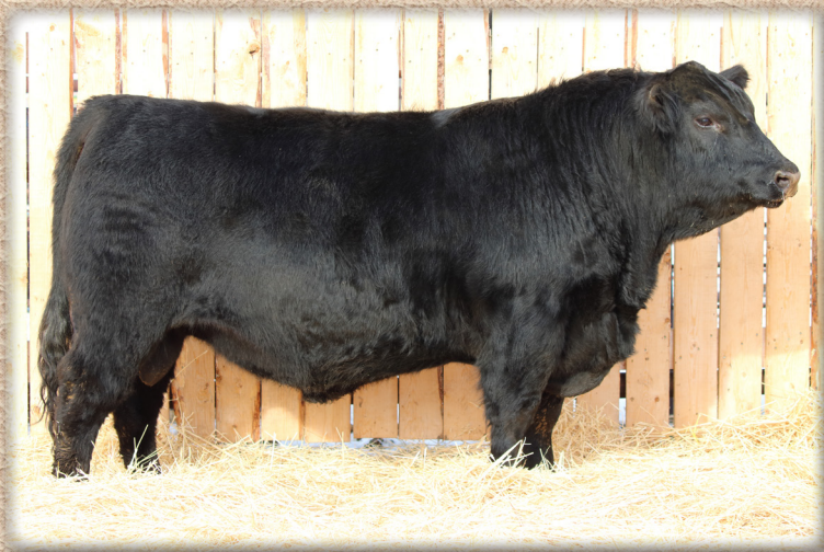
Lot 37 - FR ATTRACTIVE 40J

This Attractive bull will get your attention sale day. A sale feature, soggy, quiet, and appealing. Smooth shouldered, thick topped, and big hipped. His dam has become a young favourite around here; correct footed, level uddered, and fertile. This bull has been a standout since birth.