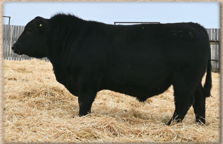
LOT 53 - BEAR CREEK JACKSON 37J

I've always really liked this bull, as a calf he stood right alongside the older calves. He's probably the thickest bull in the offering, while maintaining length and attractiveness. While he's not related to our old Stoney Creek bull he reminds me of him with his shape of rib and extra muscle popping out. His mother is a very good cow we purchased from Crescent Creek Angus years ago. He has a full sister working in the herd and she's very good.