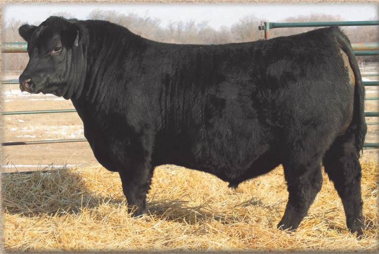
SIRE- PEAK DOT ATTRACTIVE 193G

Structurally correct and lengthy with an agreeable temperament. He has a classic Momentum head and frame. As the youngest bull in our group has been keeping pace with his growth. His dam in balanced and feminine.