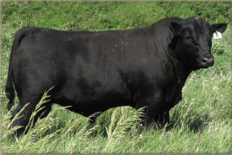
SIRE - EASTONDALE REFLECTION 57'17