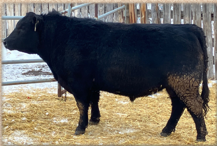
Lot 19 - JC CRAIG'S AVIATOR 9J