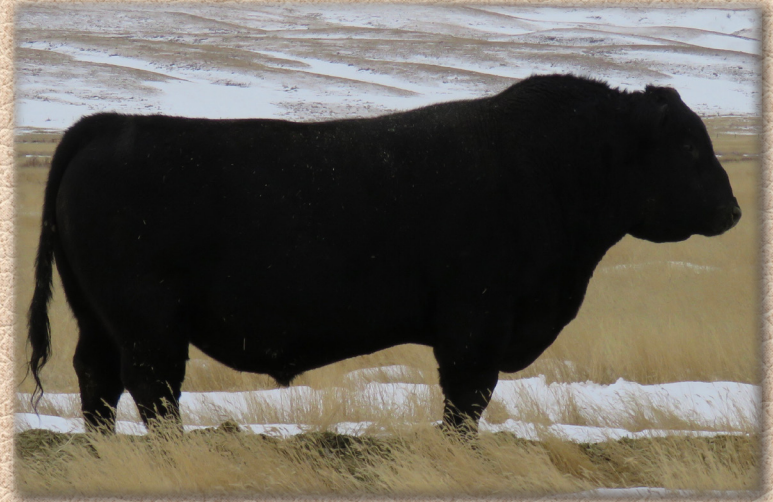
SIRE - BEAR CREEK JACK 88F

We retained this bull for our own use and we haven't been disappointed, his calves are phenomenal. He posted some the best weight gains we've had within our program. He's a long, hard-muscled bull that travels like a cat with a great foot on him.