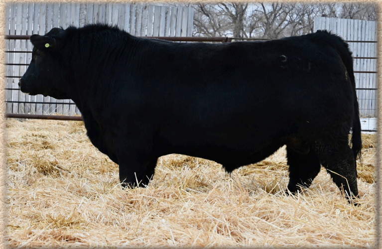
LOT 52 - BEAR CREEK JACKSON 33J

Here's a great bull that's hard to fault, he's one of our favorite bulls in the pen with a big rump, big top, and an extremely attractive character. His mother is an excellent Lucky Sevens cow. Check this guy out for your herdsire prospects.