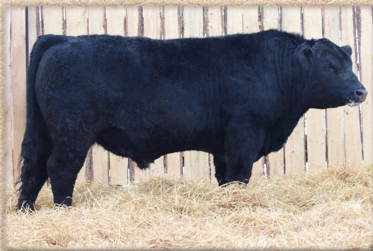
Lot 38 - FR HI DEFINITION 11J

Thick-framed, large capacity. A quiet bull to work with. He is at the top end of the breed for weaning weight and yearling weight EPDs. A large Frontier dam with a long line of outstanding progeny.