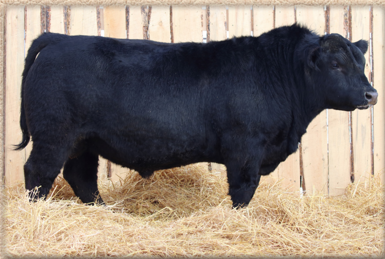
LOT 39 - FR HI DEFINITION 32J

He really catches your eye. Thick-topped, square-hipped, and stylish. A very balance EPD profile. Hi-Definition crossed very successfully on the Complete females.