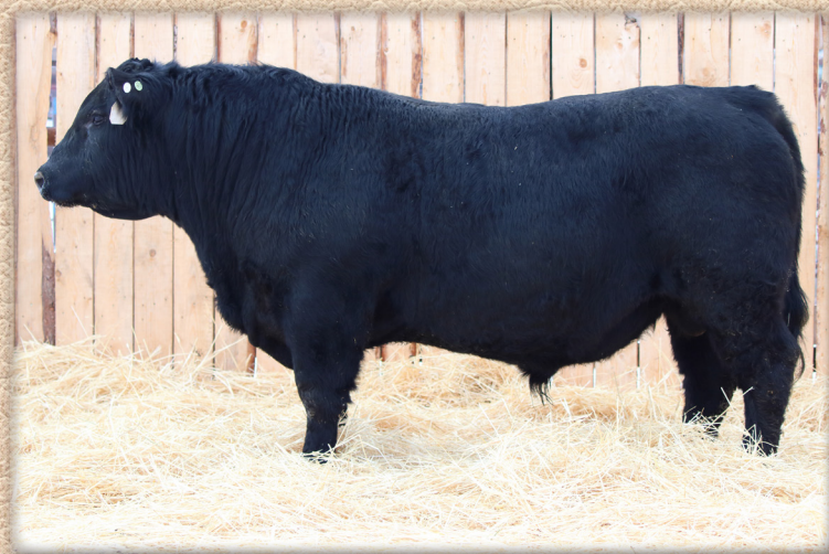
Lot 35 - FR ATTRACTIVE 20J

A moderately framed bull with a lighter birthweight. The heifer friendly type.