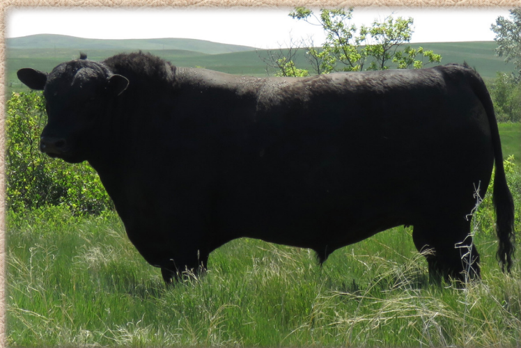
SIRE - EASTONDALE 6A WINDY 03'15

Windy is an impressive herd bull. He moves like a cat, is long, full of meat, and has successfully bred our heifers for years, but with too many daughters in the replacement pen, bumped him to cows for his last year. Windy did very well for us, always covering his field and remaining sound. There's a lot of good from his sons and daughters. Two years ago, we retained a windy son to continue his excellent genetic profile within our own herd and thus offer this last son from him.