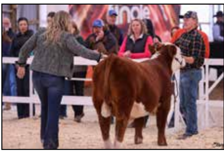
Fall Finale Supreme Champion Bull!!!

UPS SENSATION 2296 ET S: H DEBERARD 7454 ET RST GAT NST Y79D LADY 54B ET R LEADER 6964 D: ELM-LODGE FLIRTIN 42F GG 743 PERFECT TIMING 105Y 19 JANUARY 2022 C03092785 TAX 11K Horned