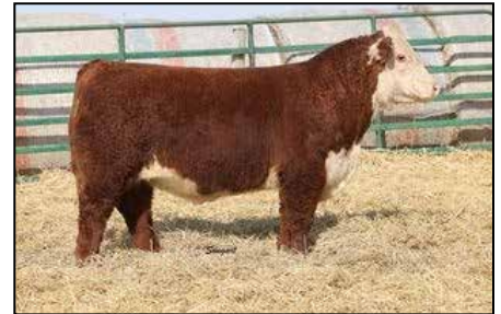
SERVICE SIRE - THE STANDARD

NJW 73S W18 HOMETOWN 10Y ET 20/03/2020 S: ELM-LODGE CHECKMATE 21C C03071452 GLENVIEW 6056 MARVEL X2 ET TAX 46H GHC PREMIER 155K POLLED D: LIAN 155K JUNE ET 118T HAROLDSON'S COLBI 2Z 59J