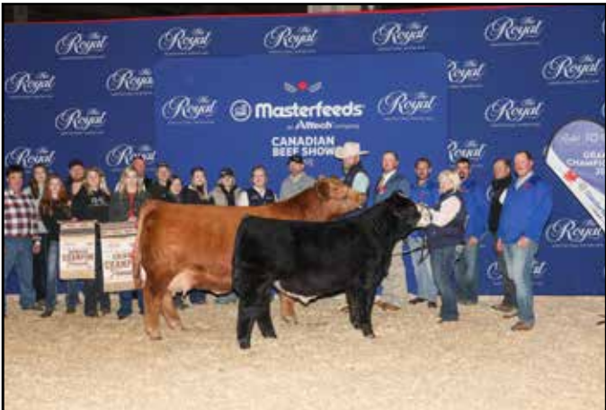
NATIONAL CHAMPION WITH DAM