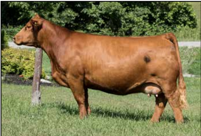
GRAND DAM DARLIN - "THE COW OF THE BREED"