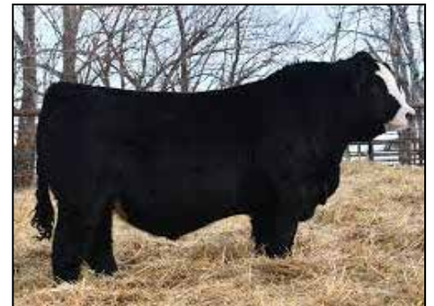
RF NO LIMITS 1112J