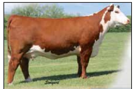
SERVICE SIRE'S GRAND DAM

ANL C 420A MOUNTAINEER 45 134C 20/03/2021 S: FBF 134C GEORGE FOREMAN 95G C03090882 FBF 49T LANA 14Y RGSF 63J FBF 79A CHURCHILL 27C POLLED D: RAWCLIFFE 27C SALLY 62F FBFM 5Y HILLARY 62D