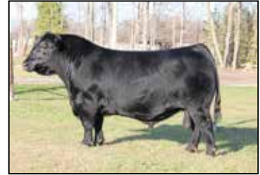
Bar E L Royal Reserve