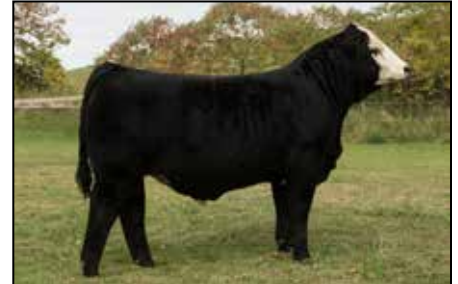
FAMOUS BROTHER - KING GEORGE