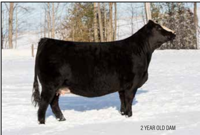
2 YEAR OLD DAM