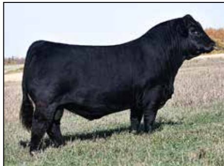
RF CALIBER 014G