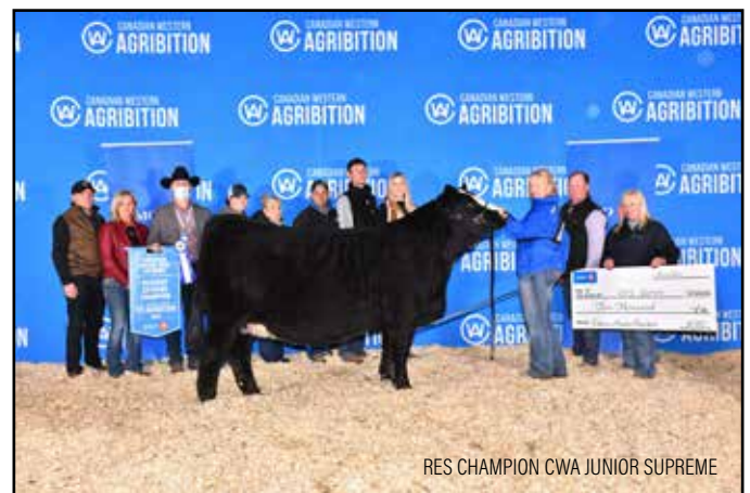
RES CHAMPION CWA JUNIOR SUPREME