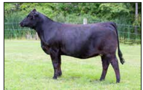
SISTER SOLD TO MAPLE ELM SIMMENTALS