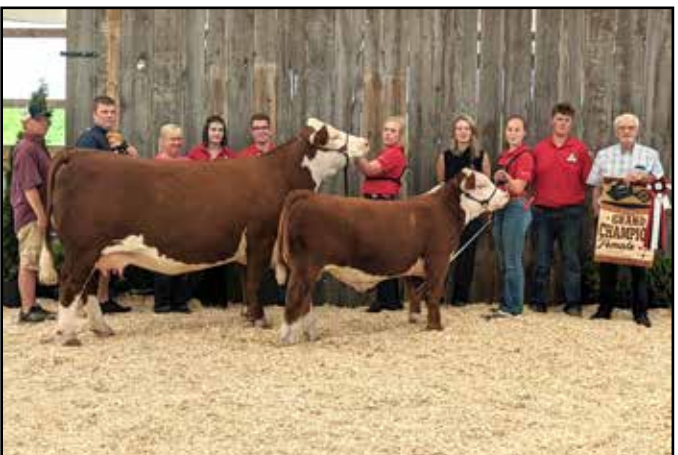
Bonanza Champion Female with Kickstart on side.