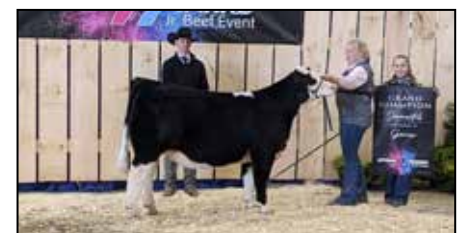
SOLD LAST YEAR - SISTER