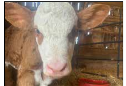
GOGGLED EYED BEAUTY SELLS WITH MAMA