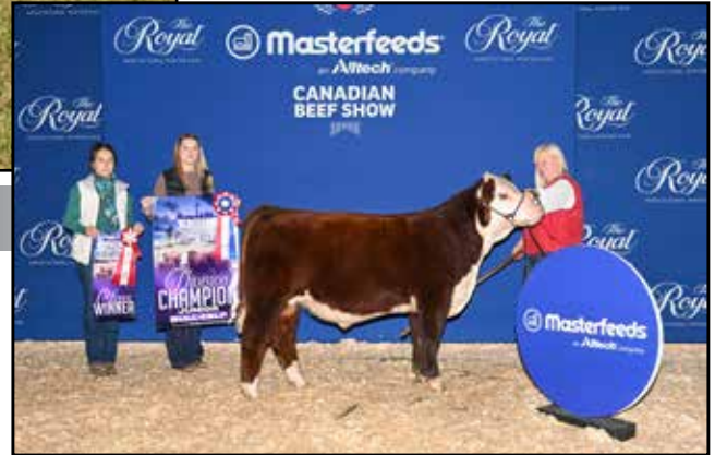
Jr Bull Calf Champion 2022 Royal National Show

Lot 43K ELM-LODGE KINGDOM 43K CRR 719 CATAPULT 109 S: ELM-LODGE ENGINEER 31E ELM-LODGE NECKLACE ET 31Y STAR MARKET INDEX 70X ET D: SQUARE-D INVESTOR GAL 2712Z SQUARE-D MAID 712X