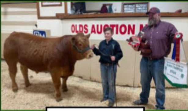
Thett Dorin Purchased By: Tebb Farms Ltd