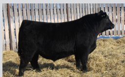
MATERNAL BROTHER HIGH SELLING BULL 2019 SOLD TO CMT FARMS

He is without doubt a sale feature! This cow puts one at the very front of the pen every single year. She has raised high selling sons and daughters that have become donor cows, she is the center of our program and rivaled only by her own daughter, the IZ cow. It seems as though each year our feature bull is a son of either 31X or IZ. This year is no exception to that. 47H is in his own league in terms of breed character, presence, and mass. He is stout, soft middled, with a big hip and a herd bull look. He excels on paper and in flesh, with above average performance, an 800lb weaning weight and top 15% calving ease. His milk EPD is in the top 10% of the breed and that comes with no surprise considering the cow family he stems from.