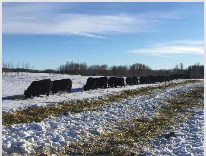
Swath grazing winter of 2020/2021.

If you have any concern at all about turning a yearling out with your cows, here is a larger framed Hi Definition son, out of a big broody Prowler daughter. He was the highest indexing bull for yearling gain, and has performed exceptionally well on feed. Regardless whether you sell your calves in the fall or feed them, length of body and a steep growth curve will make your endeavour more profitable.