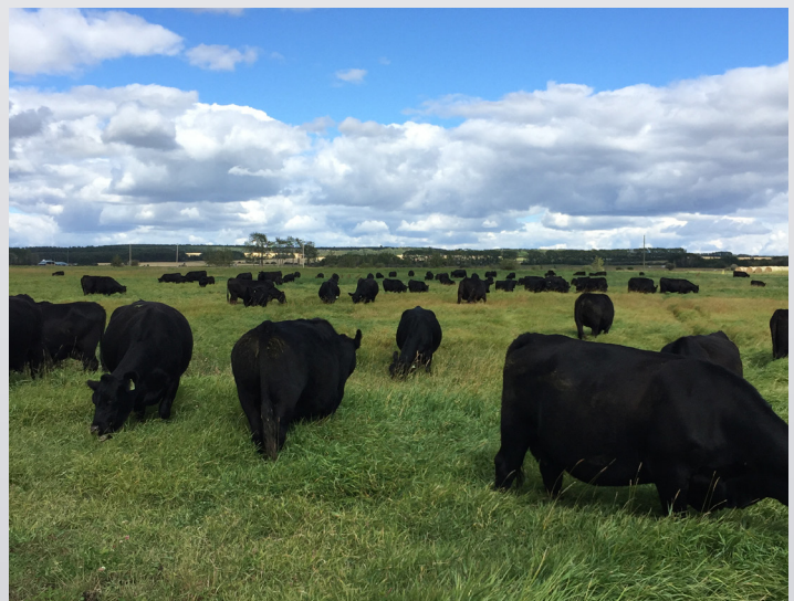
We were blessed with a wonderful growing season in 2020.

Calving ease and maternal traits show up many places in this calf's pedigree, with Pioneer, Unanimous, and Tradeup. All three of those individuals have seen use in our heifer pen over the years, combined with an 80lb birthweight, leads us to believe that he should work on heifers himself. He weaned off of a first calver at over 700lbs, however in December he was under the weather for about a week before making a full recovery and that certainly shows in his yearling gain and performance, none the less he will be ready to see service by turnout time.