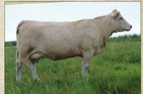
Tri-N Reba 561C - Dam Lot 1