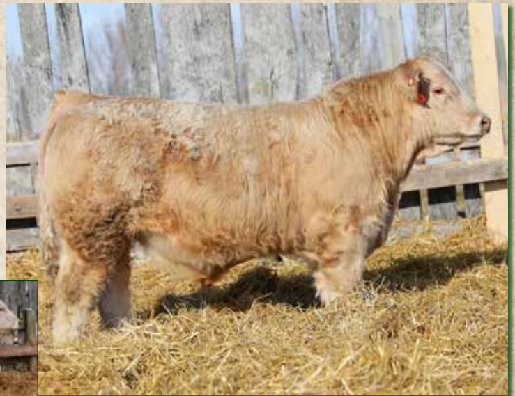
Maternal Brother NMF 834F