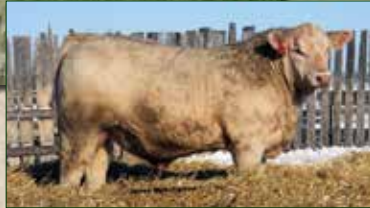
Sire: TRI-N THRILLER PLD 173Z

We lost Thriller so this will be the last chance to own a son. Watch for his legacy to live on here!