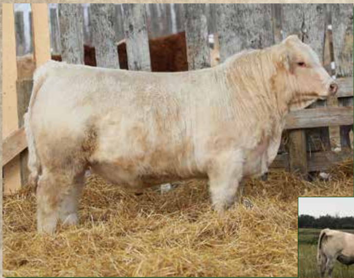
965G and Dam August 2019