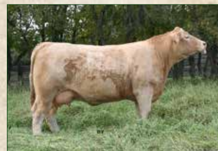
Tri-N Prairie Rosebud 37S - Granddam Lot 30