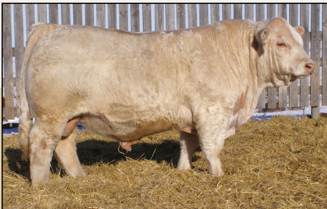
Lot 8 - LAE FREEMONT 818F