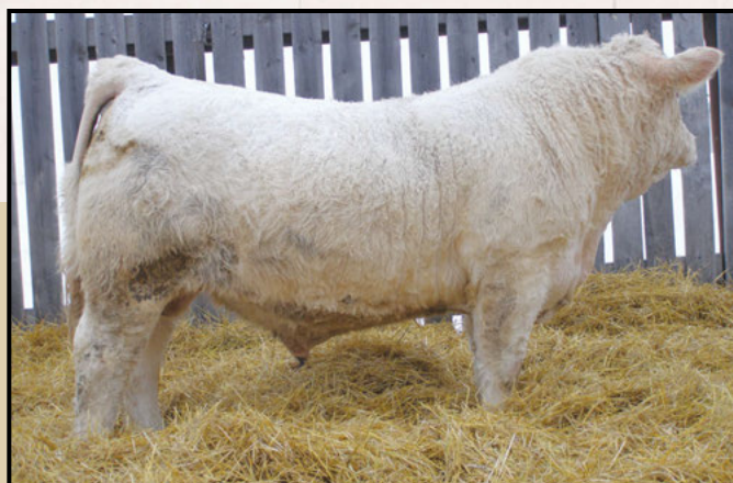
Lot 38 - LAE FIRESTORM 874F