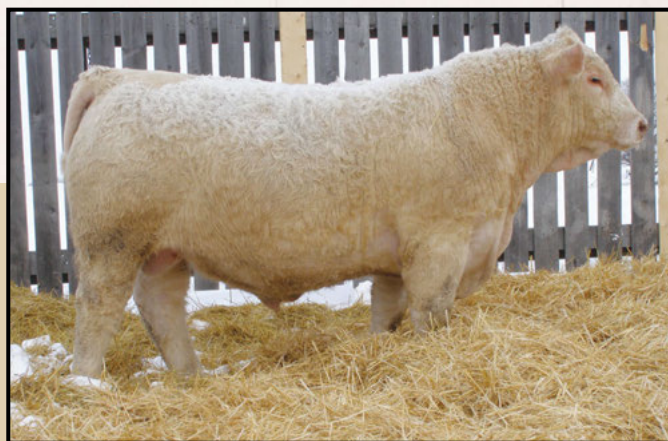
Lot 32 - LAE FLICKER 860F