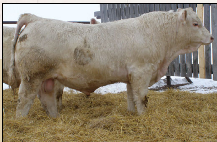
Lot 22 - LAE FELIX 845F