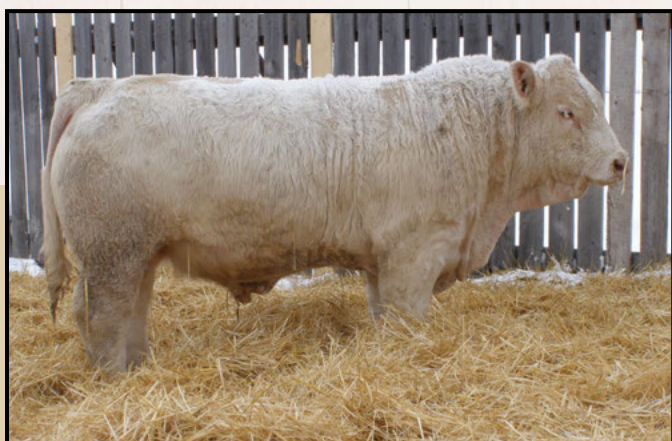
Lot 36 - LAE FAME 869F