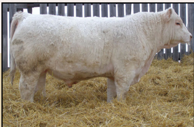
Lot 12 - LAE FEARLESS 828F