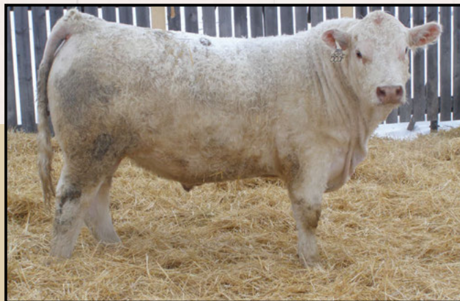
Lot 42 - LAE FAN MAIL 883F