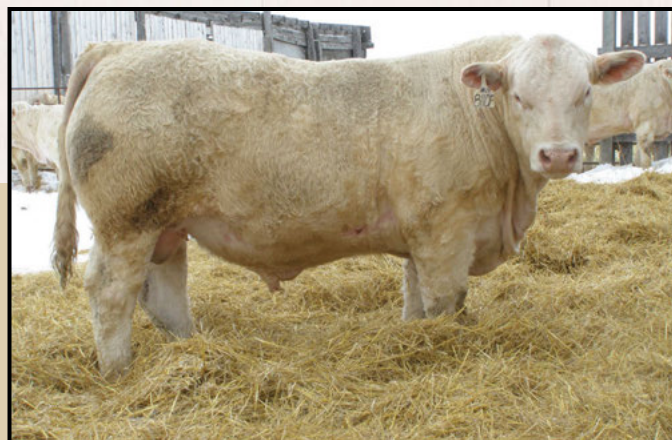
Lot 54 - LAE FINALE 8110F