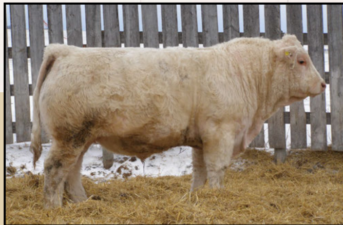
Lot 39 - LAE FLIGHT 876F