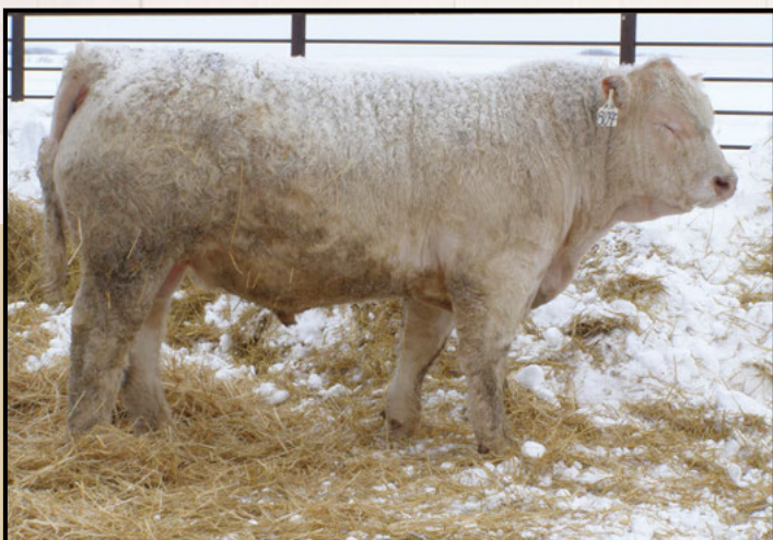
Lot 53 - LAE FLAGSTAFF 8109F