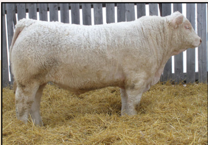
Lot 27 - LAE FRONT PAGE 853F