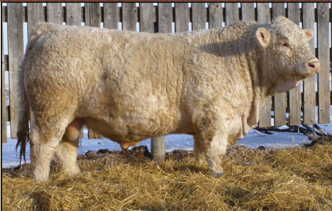
Lot 61 - LAE FIERCE 8145F