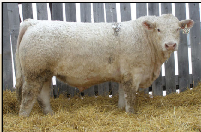
Lot 5 - LAE FIRECRACKER 805F