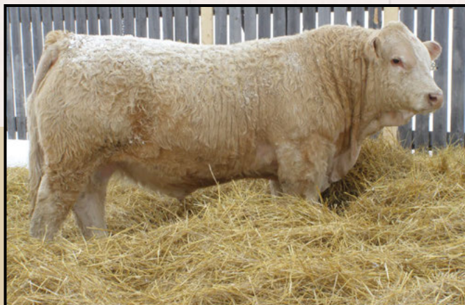
Lot 29 - LAE FLAME 855F