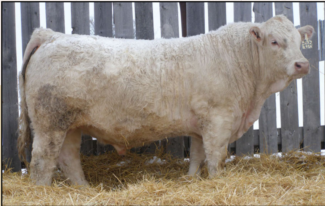
Lot 20 - LAE FANTASY 843F