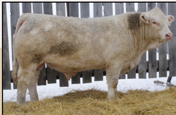
Lot 56 - LAE FEDERATION 8115F