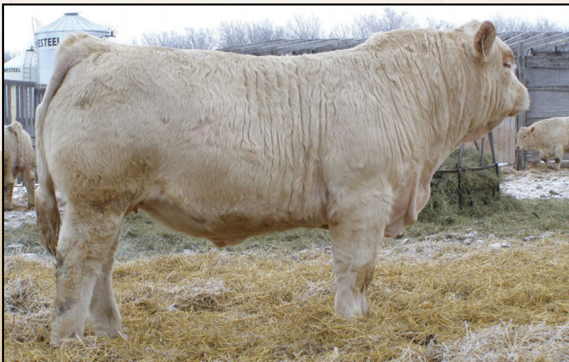
Lot 11 - LAE THE FIRM 824F