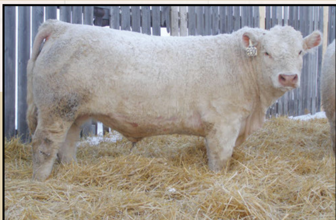
Lot 14 - LAE FEDERAL AGENT 830F