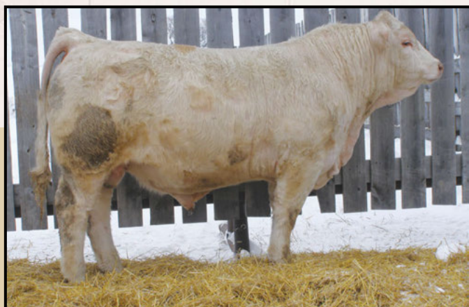
Lot 15 - LAE FLIGHT DECK 832F