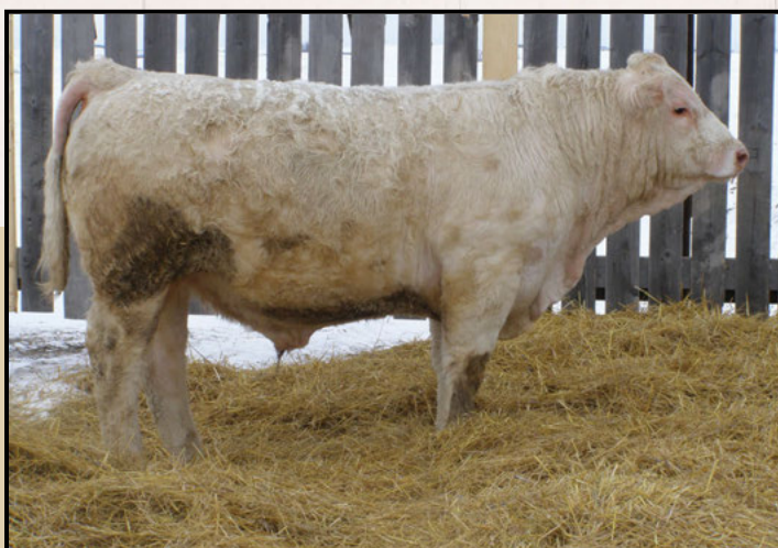
Lot 7 - LAE FAST BREAK 815F