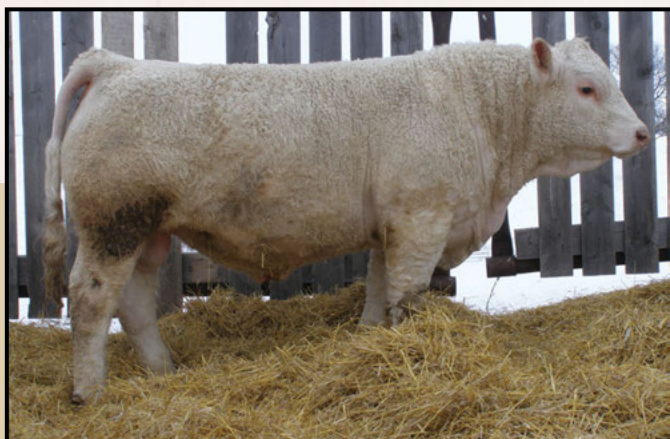
Lot 6 - BNE FORUM 1F