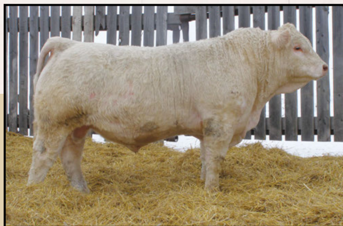
Lot 41 - LAE FLAG 882F