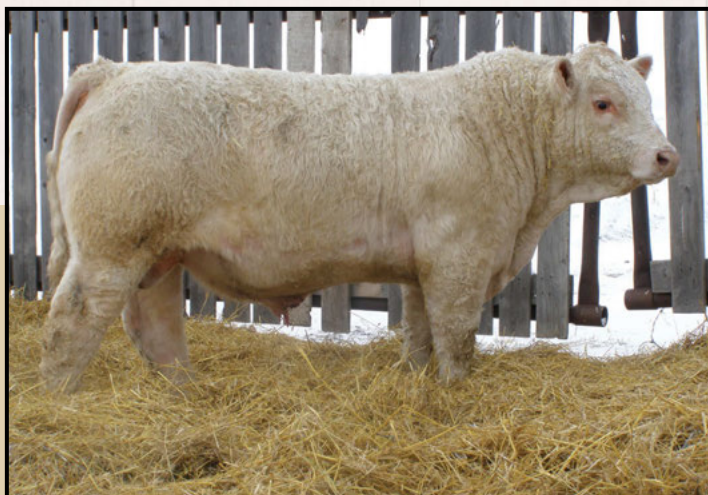
Lot 1 - LAE FIRST CLASS 803F