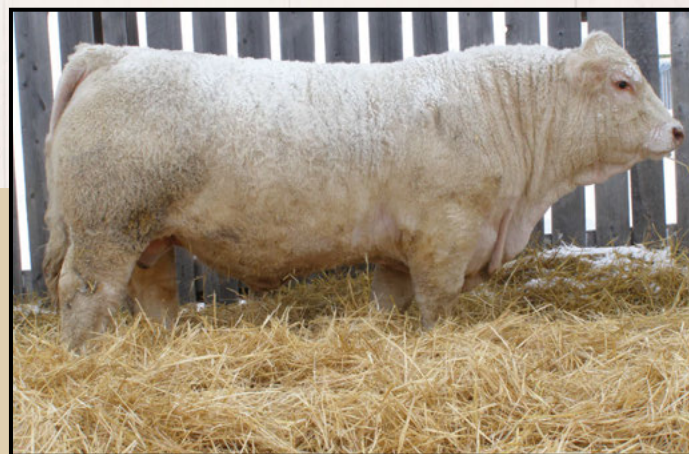
Lot 25 - LAE FORTUNE 850F