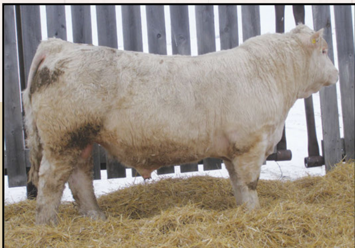
Lot 26 - LAE FORTRESS 852F