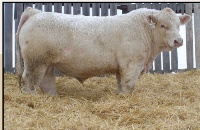
Lot 57 - LAE FIZZ 8119F