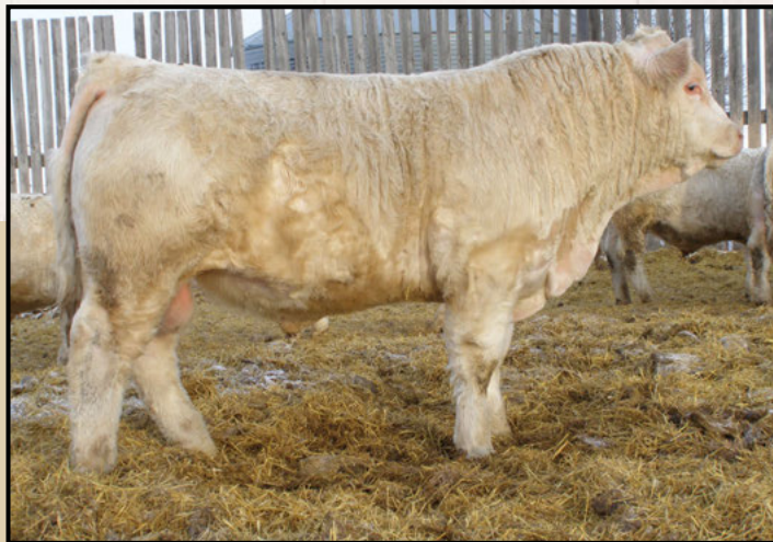
Lot 49 - LAE FRONTRUNNER 896F