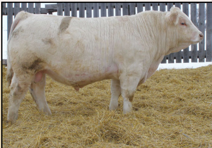
Lot 50 - LAE FAN CLUB 8104F