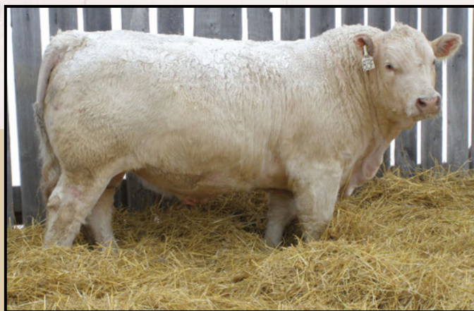
Lot 37 - LAE FLAGSTAFF 873F