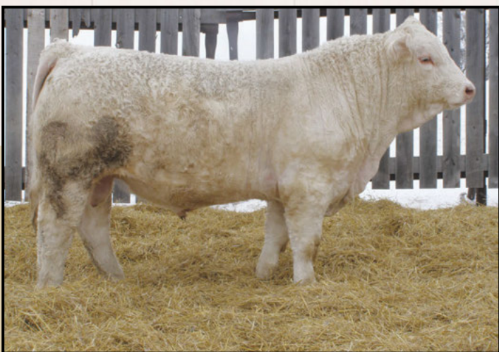
Lot 52 - LAE FIST BUMP 8106F