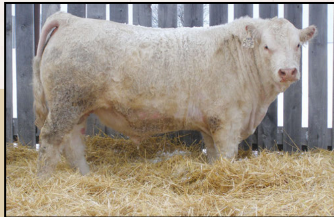
Lot 55 - LAE FACTOR 8113F