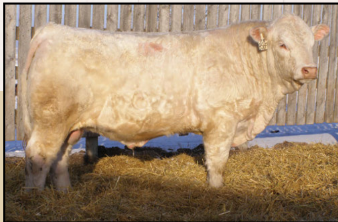
Lot 30 - LAE FU MAN CHU 856F