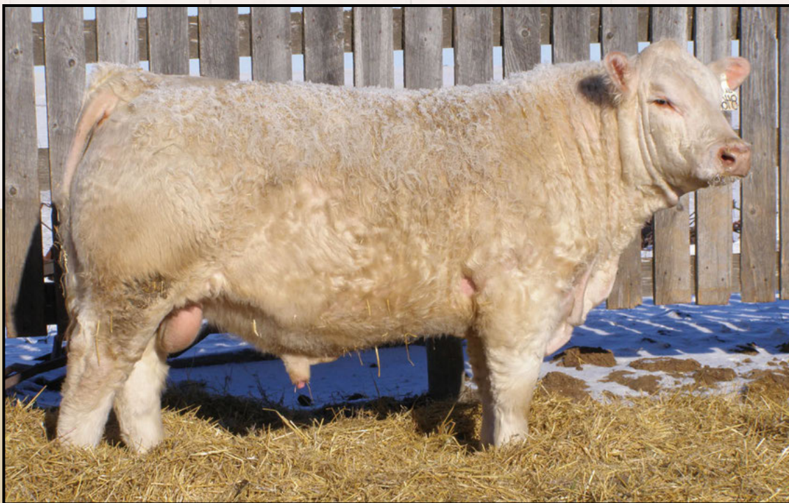
Lot 23 - LAE FEATURE 846F