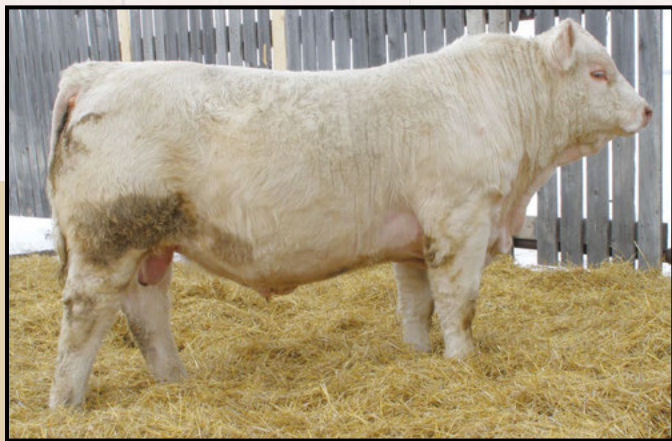
Lot 33 - LAE DESPERADO 862F