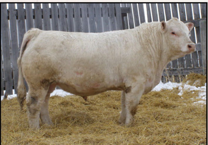
Lot 28 - BNE FIELD GOAL 2F