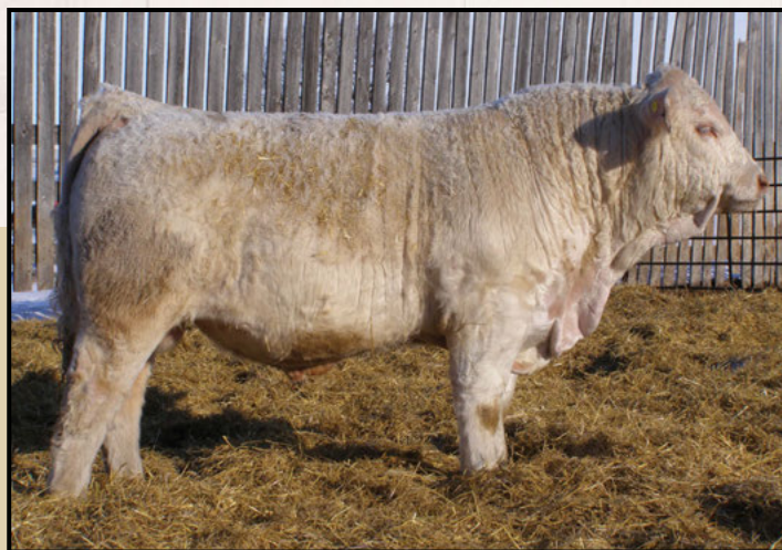
Lot 60 - LAE FASCINATION 8126F