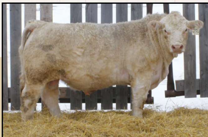
Lot 31 - LAE FACE OFF 859F