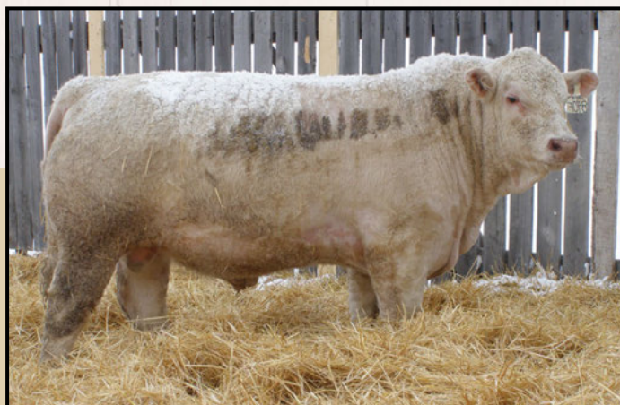
Lot 21 - LAE FAMOSA 840F