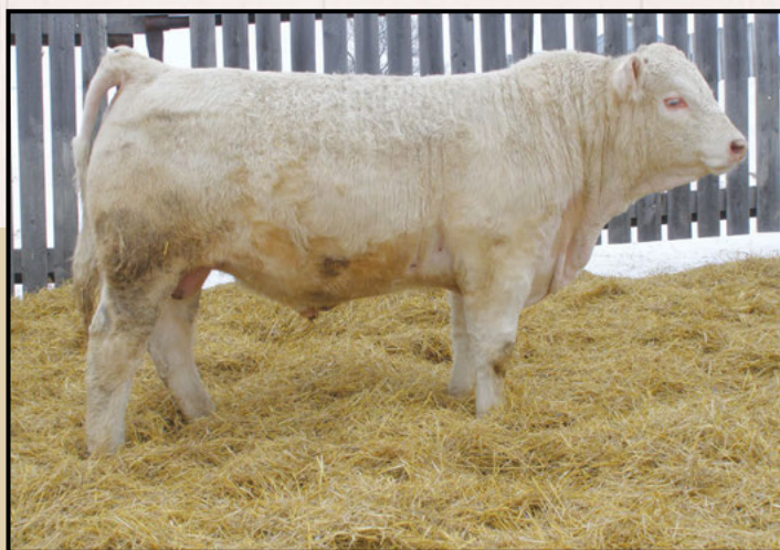
Lot 47 - LAE FAVOUR 890F