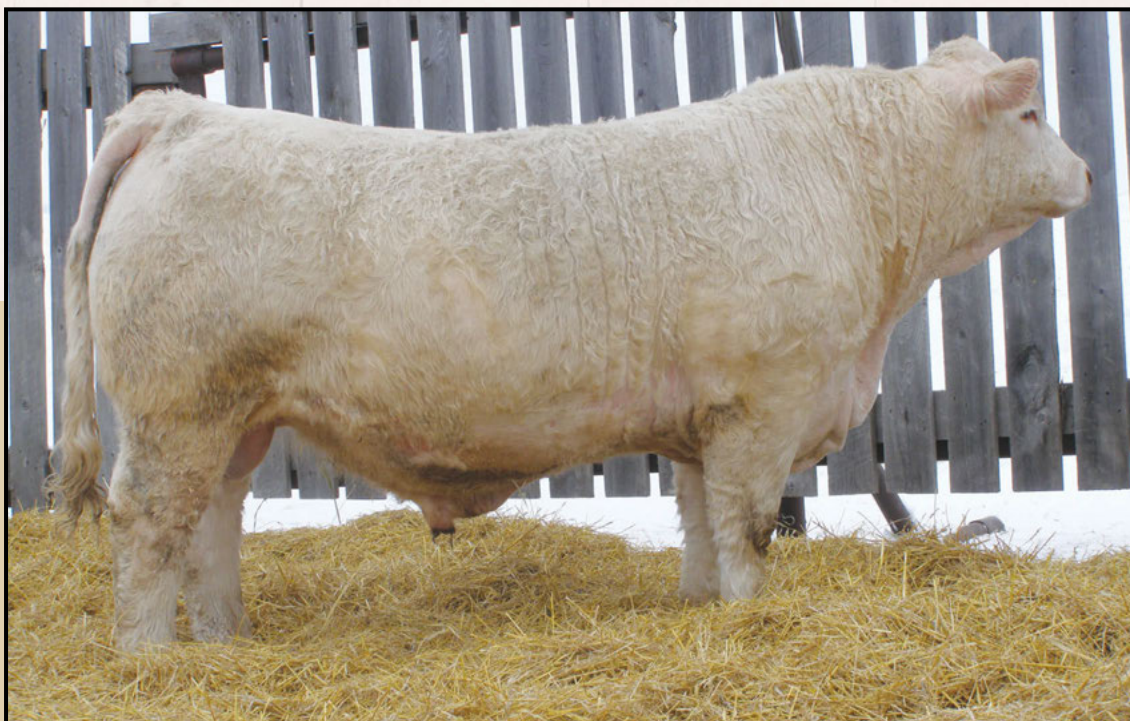
Lot 10 - LAE FLAPJACK 821F