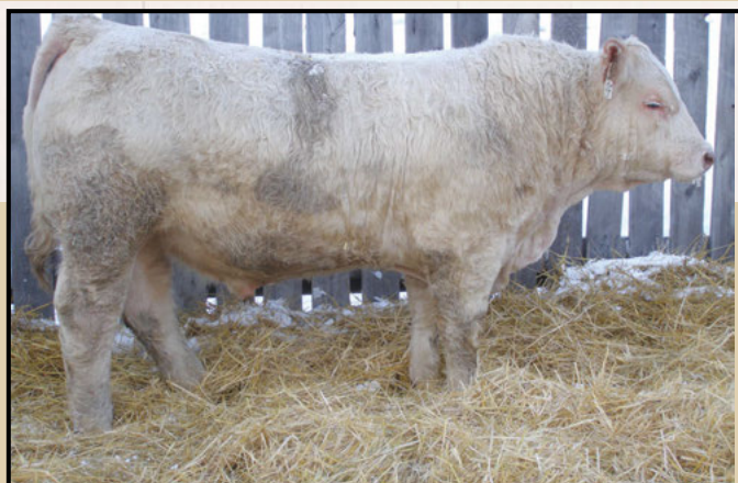
Lot 13 - LAE FACETIME 829F