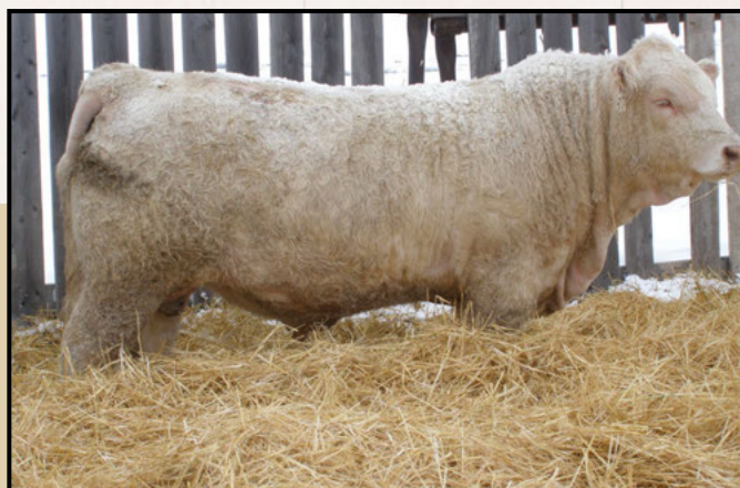
Lot 40 - LAE FIREPOWER 877F