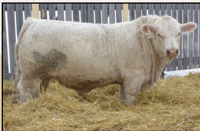
Lot 43 - LAE FIXTURE 885F