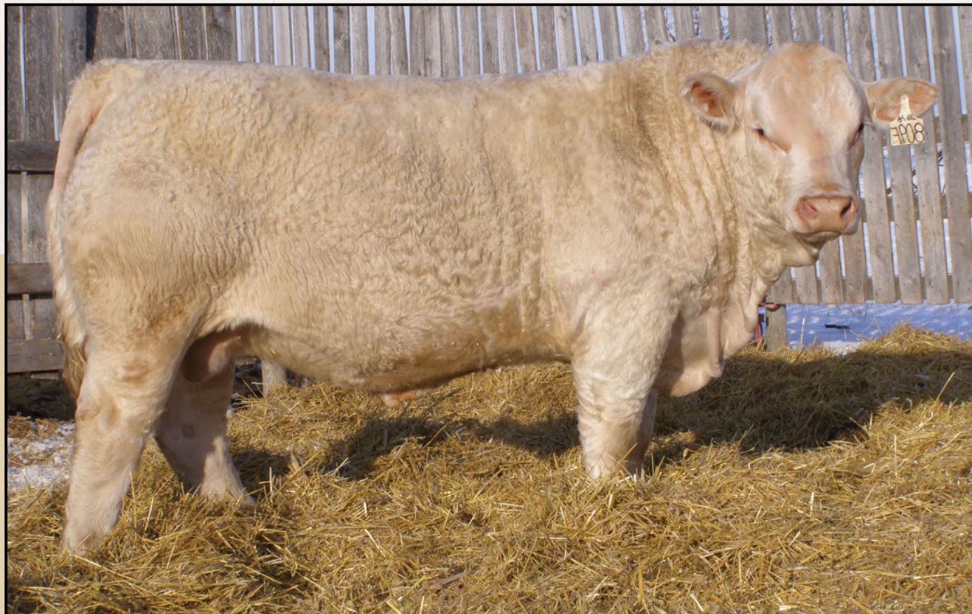
Lot 3 - LAE FRESNO 809F