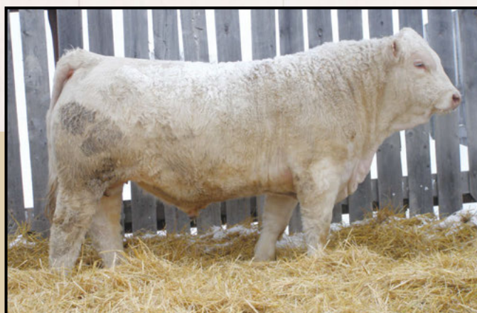
Lot 44 - LAE FAJITA 886F