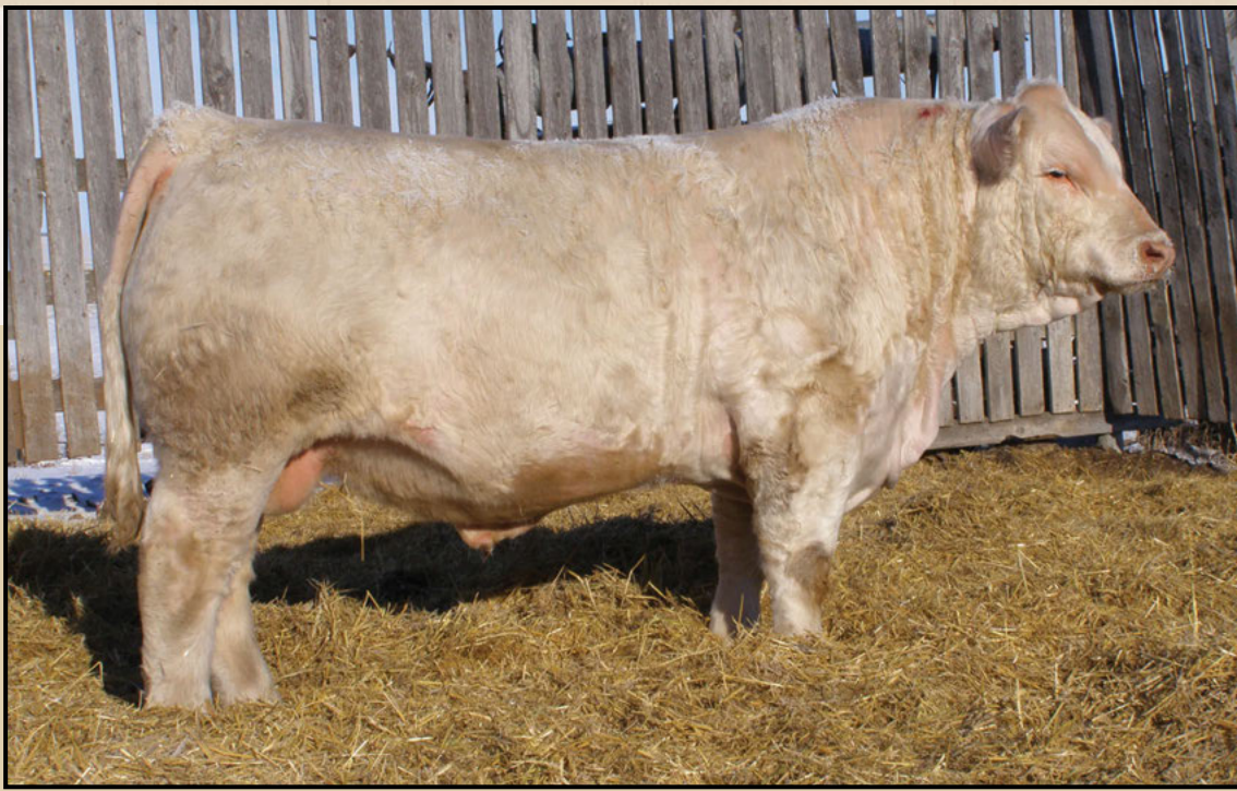
Lot 4 - LAE FORT WORTH 813F