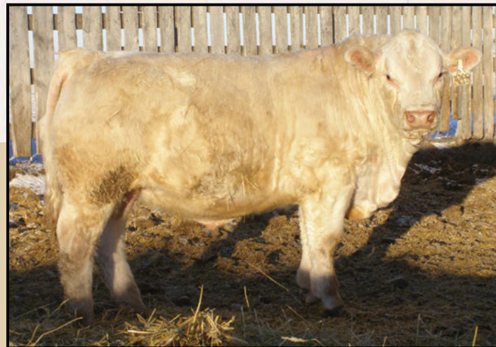
Lot 48 - LAE FIREWORKS 895F