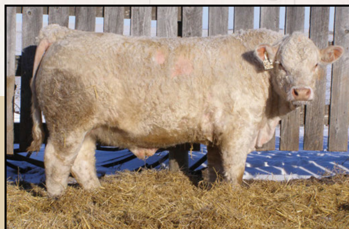
Lot 24 - LAE FREELANCE 847F