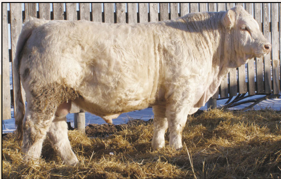
Lot 59 - LAE FRANKFURT 8121F