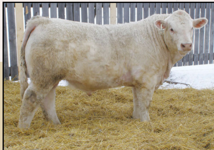
Lot 17 - LAE FASCINATE 839F