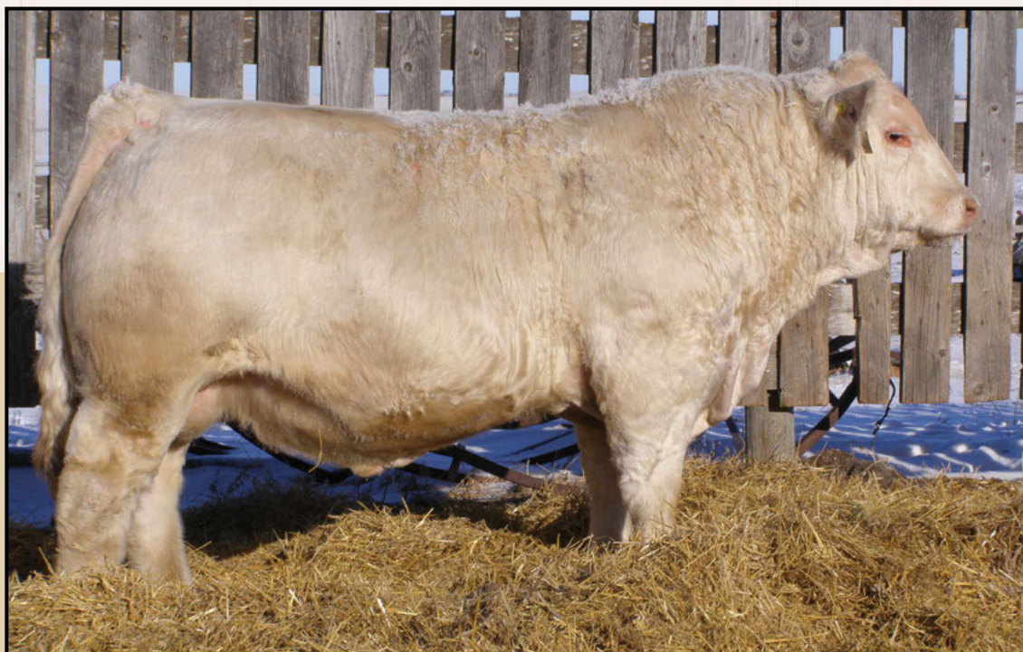
Lot 19 - LAE FRANCHISE 842F