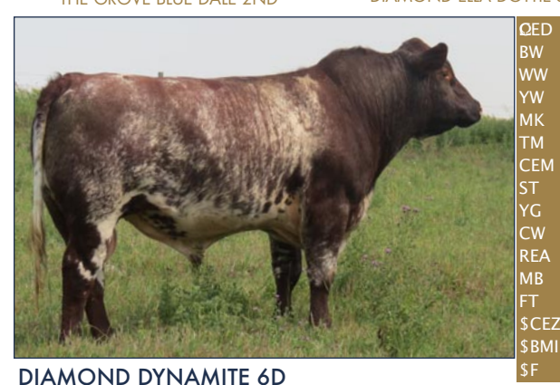
THE GROVE KOOKABURRA W735

DIAMOND LORD BELMORE 56B BUTTERFIELD LADY 13N