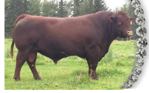
CROOKED POST STOCKMAN 4Z SIRE OF LOT 49

NORTHERN LEGEND 3N DIAMOND MINNIE WILDFLOWER 11W DIAMOND MINNIE KAZIAH 40K