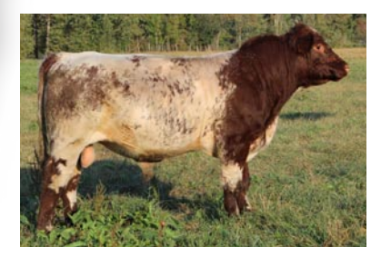
DIAMOND ENTERTAINER 49E - SERVICE SIRE

This roan bred yearling heifer is from the JJ Jenetics Candy cow family. It was a difficult decision to enter her in the sale as she is one of our best, but we still have a number of the family in our herd. She is thick, deep bodied, and easy fleshing. She has a sweet temperament, is halter broke, and is very easy to be around. The Candy family has produced many winners in the show ring over the years, such as Circle M Ghost Rider 10G, Circle M Candy's Sugar Plum 6S, Circle M Candy's Kit Kat 9K, ACC Candy's Winegum 14W, and these winners have gone on to produce many great calves for many years. This cow family is noted for their longevity, easy fleshing, and excellent udders. We know she will be a valuable asset in any herd.