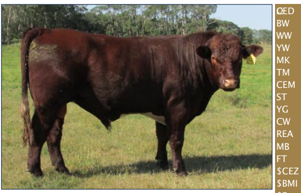
PROSPECT HILL EMBER CANDY 24E

DIAMOND URBAN LEGEND 28U DIAMOND ZEALOUS BARONESS 5Z DIAMOND RAVISHING BARONESS 35R