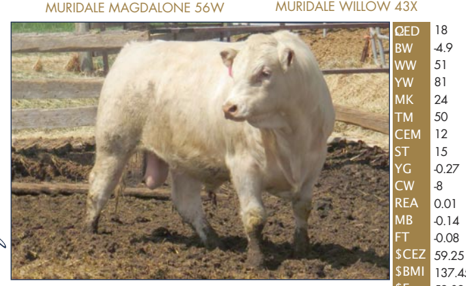
DIAMOND EMPIRE 6E THE GROVE KOOKABURRA W735

DIAMOND LORD BELMORE 56B BUTTERFIELD LADY 13N