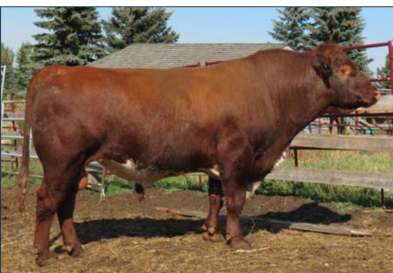
DIAMOND BELVEDERE 29B DEERHORN CRUICKSHANK 946 THE GROVE KOOKABURRA W735 THE GROVE BILLE DAIF 2ND

SASKVALLEY RAMROD 155R SASKVALLEY FLOWER 11Z SASKVALLEY FLOWER 2W