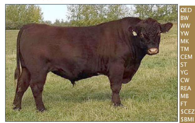
SASKVALLEY BILLIONAIRE 62B

SASKVALLEY TRANSPORT 399T JT TRANS X 28X JT HESTER 34G