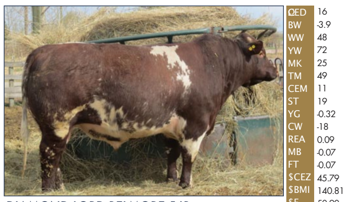
DIAMOND LORD BELMORE 56B DEERHORN CRUICKSHANK 946 THE GROVE KOOKABURRA W735