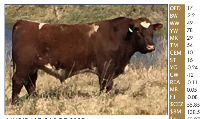
MURIDALE SARGE 319D MURIDALE IRON MAN 4X MURIDALE HULK 7B

MURIDALE JOHNNY 22X MURIDALE WILLOW 96Z MURIDALE WILLOW 43X