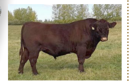
SASKVALLEY BILLIONAIRE 62B

A very well balanced heifer with tons of overall muscling. Elle goes back into our genetics with some of our best lines. Her dam is a very productive cow that milks well and has a great temperament .She has been one of our favorites so has made her way onto the show string. She just keeps impressing us.