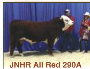
JNHR All Red 290A