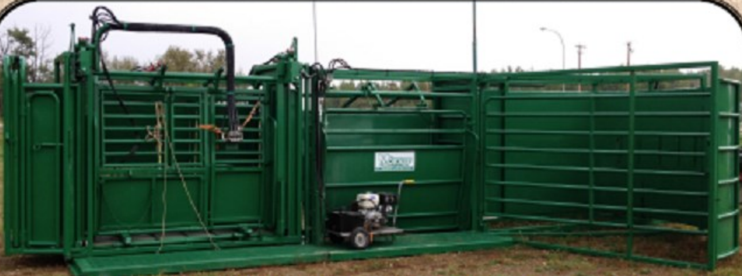
Heavy, Reliable and Built to Your Satisfaction!