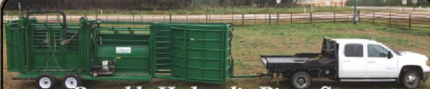
Portable Hydraulic Bison System

Quality Livestock Handling Equipment Built with Your Safety in Mind!