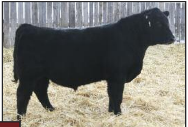
Lot 19 HLC 74U ALLIANCE 392A

A younger bull, but has the making to be a great herd sire. He just needs time to catch up to the big boys, will be great on a small group of heifers!