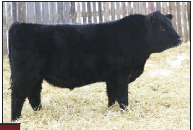
Lot 11 HLC 960W LUTHER 350A

Here is a younger bull I really like, extremely low birth only 65 lbs. But a pedigree to make things happen. Don't overlook this bull on sale day.