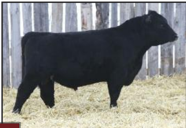
Lot 21 HLC RENOVATOR 232Z

An unregistered April two year old, he will definitely cover some cows.