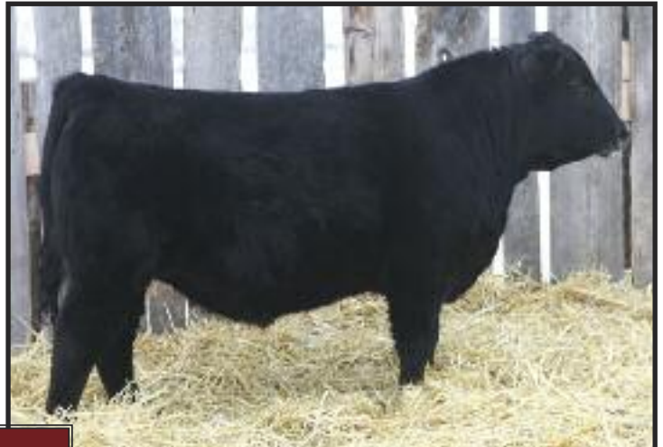
Lot 18 HLC 244Y IMPACT 387A

Only a April 2, but he has it all! The right type and make to get the job done. Will work great on heifers.