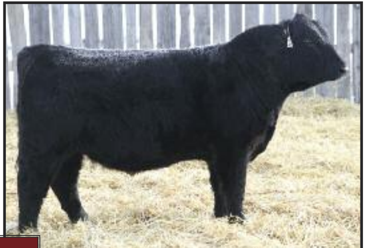
Lot 14 HLC 1220 WARDEN 358A

Check out this Warden son! Out of a great Justamere bred female that is maternal sister to the $31,000.00 Justamere Lacy 397Z that sold to Graden Kay in the 2013 "Soty" sale. A great herd bull in the making, with a pedigree packed full of breed legends!