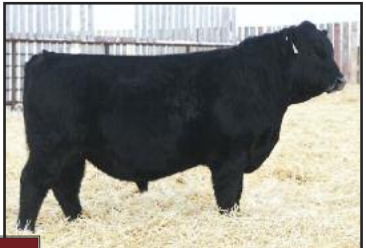
Lot 16 HLC 74U ALLIANCE 377A

This stylish bull is sure to add pounds and performance to your calf crop.