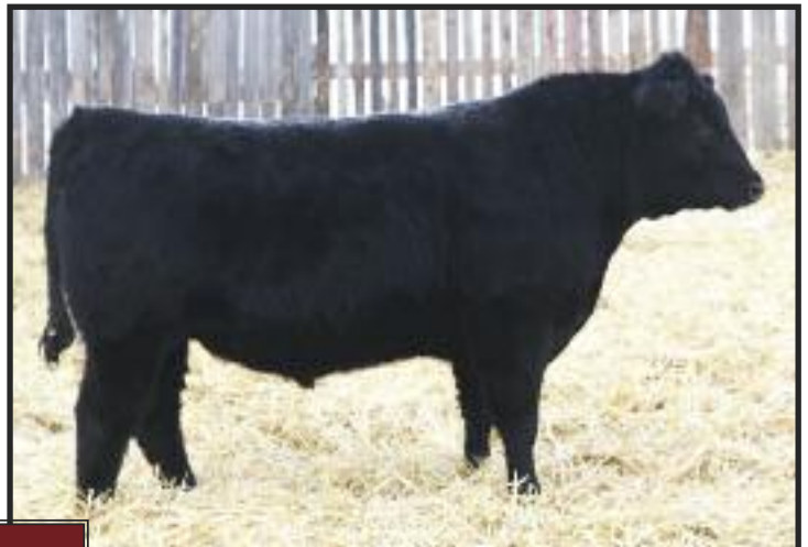
Lot 15 HLC 74U ALLIANCE 376A

A younger bull with lots of top, style and longevity in his family! Low birth, a true heifer bull!