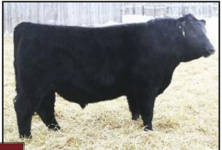
Lot 8 HLC 244Y IMPACT 317A

Oh boy, here is our first Impact son. Impact was the lead off bull in the 2012 Justamere Bull Sale. He was the high selling bull that we now Co-own with Justamere. As well Impact was the 2012/2013 junior champion show bull of the year, an award that is a first for us and that we were very honored to receive. Impact truly stamps his calves, if you like them deep and thick, here is your bull. The 41R is a true working female with power and that soggy look. She can raise them. Checkout this low birth weight bull.