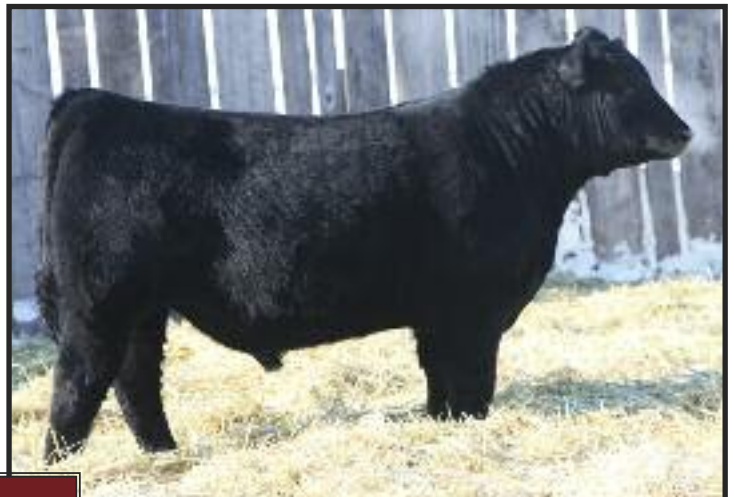
Lot 13 HLC 74U ALLIANCE 354A

This 74U son is sure to please. He is great fronted, deep sided, and out of the Black Bird 15J a never miss female that is a HLC favorite for the past 14 years. If you're looking to add longevity to your cow herd here he is.