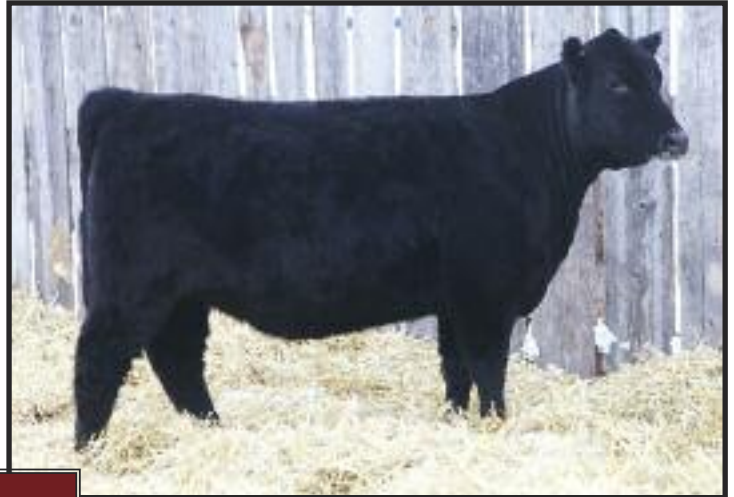
Lot 24 HLC 1220 LASS 268A

A very nice heifer, you have to admire her for her length of body. Stylish look, a great JR or 4-H project.