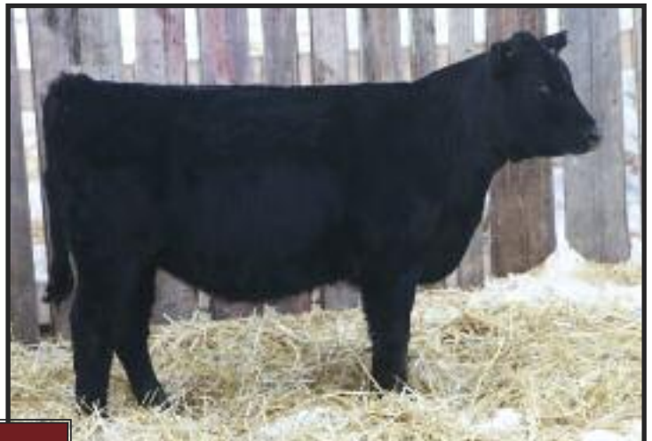
Lot 27 HLC 74U PRIDE 367A

A well-made March heifer here with Alliance on both sides of the Pedigree. You are sure to have maternal, maternal, maternal!