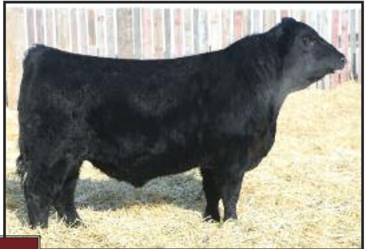
Lot 9 HLC 74U ALLIANCE 323A

Here is a red meat bull out of the 74U herd sire, super powerful, extremely long bodied bull with a lot of eye appeal. A maternal brother sold in 2013 to Trevor and Chelsey Protz.