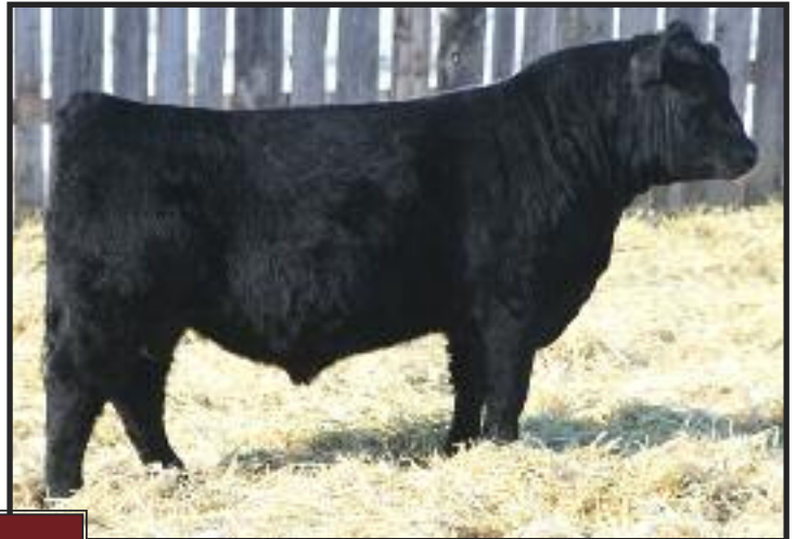
Lot 12 HLC 1220 WARDEN 351A

This Warden son you have to admire for his spring of rib, deep body, lots of top and nice profile and soggy make up and low birth weight. A maternal brother sold in 2013 to Rawluk Livestock, Moosehorn. MB.