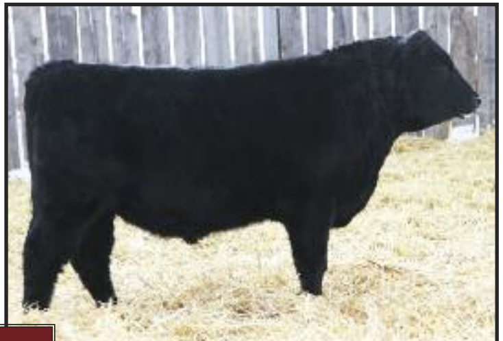
Lot 10 HLC 74U ALLIANCE 348A

Another nice bull out of the 74U sire, will work great on heifers. His dam Beauty 58P is a hard working, super female.