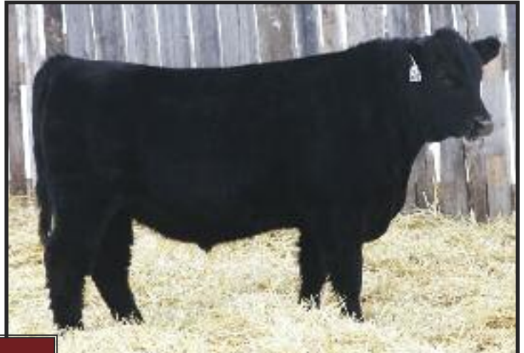
Lot 17 HLC 74U ALLIANCE 380A

A 74U son with growth and style. Out of a nice Rain Maker daughter. A low birth weight bull